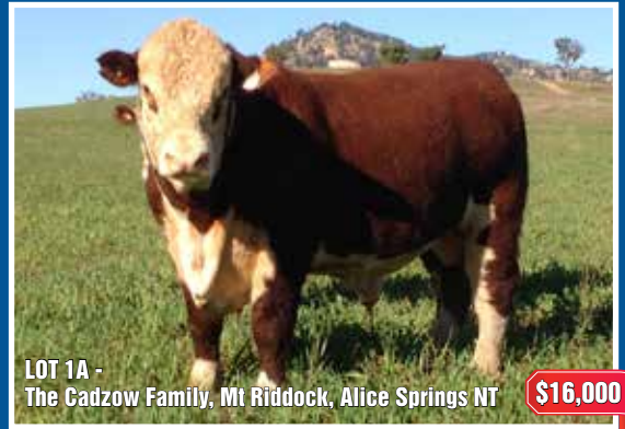
LOT 1A - The Cadzow Family, Mt Riddock, Alice Springs NT $16,000