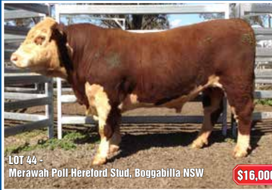
LOT 44 - Merawah Poll Hereford Stud, Boggabilla NSW $16,000