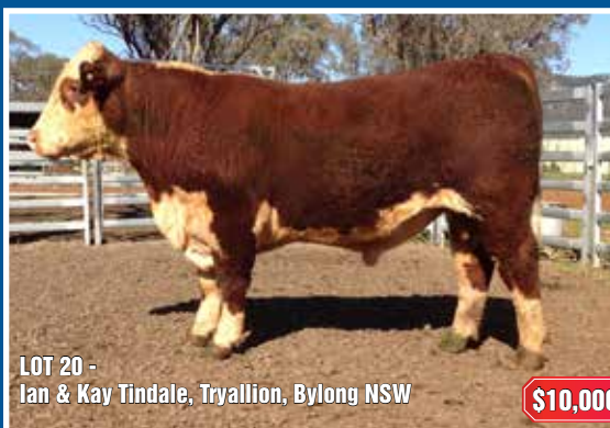
LOT 20 - Ian & Kay Tindale, Tryallion, Bylong NSW $10,000