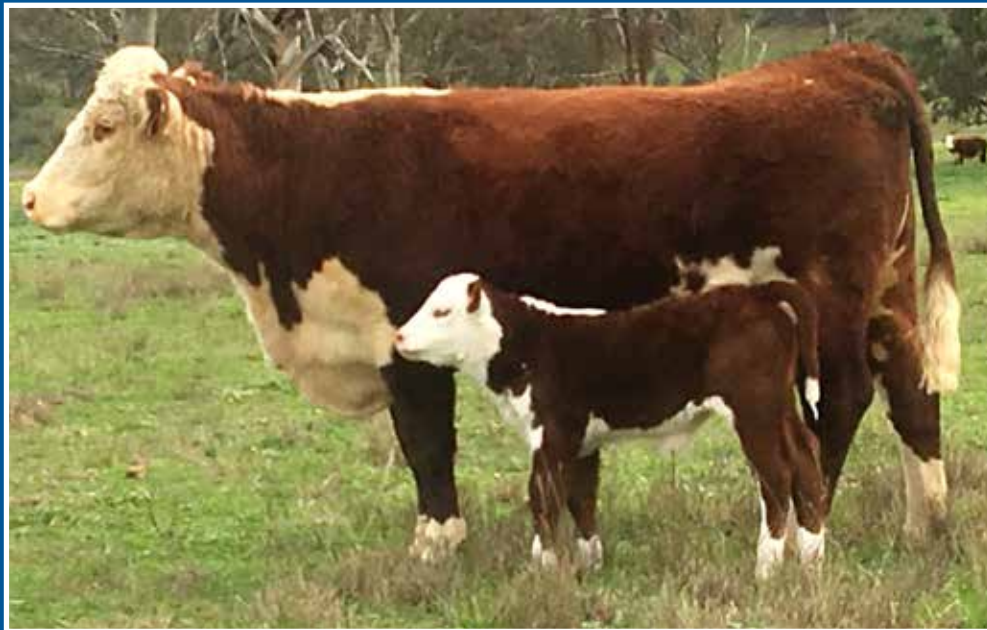
The first bull calf by Lot 1B SBT Flynn J286.