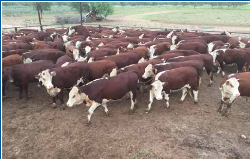
Group of Poll Hereford Steers being trucked from Mount Riddock fo feedlot. Milk tooth weighing 460kgs.