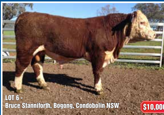
LOT 6 - Bruce Stanniforth, Bogong, Condobolin NSW $10,000