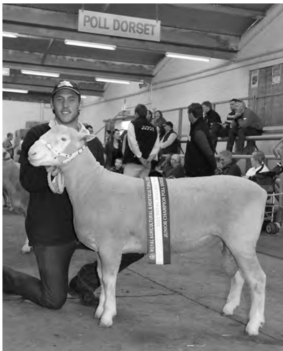
Viewdale 11066 Junior Champion Ram Royal Adelaide 2012.