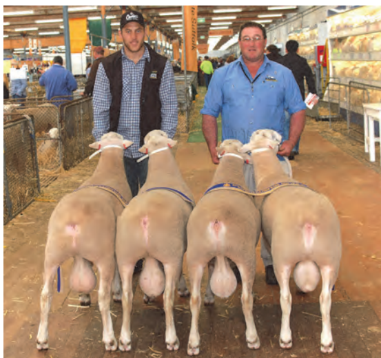
Anden White Suffolks winning the Lamb Production Class for Trade and the Lamb Production Class for Export at the 2015 Royal Adelaide Show.