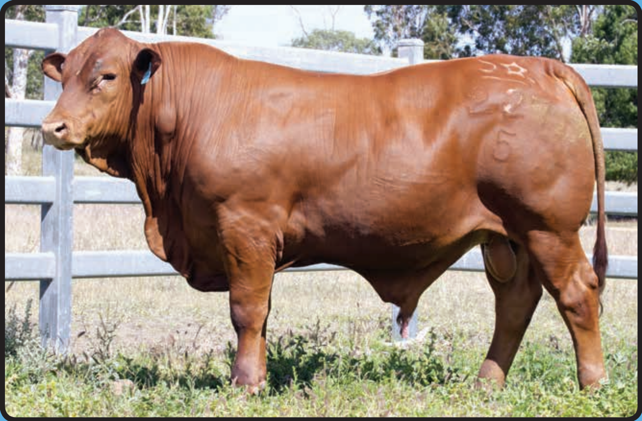
LOT 22 - 5 STAR 150227