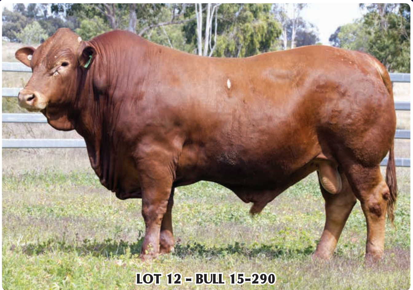
LOT 12 - BULL 15-290