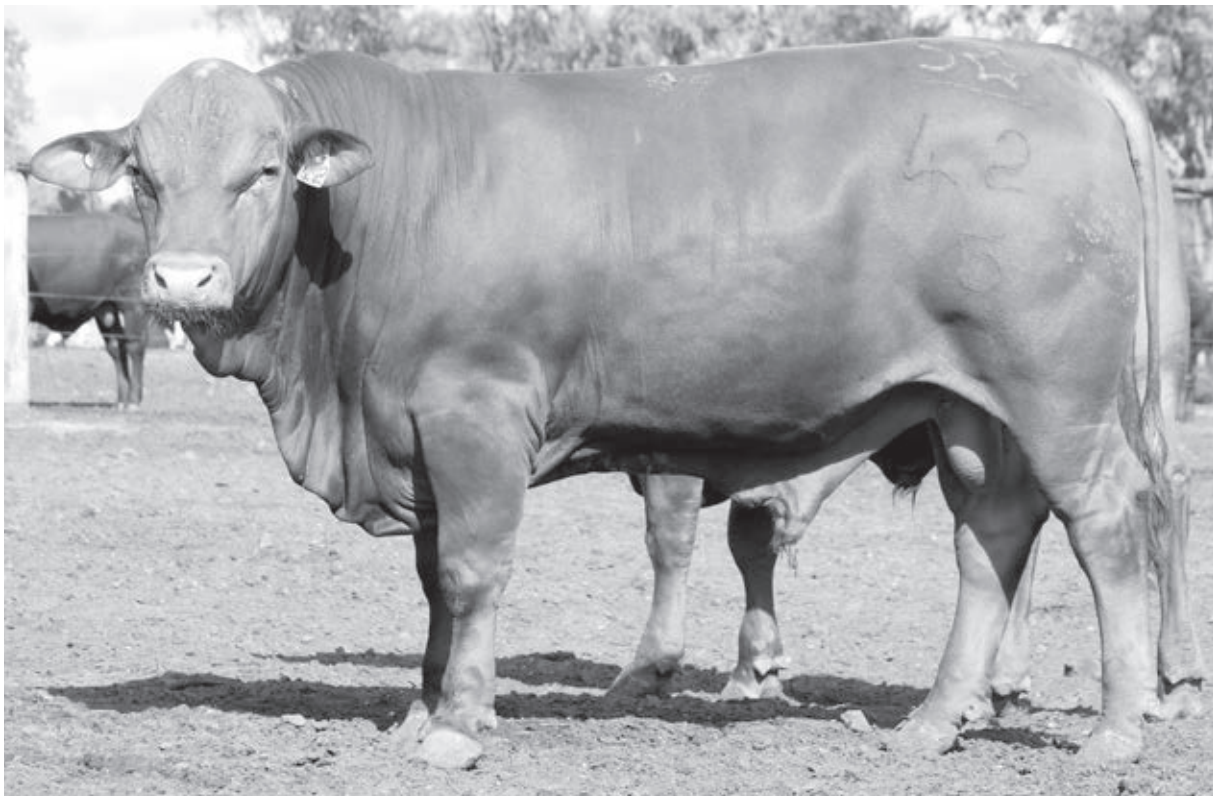
5 STAR 150042

3/4 Senepol & 3/4 Charolais. A moderate frame, very chunky Senelais sire. Clean coat and clean poll and a very placid temperament. He was 290kg at 10 months with a 30cm scrotal measurement. Very good quality semen.