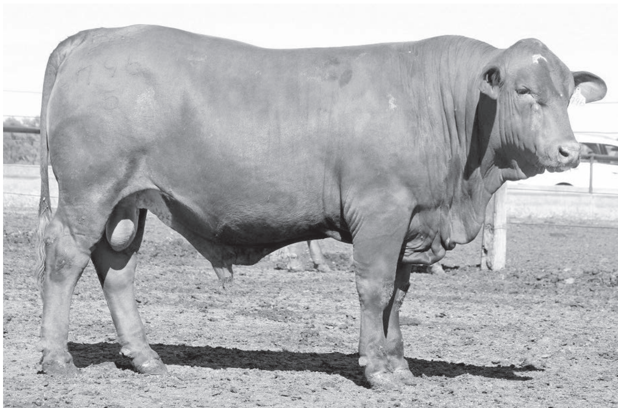
5 STAR 15-0796

Another favourite 796, was 418kg as a yearling with a 34cm scrotal circumference. A long, large capacity sire with broad topline and bomb proof temperament, means he is worth a second look. 7/8 Senepol.