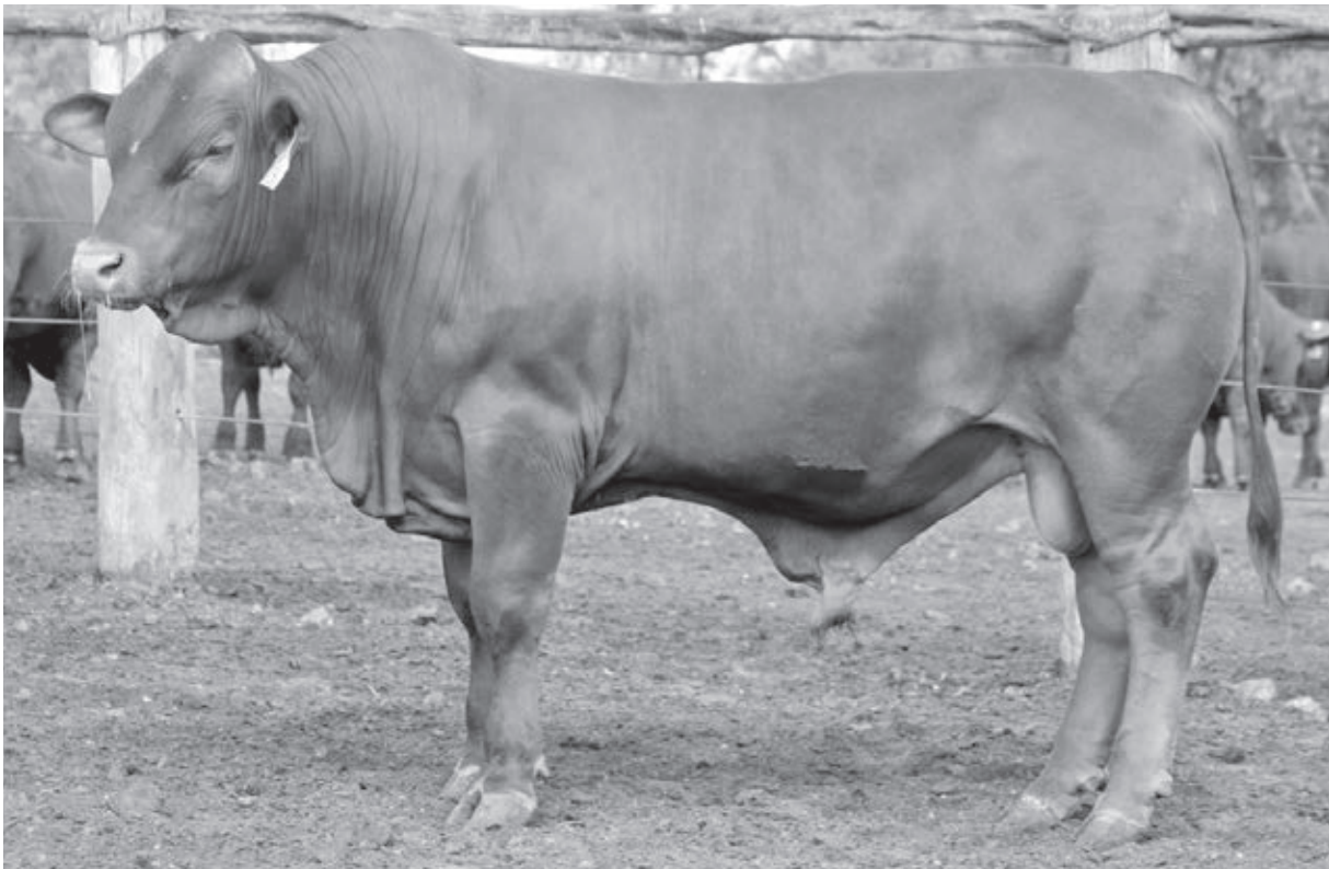
5 STAR 15B003

25% Sen, 25% Bonsmara and 50% Belmont approx. The first of our T.A.T.S bulls. Tropical Adapted Taurus, with a blend of Senepol, Bonsmara and Belmont. B003's dam has had 4 calves in 4 years and grand dam had 7 calves in 7 years. He had a yearling weight of 314kg and a 34cm scrotal at 14 months. EBV's available.