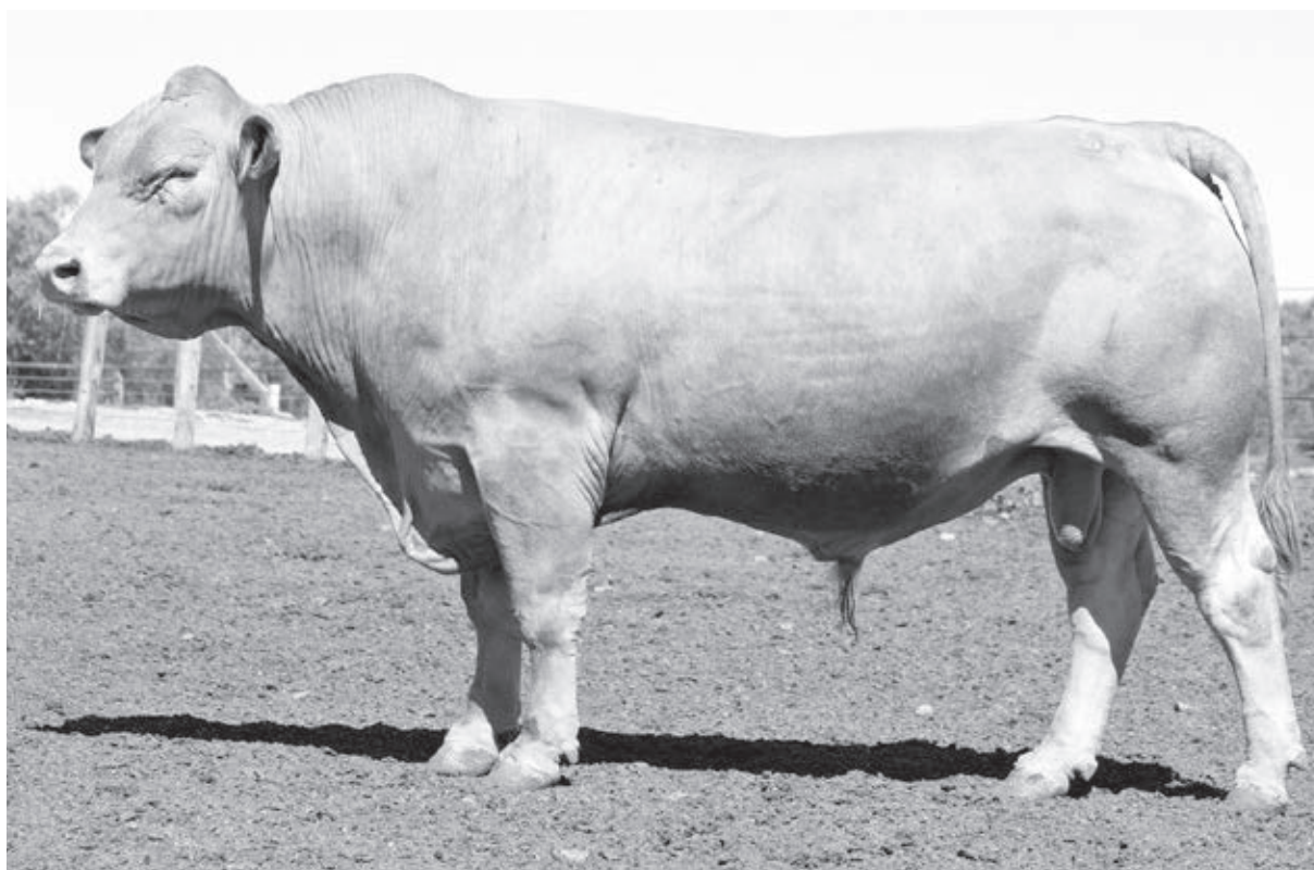
5 STAR 140436

50% Char, 50% Senepol. A long, large, slick coat Senelais sire. Combining the successful carcass genetics of Kingston, with the fertility of Palgrove Reckon 24 (she had 8 calves in 8 years). Red factor, slick, 436 offers a great potent option, over crossbred and Bos Indicus cows. At 15 months, 436 was 460kg with 30cm scrotal.