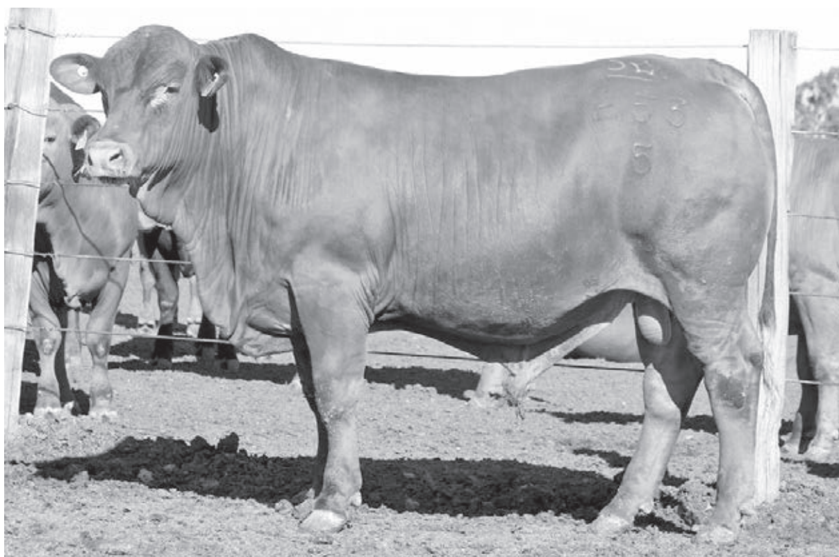
5 STAR 15-253

One of my favorites, good frame, well muscled and very good scrotal circumference, all equates to an all round high performance package. Bred up from Mt. Eugene bloodlines, underwrites his productive traits, with many decades of performance recording in tickey, Central Queensland environments. 7/8 Senepol, 1/8 Foundation bloodlines.