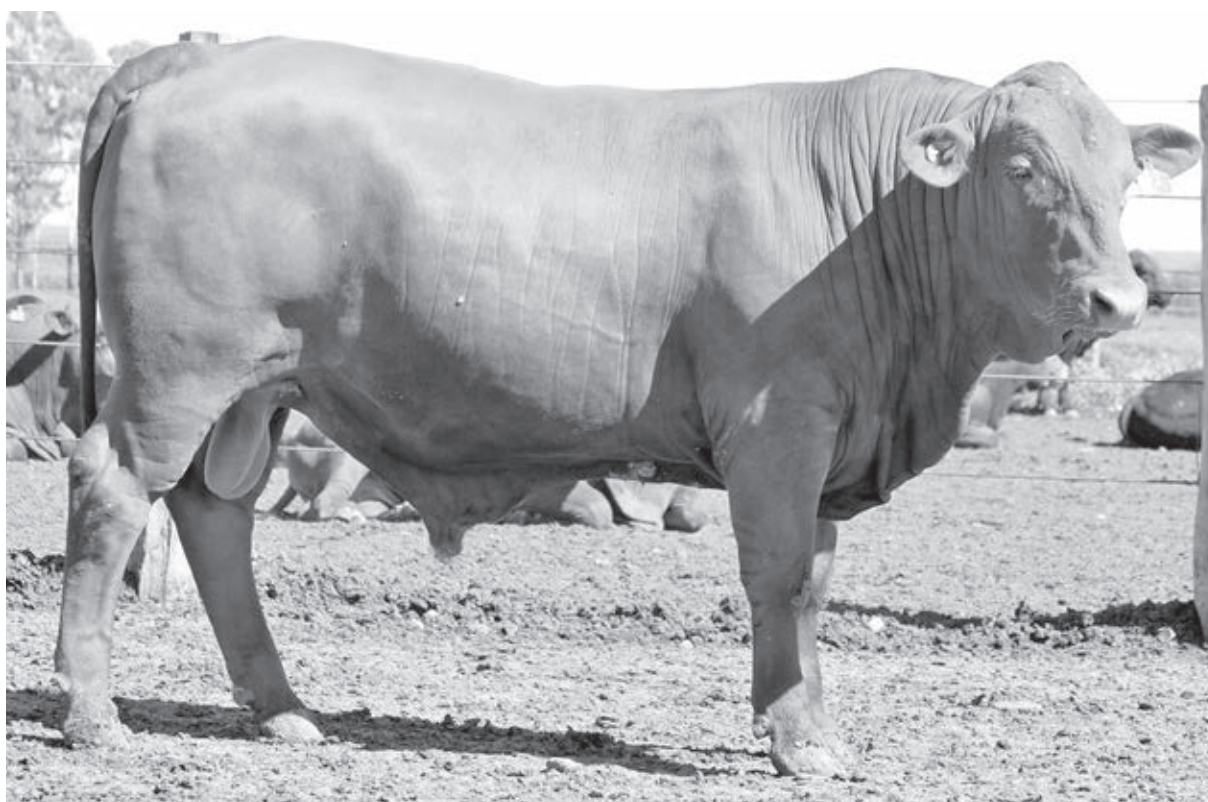
5 STAR 15-0463

A very tidy uniform young sire displaying all the desirable traits, symbolic of the Senepol. 463 had a yearling scrotal of 32cm and a yearling weight of 345kg at 12.5 months. A half brother to the growth rate winner at the Callide Dawson Carcase Competition this year.