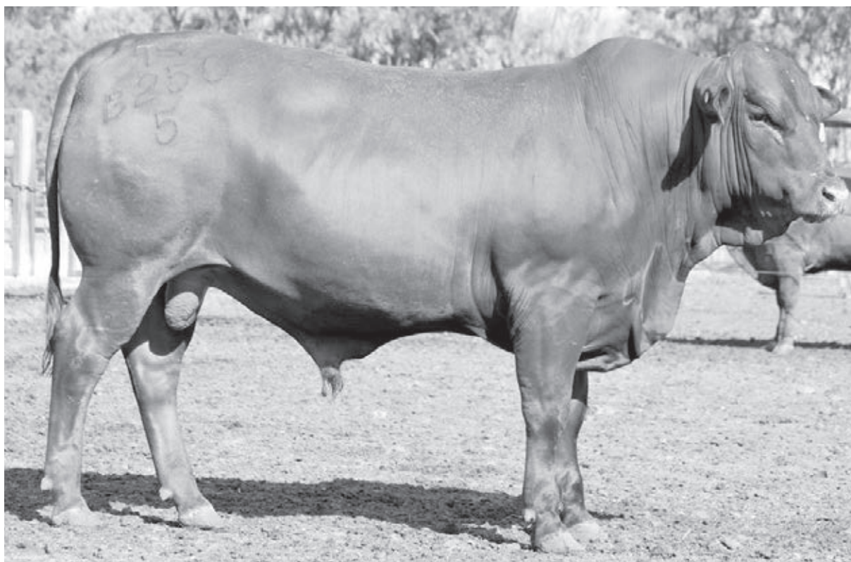
5 STAR 15B250

25% Sen, 25% Bonsmara and 50% Belmont. B250's dam has had 3 calves in 3 years, due her 4th next month. His grand dam had 6 calves in 6 years. At 12 months he weighed 283kg and had a 29cm scrotal, now 37cm.