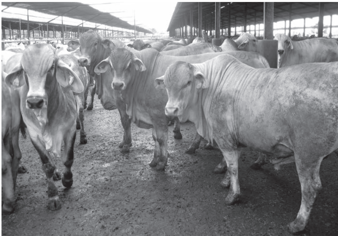
Senepol / Brahman cross steers in Elders Indonesian feedlot