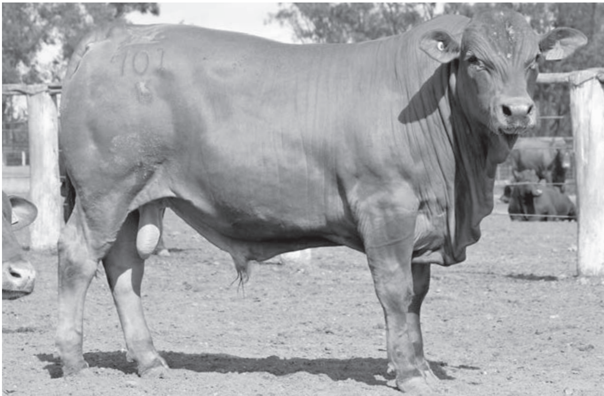
5 STAR 150701

62% Sen, 38% Belmont. 701's dam has had 6 calves in 6 years. Yearling weight and scrotal were not recorded. He is an eye catching young sire with high yielding muscle pattern. As mentioned, we believe V.B.M. (Value Based Marketing), where the meatworks will move to paying on actual meat yield, more meat, less for bone and excess fat, will bring these type of sires to the fore.