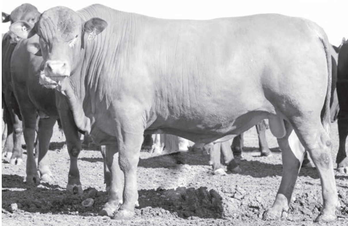
5 STAR 15-762

762 is a consistent, slick, even type of sire with strong poll and beautiful disposition. He was 310kg at yearling with a 31cm scrotal. Above average growth with good early semen production. 2.18kg a day for 57 days. 7/8 Senepol.