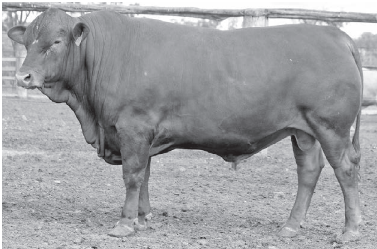
5 STAR 150710

710 is pidgeon pair with the previous Lot 42. Long, thick and well covered.