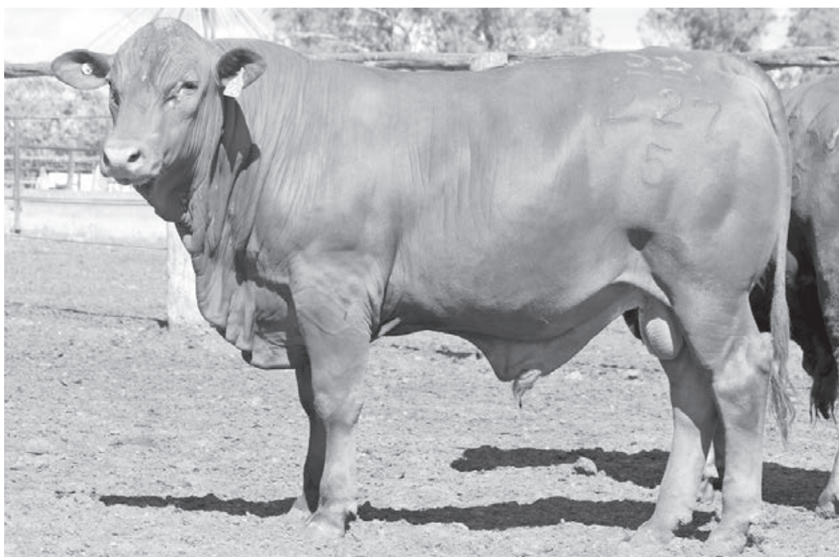
5 STAR 15-0227

227 is an eye catching, very young sire, only 19 months but is under written by the consistent performance of himself, his brothers & sisters retained in our breeding herd. Even at 19 months, 227 is credited with 36cm scrotal.