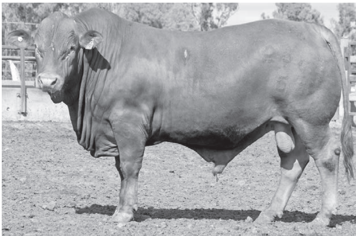
5 STAR 15-0290

A good early maturing, early puberty sire. Was 346kg & 33cm scrotal as a yearling. We used him lightly over heifers as a yearling sire. Showed great muscle pattern as a weaner and produced good quality semen at 12 months of age. As the industry moves to V.B.M., value based marketing, these moderate bone, well muscled sires that can produce fat cover, will come into their own. 290 possesses a beautiful temperament and very placid nature. 7/8 Senepol, 1/16 Bonsmara, 1/16 Belmont.