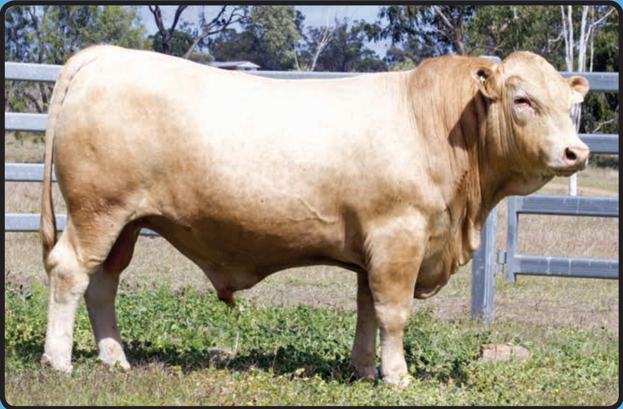
LOT 72 - 5 STAR 150067