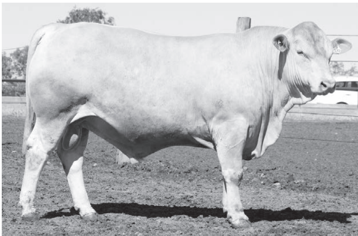
5 STAR 150058

50% Senepol, 50% Charolais. Slick coated, eye catching young sire. Placid nature. 339kg at 12.5 months with a 31cm scrotal. Combining Palgrove, Ayr, Hazeldean and 5 Star lines.