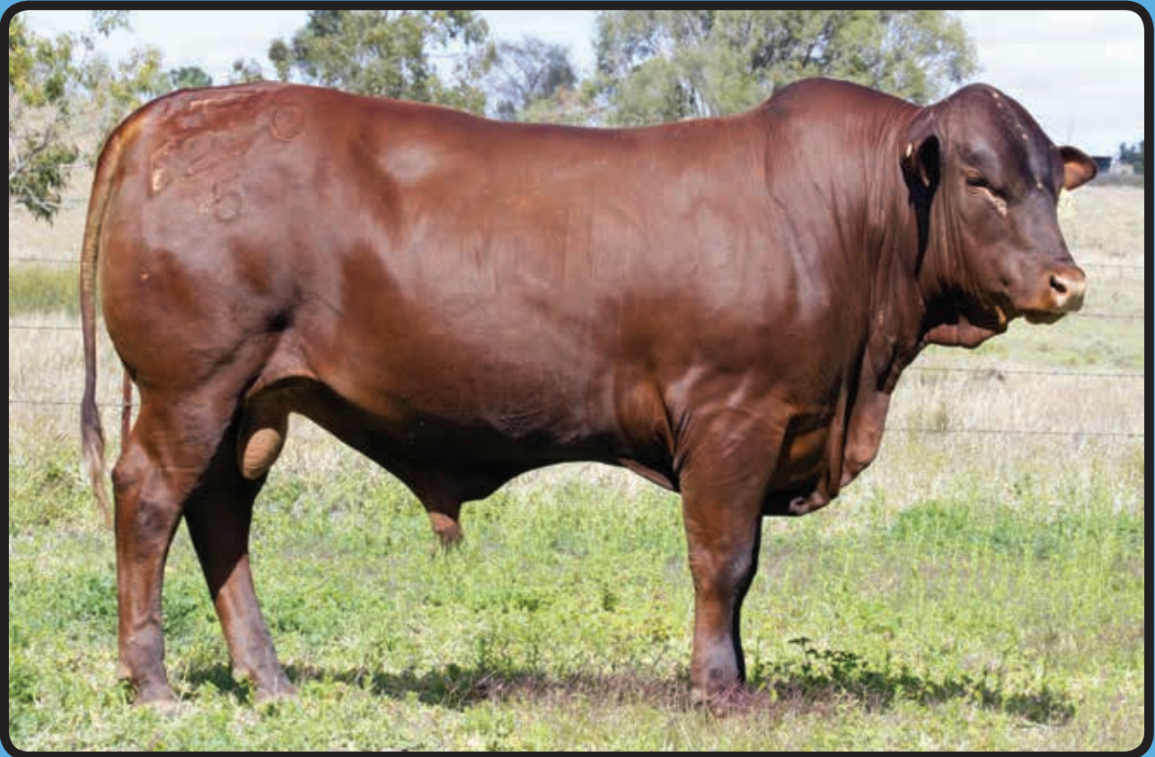
LOT 55 - 5 STAR 15B250