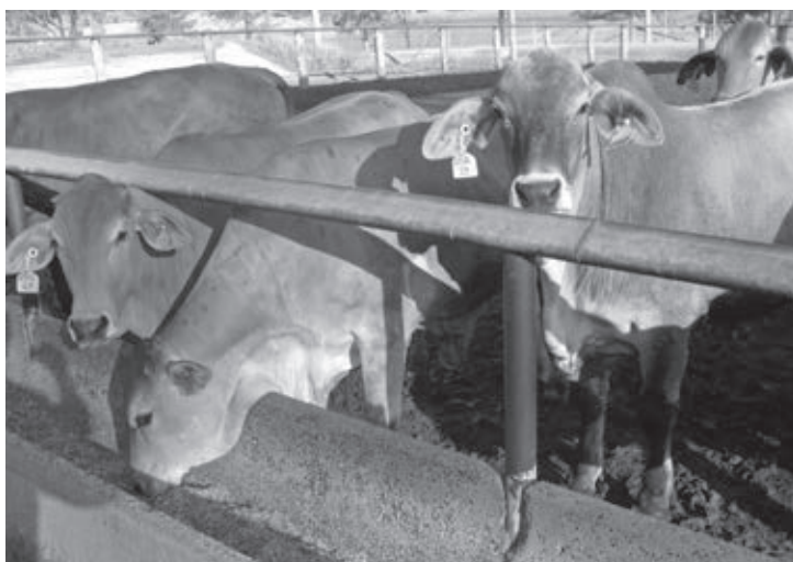
Photo: F1 Senepol and Brahman steers in the Smithfield feedlot.