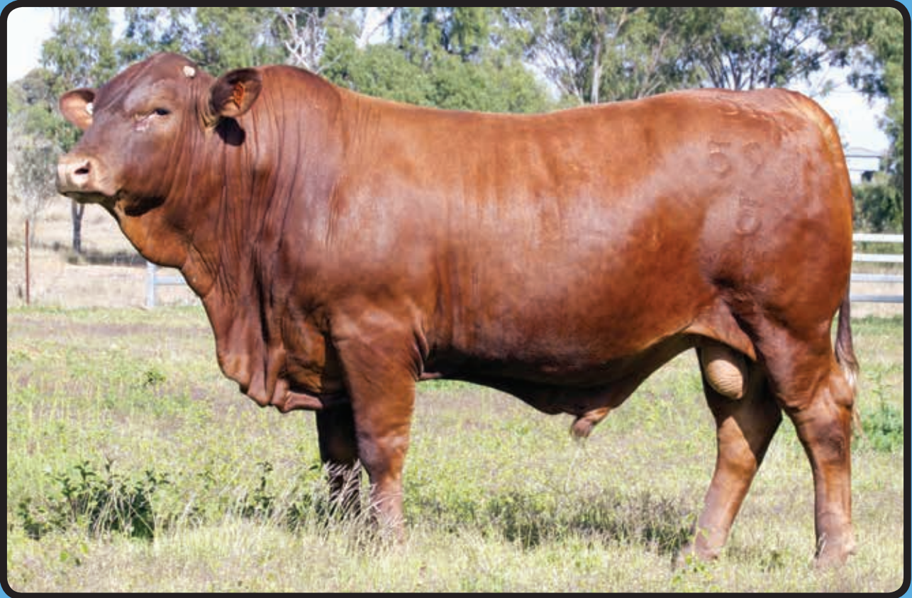
LOT 13 - 5 STAR 150593