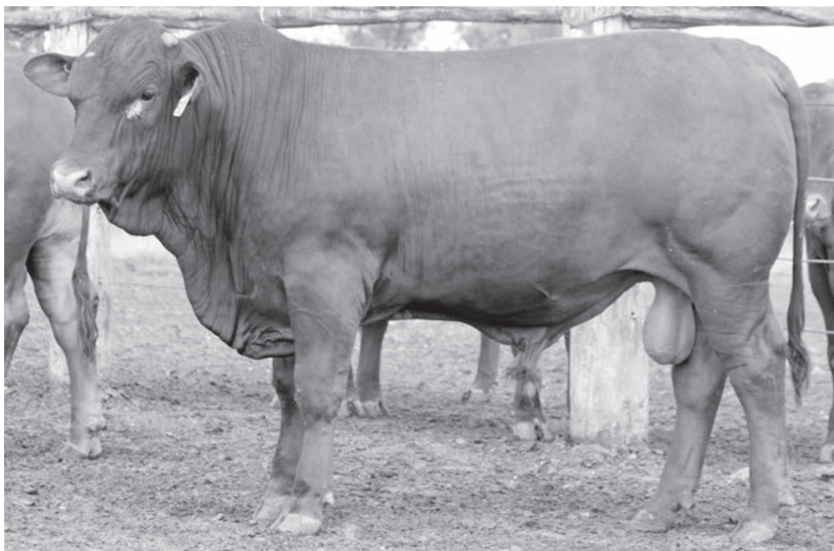
5 STAR 15B291

25% Sen, 25% Bonsmara and 50% Belmont. B291's dam has had 3 calves in 3 years and her grand dam had 9 calves in 9 years. B291 was 298kg with a 30cm scrotal at 12 months of age.