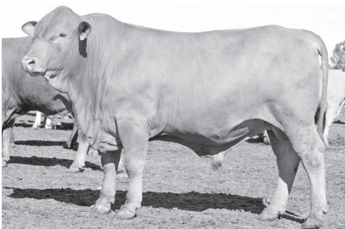
5 STAR 15-0776

776 is a safe bet, that has jumped the performance hurdles throughout. He was third in the siliage test for 57 days, putting on 2.95kg a day. A yearling he was 367kg with a scrotal of 32cm. 12-500 is still being used at the research station and handles the ticks and flies. 7/8 Senepol, 1/8 Foundation Cow.