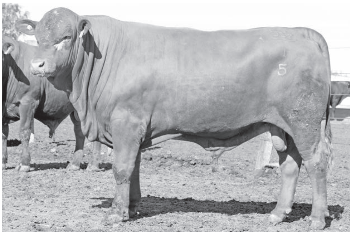
5 STAR 15-0001

5 Star Brandy was Junior Champion Female at Beef 2012 and has done a good job since with her 4th calf due later this year. 5-1 is a great mix of fertility, libido & carcass yield with Longfellow and Brandy in her mix. He has a hefty weaning weight of 328kg at 9 months and has not disappointed since.