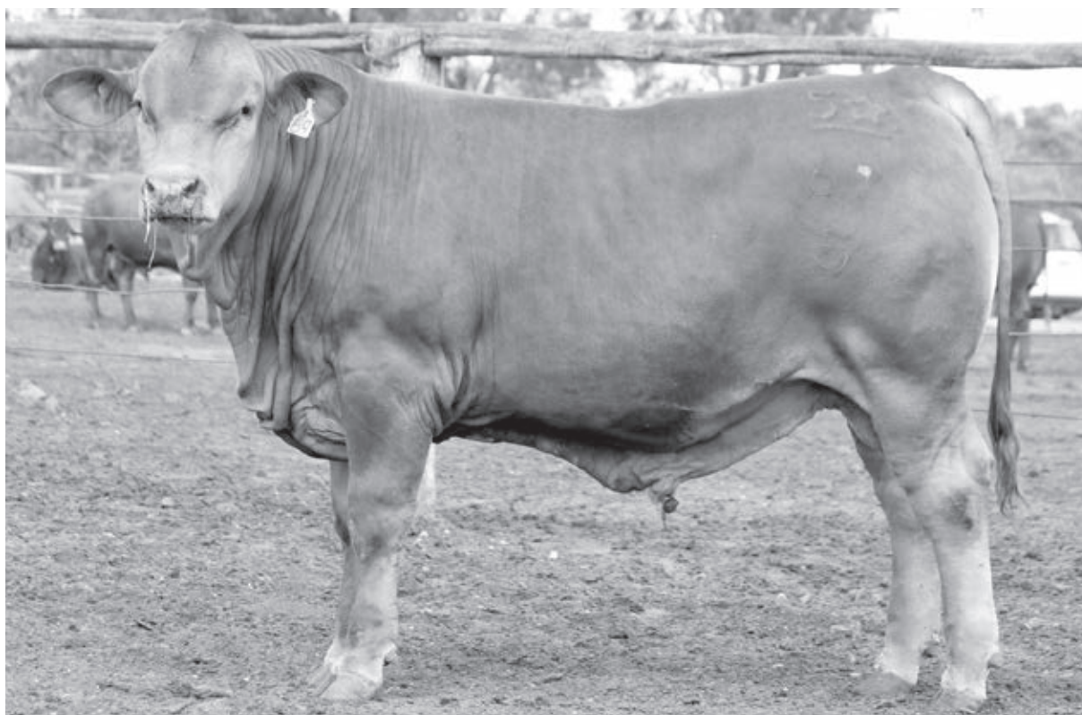
5 STAR 150069

A very young sire in Lot 80, similar to 79, slick and chunky. Will keep growing, going by the mature size of his parents. Quiet and offers a great alternative to any crossbreeding programs.