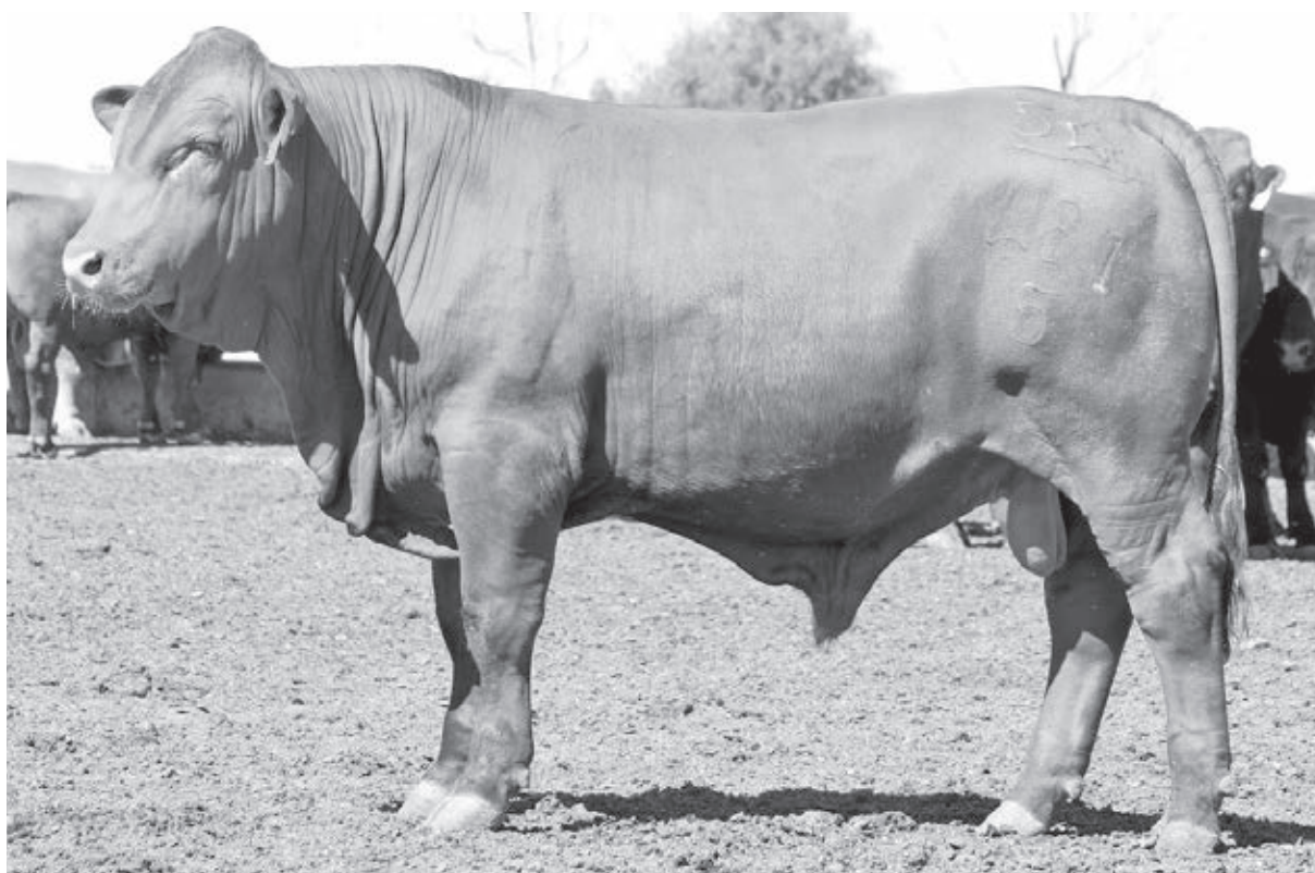
5 STAR 15-0481

481 is out of a two year dam, that was awarded Grand Champion Female at Beef 2015. 481 is a thick set, moderate framed young sire that has desired thickness from brisket to tail. 5 Star Katness has calved successfully the next two seasons with striking progeny.