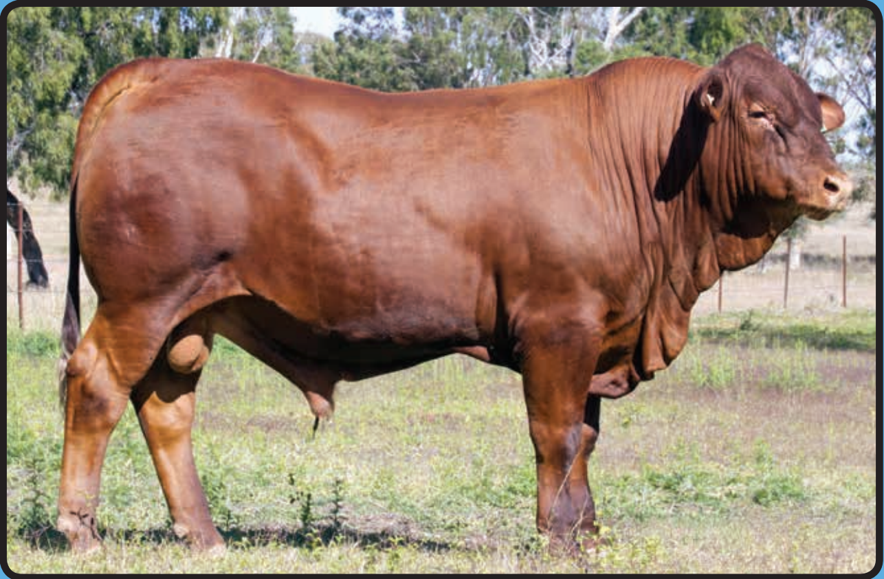
LOT 5 - 5 STAR 150259