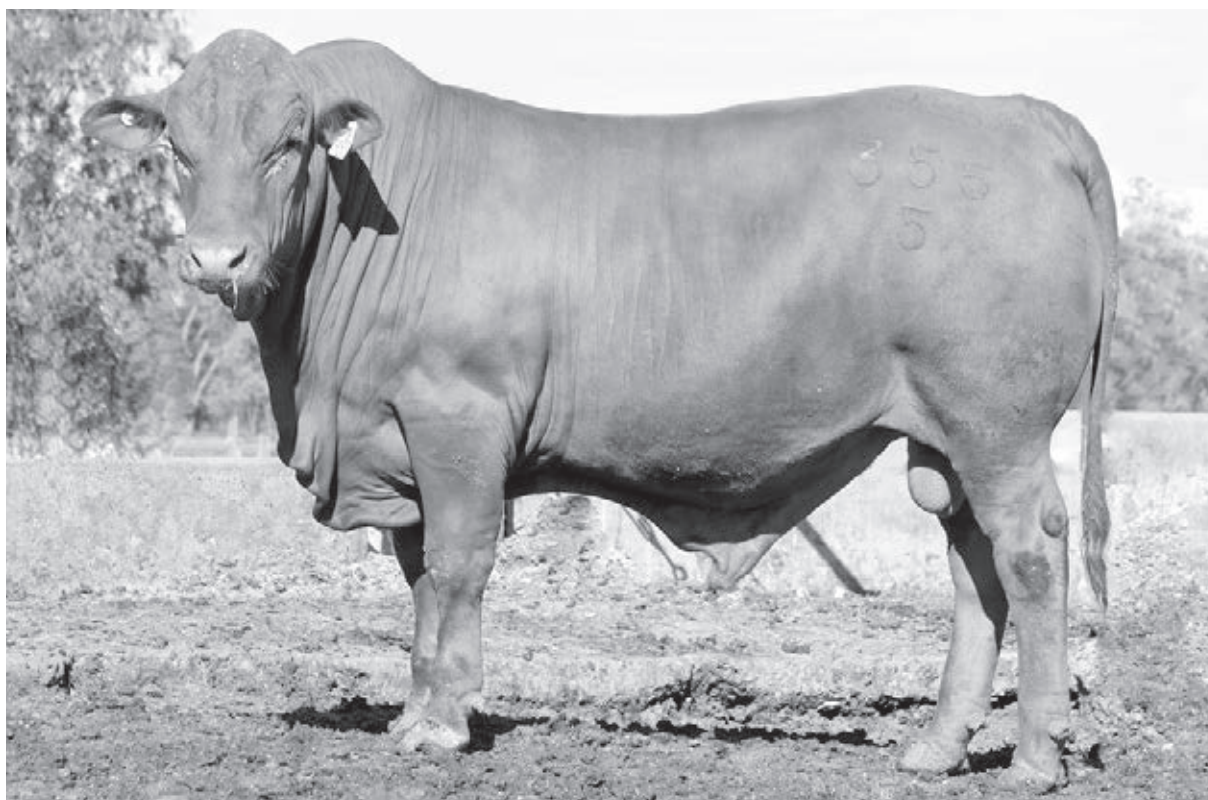
5 STAR 15-0355

A great example of a tropically adapted Bos Taurus Sire. Slick coat, plenty of capacity with high yielding carcass traits. Our Sire 914 displays easy doing characteristics whether it be dry or wet, always maintains some fat cover, which we believe is important for re-breeding rates in the female lines. 7/8 Senepol, 1/8 Foundation bloodlines.