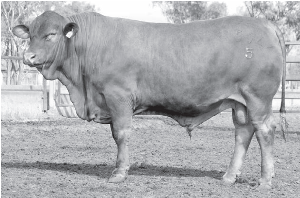
5 STAR 15-0394

Bred up from Mt. Eugene Bloodlines, 394 has one of the best growth rates of the draft. One of the youngest in the draft. Large scrotal & impeccable temperament coupled with that top end performance makes this young sire hard to go past. 7/8 Senepol, 1/16 Charbray, 1/16 Belmont.