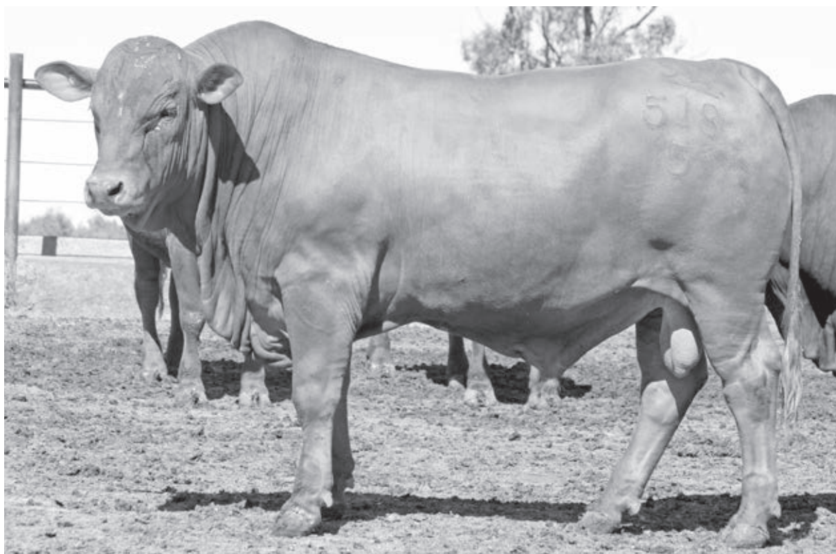
5 STAR 150518

3/4 Senepol, 1/4 Bonsmara. 518 is eye catching for his high yielding muscle pattern, good growth and ability to cover. With a splash of Bonsmara in his makeup, he adds a little extra hybrid vigour in subsequent generations. 332kg and 31cm scrotal at 13 months.