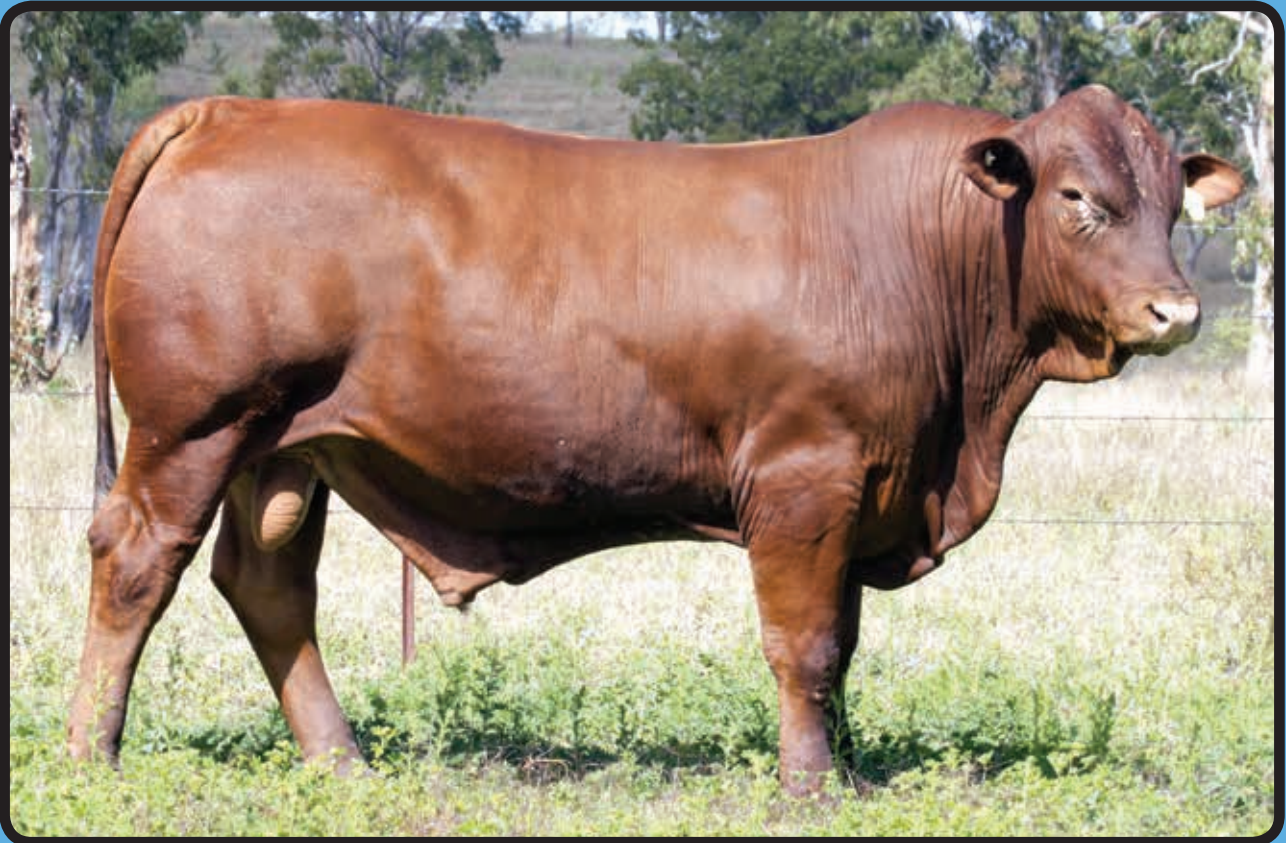
LOT 8 - 5 STAR 150038