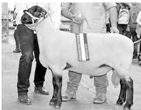
Kerangie 150530 – Lot 187

2016 Royal Adelaide Show – Grand Champion Suffolk Ram