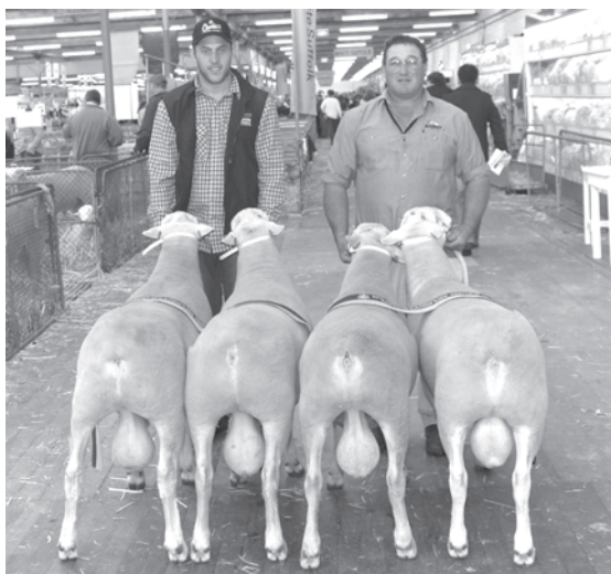
Anden White Suffolks winning the Lamb Production Class for Trade and the Lamb Production Class for Export at the 2015 Royal Adelaide Show.