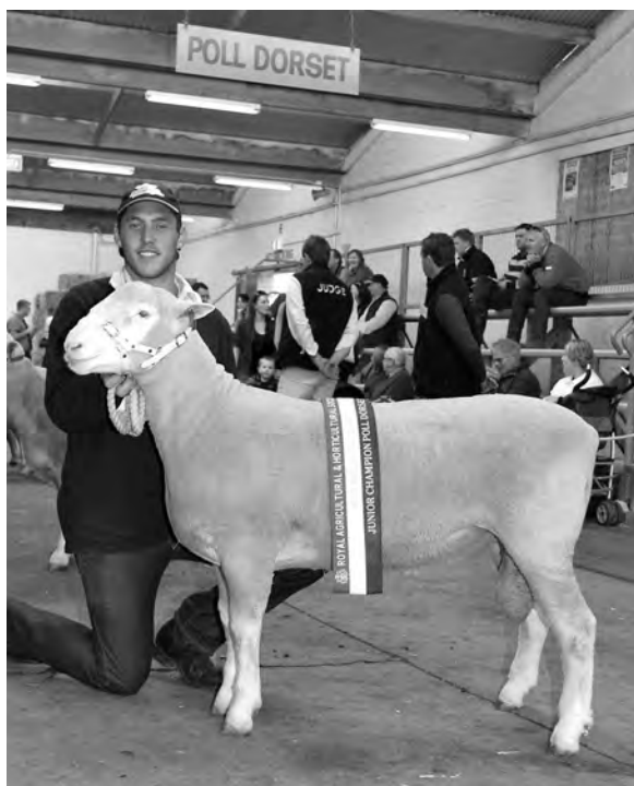
Viewdale 11066 Junior Champion Ram Royal Adelaide 2012.