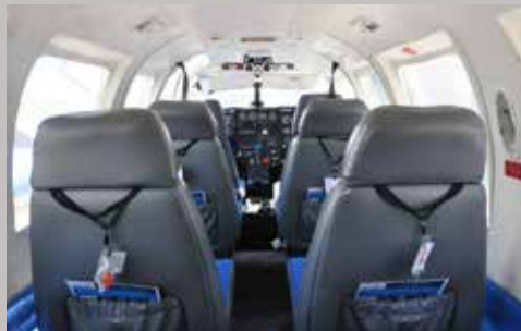
Located 2 minutes walk from Mackay Domestic Terminal

Fly 'n' Golf Mackay to Hamilton Island. Return Day trip includes flights, transfers, Green fees & Golf Cart hire From $465 pp