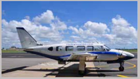
Operating fast twin engine, comfortable airconditioned Aircrafts