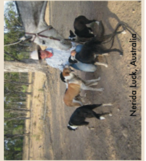
Nerida Luck, Australia

"Since using BioAktiv formula 1, my dogs are healthier, more content & physically at their peak. Kennels have less smell & no fleas. Plus feed costs have lowered due to not needing to feed as much. They're utilising food much more efficiently. This is great when feeding 14 dogs."