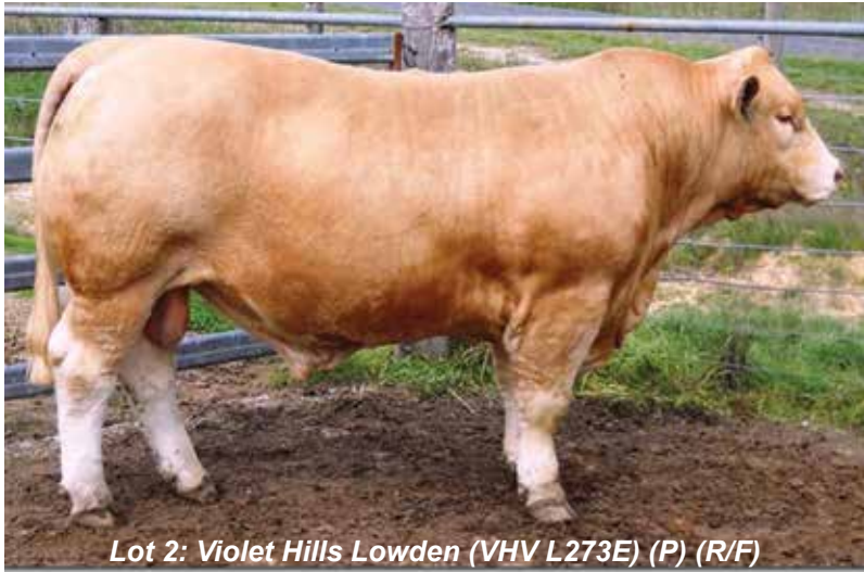
Lot 2: Violet Hills Lowden (VHV L273E) (P) (R/F)