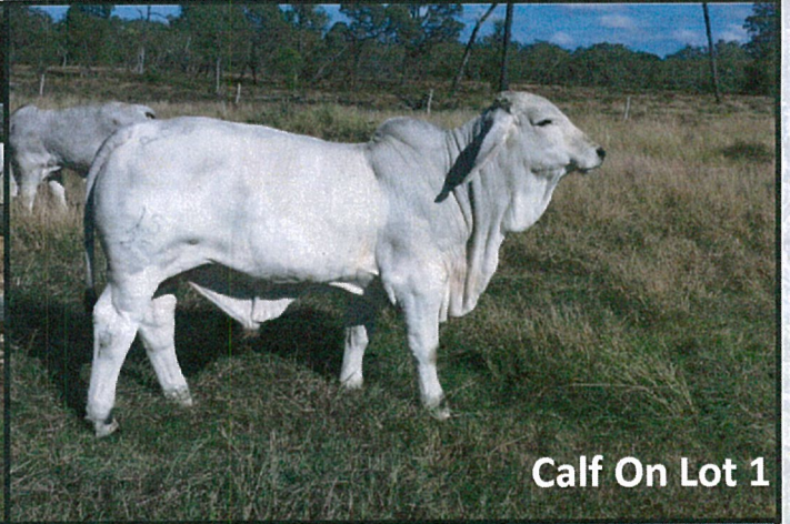
Calf On Lot 1