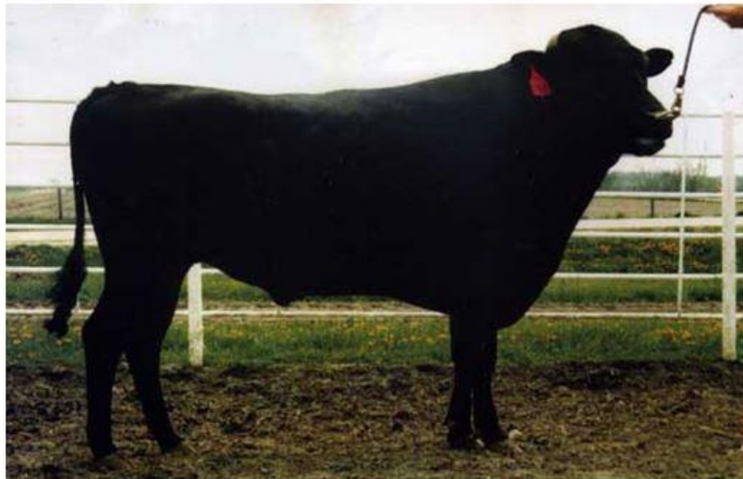
SHIGESHIGENAMI (JAP) – FUKUYUKI (JAP)

Sire of Embryos; ITOSHIGENAMI TF 148 (IMP JAP) is regarded as one of the Australian Wagyu breeds best ever marbling sires, and his stock are now commanding high prices. Embryos have recently sold for $1,100 each and his daughters sold for up to $11,000, a top marbling sire that is in demand.