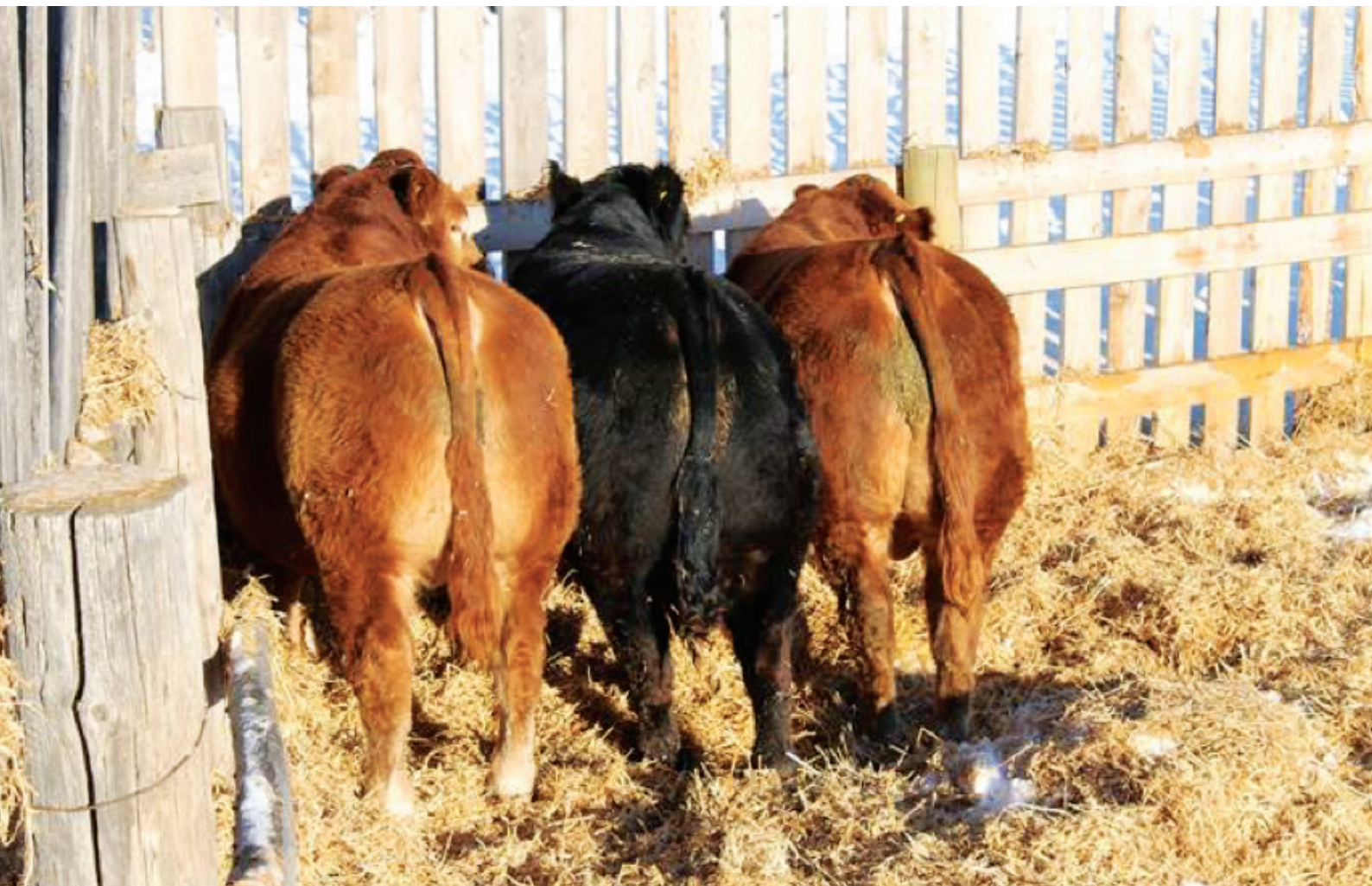
Three RPY Paynes Derby sons at B Bar Cattle, Lucky Lake, Saskatchewan Left to Right – B Bar Brick, B Bar Soot, and B Bar Cognac.