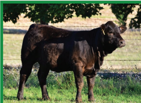
Lot 31 - RLF Yardley heifer