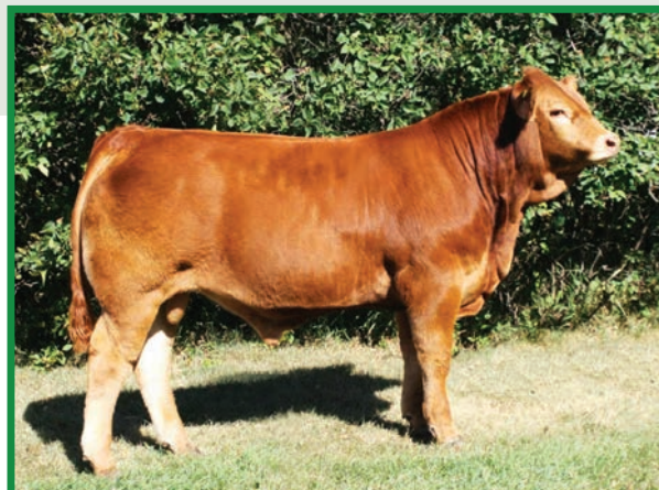
GHR Polled Aftershock- sire of embryos

GHR Polled Aftershock (Polled) Bodell Polled Utmost HBL Polled Terrific Maryvale Waitress 12 (3203) Broombee Lumberjack S722 Maryvale 601