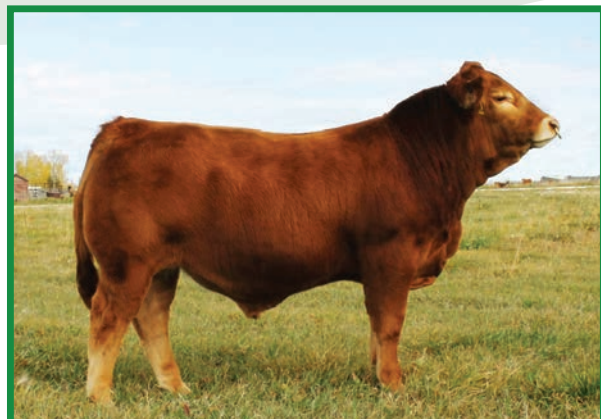
Ivy's Bubba Watson in October 2014 (9 months old)

Ivy's Marksman ROMN Tuff Enuff Ivy's Xpect the Best Auto Dollar General Ivy's Unique Perfection Ivy Polled Near Perfect