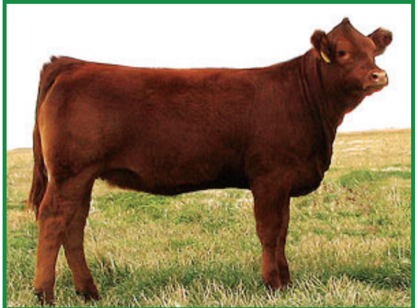
Ivy's Shazam Daughter from Ivy Livestock

Identifier IMCPCPB15 DOB 18/01/06 Age 9 years Pedigree Wulfs Rambler Wulfs Klint Wulfs Example L7 Lucky Me Ivy Polled Near Perfection Ivy's Knotty