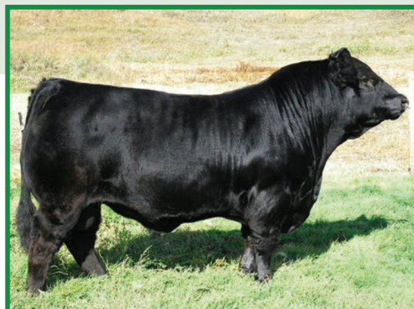
RPY Paynes Derby - sire of embryos

RPY Paynes Derby (Homo Polled) KAJO Responder Ivy's Polled Princess Maryvale Glitter G105 (Polled) TMF Westwood Palmdale Shantal