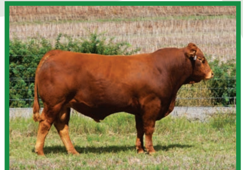
Lot 13 - TMF Arizona son