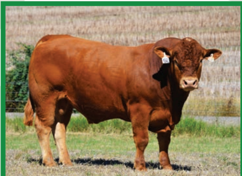
Lot 5 - TMF Westwood son

Comment: 5 straws of semen from each of your three favourites! You pick which 3 of the 4 bulls you would like semen from! An excellent medley of four of our high performance Canadian semen sires to choose from here. The legendary Homo Polled TMF Westwood that has achieved so much for us, the exciting new addition to Polled French Pure genetics in GHR Polled Aftershock, the big numbered Homo Polled and Homo Black RLF Yardley, and the Homo Polled performance powerhouse TMF Arizona! The last TMF Westwood semen to sell made $250 per straw. We are impressed with what this group of sires have achieved for us in moderating birth weight while also increasing early growth and performance. They have achieved this while maintaining the phenotype and body type that we strive for. To date these bulls have also allowed us to increase muscle volume while also adding softness and improving finishing ability. They are very strong maternally. TMF Westwood, RLF Yardley, and TMF Arizona all have self replacing $ Indexes in the Top 10% of the Limousin breed. A great team of bulls that provide some real scope to take your breeding program in an exciting direction!