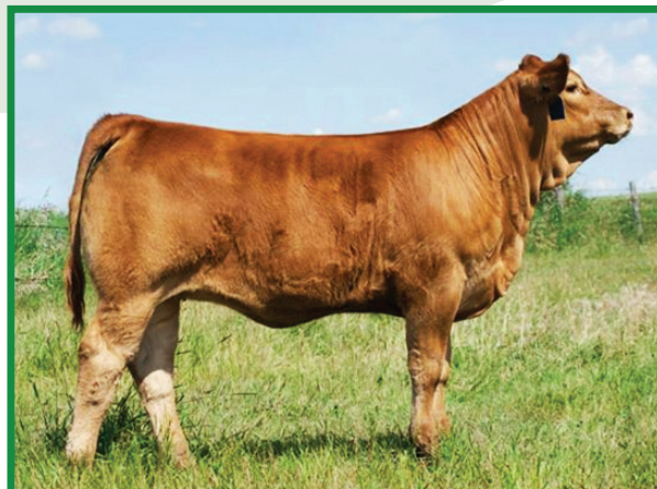
An SKL Polled Lady daughter sired by Wulfs Rambler

GHR Polled Aftershock (Polled) Bodell Polled Utmost (P) HBL Polled Terrific (P) SKL Polled Lady (Homo Polled) L7 Lucky Me Ivy's Polled Jessica