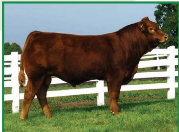
TMF Westwood - sire of embryos

TMF Tankard TMF Westwood (Homo Polled) TMF 902P Refstrup Tabias Maryvale Designer 8129D (Polled) Maryvale 9801