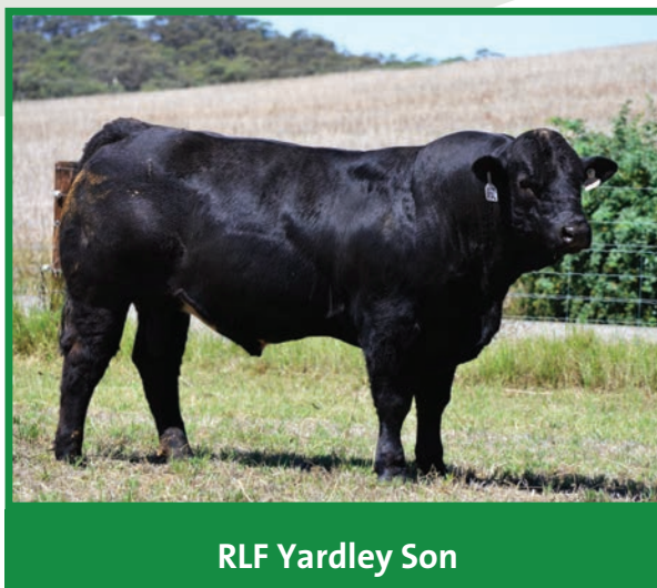
RLF Yardley Son