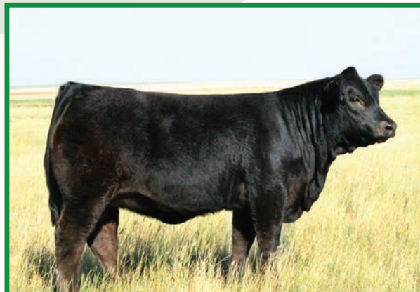
RPY Paynes Derby daughter - B Bar Urban Girl 100 A