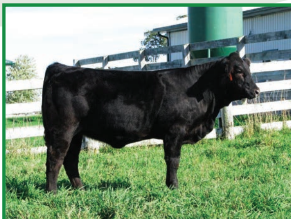
TMF Arizona daughter - TMF Miss 29A