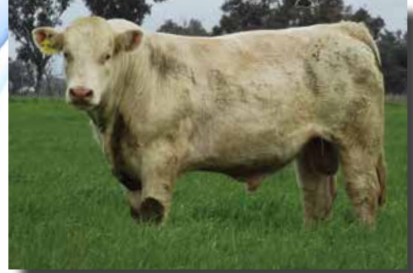
June 2015 Australasian Charolais GROUP BREEDPLAN

AIRLIE WEAPON (A1S W44F) AIRLIE KELLY Q167E (A1S Q167E)