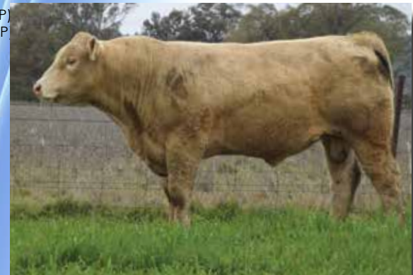
June 2015 Australasian Charolais GROUP BREEDPLAN

Airlie Jumbuck is a polled red factor bull. If you are looking for a vealer bull here he is.