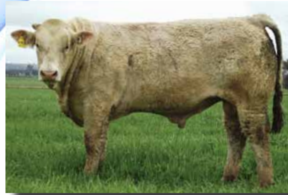
June 2015 Australasian Charolais GROUP BREEDPLAN

Airlie Jellybean is a thick moderate bull that is sound, a complete package. By Airlie Fiable. A good balance of figures.