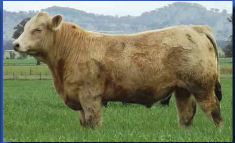
LOT 40 AIRLIE KAURI K37 (P)(R/F)