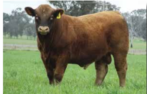
June 2015 Australasian Charolais GROUP BREEDPLAN

Airlie Jonty is a polled Very Red factor bull. Displaying thickness and softness. A very good bull.