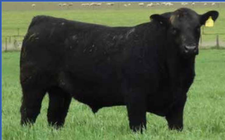
LOT 3 TALIS JETT J817