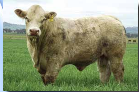
June 2015 Australasian Charolais GROUP BREEDPLAN

Airlie Joyful is a polled, powerful young bull, with a good squareness.