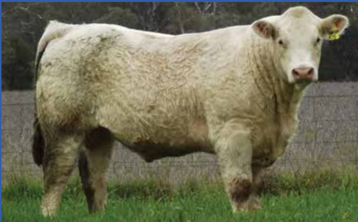
LOT 39 AIRLIE KEEPSAKE (P)