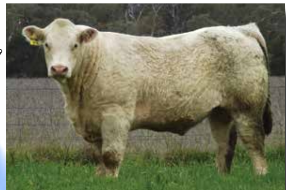
June 2015 Australasian Charolais GROUP BREEDPLAN

Airlie Keepsake a polled E/T calf by LT Ledger. A moderate bull that is thick and soft. A young bull with real power and a low birth EBV.