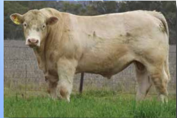
June 2015 Australasian Charolais GROUP BREEDPLAN

Airlie Jovanni is a polled red factor bull who is square hipped, thickset in a moderate soft package.