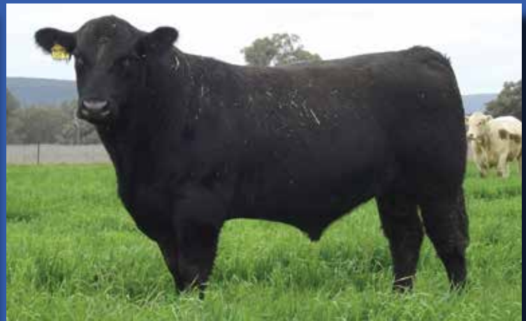
LOT 7 TALIS JENSEN J356