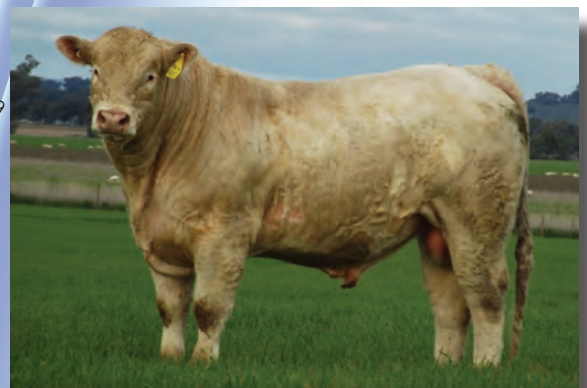
June 2016 Australasian Charolais GROUP BREEDPLAN

Airlie Kagimoto is a polled calf by A.I sire LT Ledger. Typical of Ledgers he is thick, soft and very complete. Makes the top 5% for Rib and Rump fat. Top 10% for IMF.