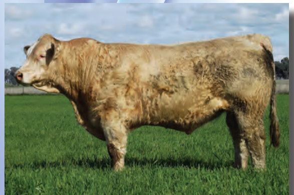
June 2016 Australasian Charolais GROUP BREEDPLAN

Airlie Kit is a polled Red Factor calf by LT Ledger. Another well figured bull that smashes the index's. A brother to last years top priced bull. A complete bull with that very important softness.