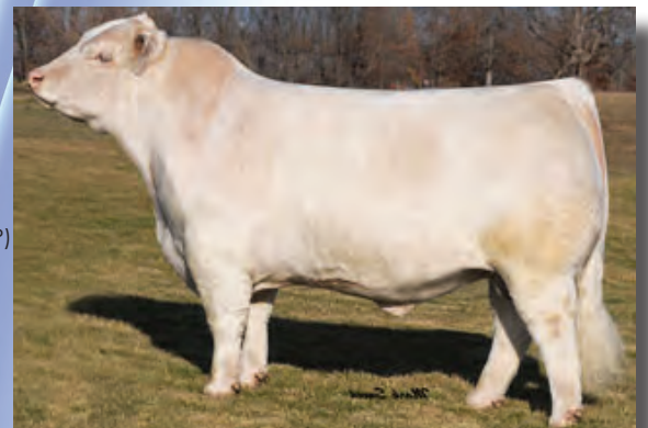
June 2016 Australasian Charolais GROUP BREEDPLAN

KEYS MCHENRY 24M M645472 (PED -5472E) (P) MISS KEY MEG 123L F925545 (PED -5545E) (P)