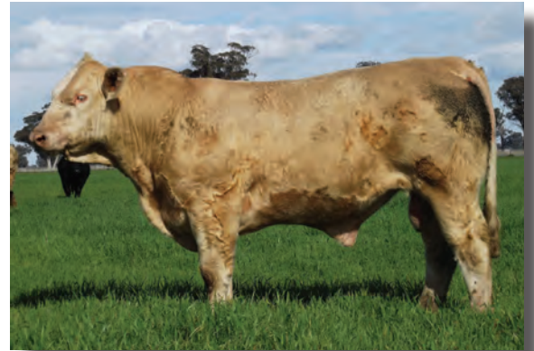
June 2016 Australasian Charolais GROUP BREEDPLAN

Airlie Kawasaki is a polled red factor bull with length and good growth. He comes loaded with a little extra power.