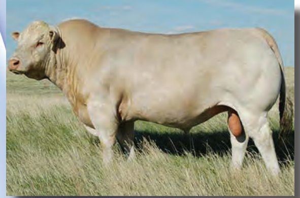
June 2016 Australasian Charolais GROUP BREEDPLAN

LT UNLIMITED EASE 9108 M 301930 LT BRENDA 1014 PLD F924572 (PED -4572E)