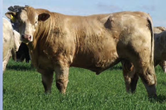
June 2016 Australasian Charolais GROUP BREEDPLAN

Airlie Koala is a polled red factor bull from a super cow in the Airlie herd. A bull that expresses length, growth and softness.