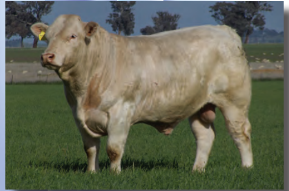
June 2016 Australasian Charolais GROUP BREEDPLAN