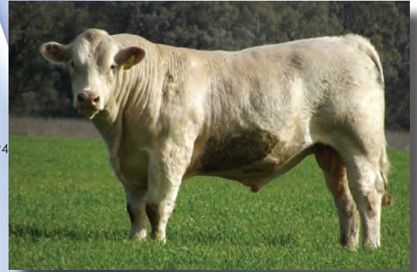
June 2016 Australasian Charolais GROUP BREEDPLAN

Airlie Kimono is a polled bull by LT Ledger. A bull with good growth and is one of our bigger Ledger calves that is also long, thick and soft. If you like your figures he is a very balanced bull on all accounts. Hits the top 10% for IMF and scrotal size.