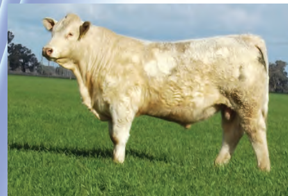
June 2016 Australasian Charolais GROUP BREEDPLAN

Airlie Latitude is a polled embryo calf from the Melbourne Royal Inter-breed champion cow. A long, tall bull filled with red meat. A good set of growth and carcass EBV's.