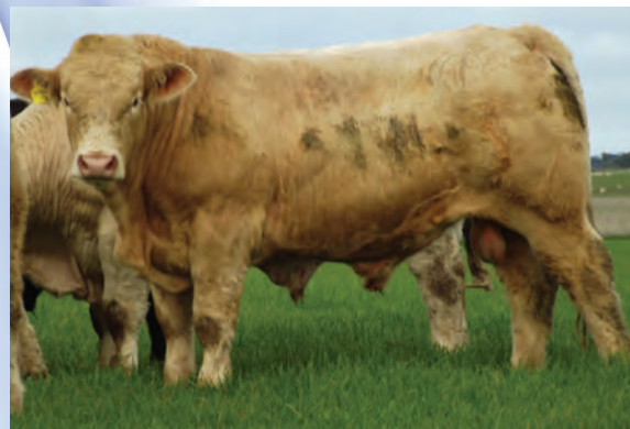
June 2016 Australasian Charolais GROUP BREEDPLAN

Airlie Kayak is a red factor bull and the only Airlie Horus calf to be offered for sale. A big bull that is long, thick and soft.