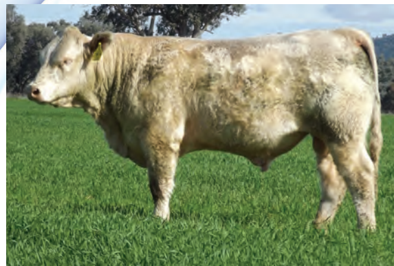
June 2016 Australasian Charolais GROUP BREEDPLAN

Airlie Larrikin is a polled bull from another awesome Full French donor cow in the Airlie herd. Here's a bull with real power but still maintains a clean front end.