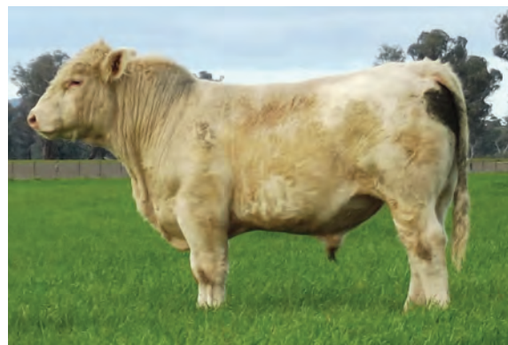
June 2016 Australasian Charolais GROUP BREEDPLAN

Airlie Landlubber is a polled bull by A.I sire Keys All State. A soft bull that is clean fronted and adequate muscle pattern to him.