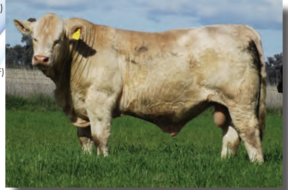
June 2016 Australasian Charolais GROUP BREEDPLAN

Airlie Kris is a polled bull that is long, clean, thick an soft. Comes with solid growth EBV's