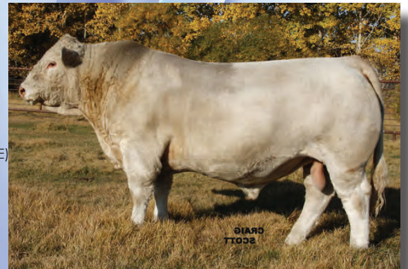
June 2016 Australasian Charolais GROUP BREEDPLAN

SIR QCR HIGHGEAR 2P M 40492 (OAC -74E) QCR DIMPLES 39D FC210939 (PED -939E)