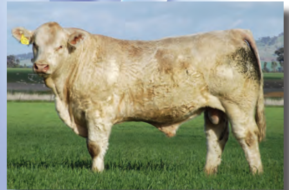
June 2016 Australasian Charolais GROUP BREEDPLAN

Airlie Klaxon is a polled bull by SVY Pilgrim. A Pilgrim calf with growth and thickness. A soft bull. A bull with real sire potential.