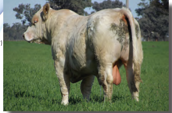
June 2016 Australasian Charolais GROUP BREEDPLAN

Airlie Know-All is a polled bull. Big and stretchy, with thickness, and softness.