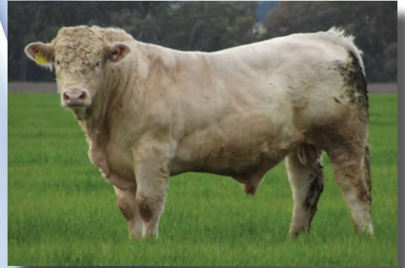
June 2016 Australasian Charolais GROUP BREEDPLAN