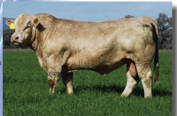
June 2016 Australasian Charolais GROUP BREEDPLAN

Airlie Kilt is a polled bull by LT Ledger. A bull that personifies red meat. Another Ledger that smashes the EBV's out of the park.