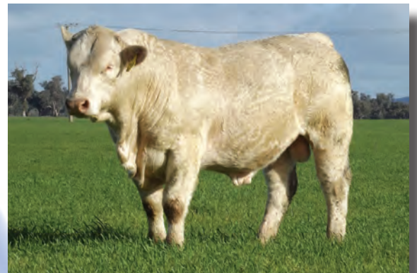
June 2016 Australasian Charolais GROUP BREEDPLAN

Airlie Kallio is a polled son of Airlie Gallic. A real powerhouse bull that is moderate with length.