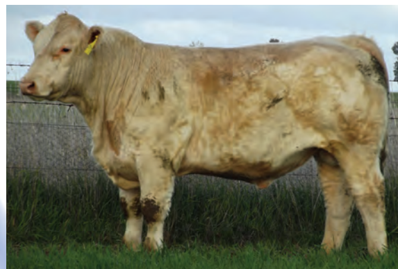
June 2016 Australasian Charolais GROUP BREEDPLAN

Airlie Legato is a polled bull and full brother to lot 51 & 52. A thicker bull that is moderate, soft and correct. Still the same great cow line.