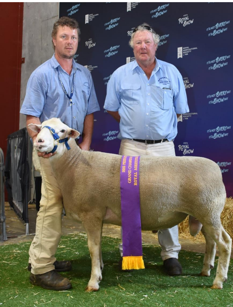
WHITE SUFFOLK SIRE 220099