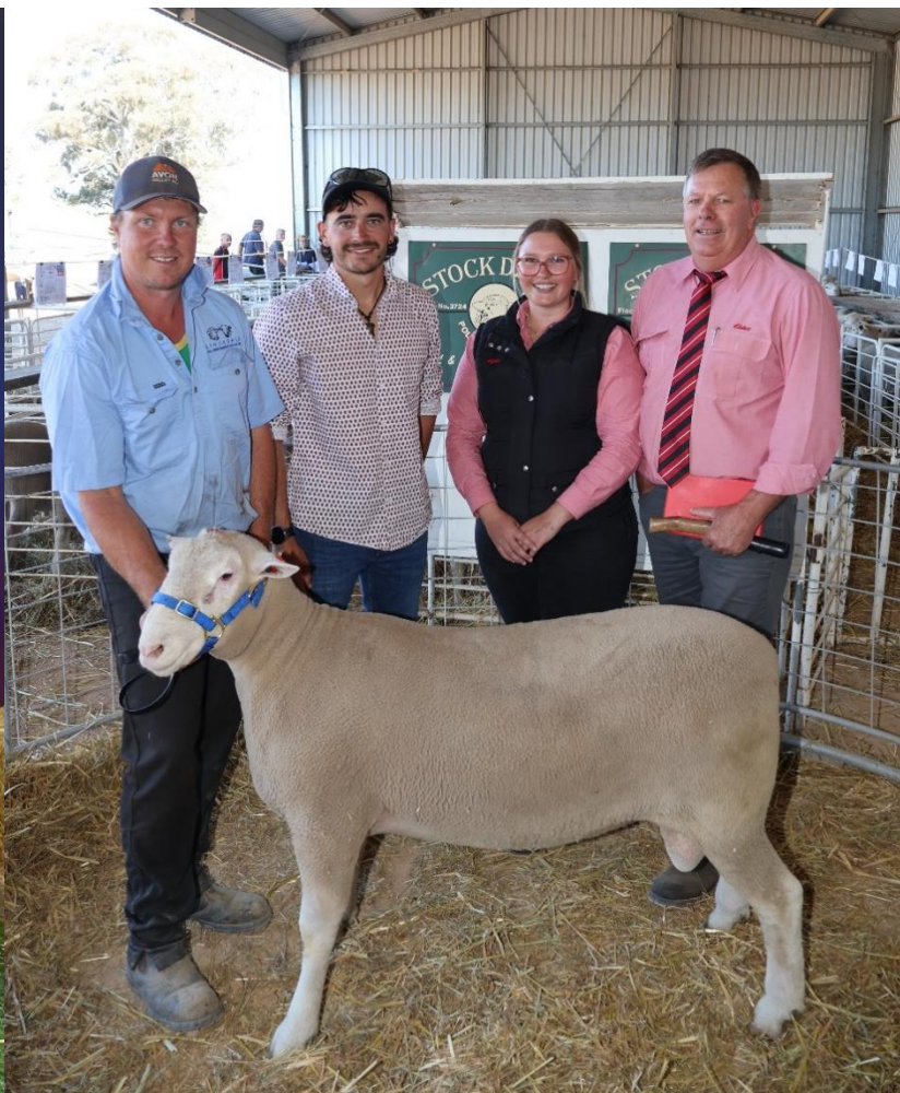
TOP PRICE POLL DORSET – ON PROPERTY SALE 2023