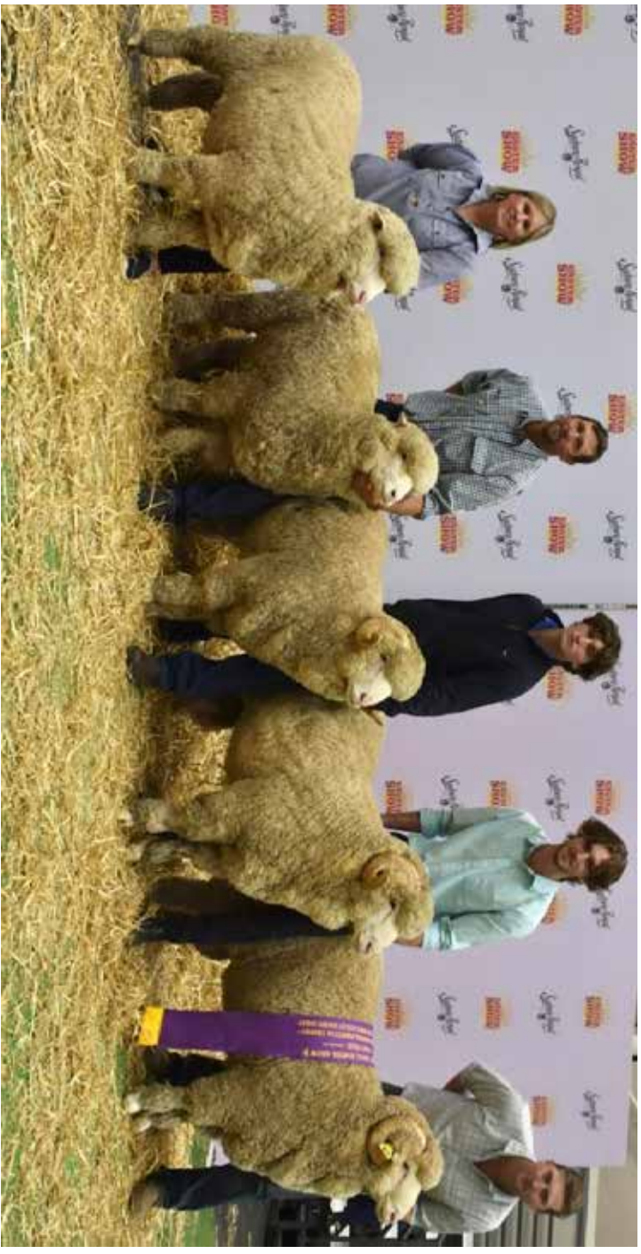
Best Exhibit 5 Merino August Shorn Sheep - 2023 Sydney Royal Easter Show