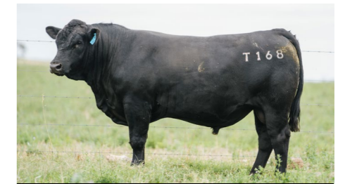
LOT 25 KERINGA TITANIUM T168

MILLAH MURRAH RECTOR R53 - one of ABS's recent sires. He was sold alongside Rocketman and Rembrandt but was somewhat overshadowed. However, public approval of R53's calves at the 2023 Millah Murrah female sale has recognised his potential. His bulls are generally more moderate and thicker topped, while his females display outstanding softness and balance. Six sons sell.