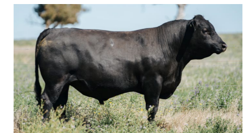
LOT 19 KERINGA TANTALISE T144

OTHER LINES MILLAH MURRAH QUIXOTE Q96 , a son of Chisum 255 and Millah Murrah Brenda N8, was the highest-selling bull at the 2020 Millah Murrah bull sale. Woonalee Simmentals and JT Angus purchased him, and he has been widely used in AI programs nationwide. Quixote's offspring exhibit early growth, more frame and length while maintaining thickness. Five sons sell.