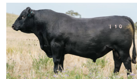
LOT 2 KERINGA TREASURE T10

BANQUET QUARTER POUNDER Q252 - Purchased in partnership with Millah Murrah and Alpine Angus in 2021. What we found particularly appealing about Quarter Pounder was his outcross pedigree, thick top, and strong head. Moreover, the fact that Jupiter J194 sired his dam made him an excellent fit for our program while introducing a new genetic line. Three sons sell.