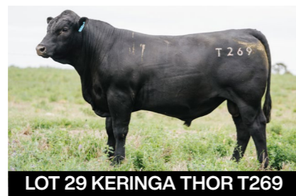
LOT 29 KERINGA THOR T269