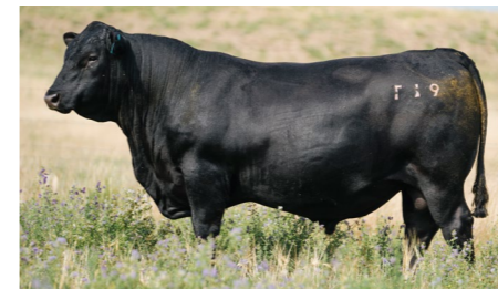
LOT 13 KERINGA TITON T19