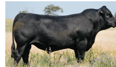
LOT 8 KERINGA THIRSTY T35

JUPITAR LINE MILLAH MURRAH JUPITER J194 - Jupiter is a Booramooka Theo son. We liked the first crop of calves and decided to return that way for his exceptional structure and thickness. His next batch of calves is no exception, doing just as we anticipated. Seven sons sell.