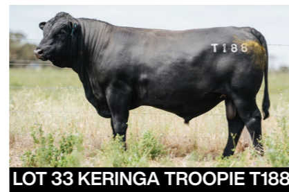
LOT 33 KERINGA TROOPIE T188