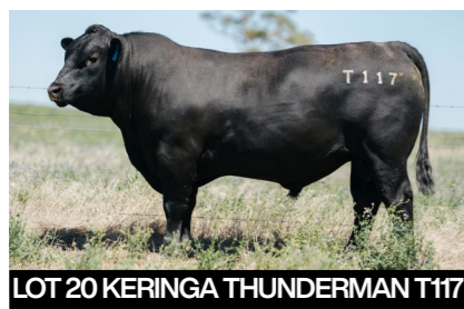
LOT 20 KERINGA THUNDERMAN T117