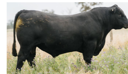
LOT 14 KERINGA TOWER T40

NECTAR LINE MILLAH MURRAH NECTAR N334 - Nectar bulls have been quite popular in recent years, and the females produced from this line are also exceptional. Many of them have made it to our donor pen and have produced some outstanding bulls in this year's sale. Three sons sell.