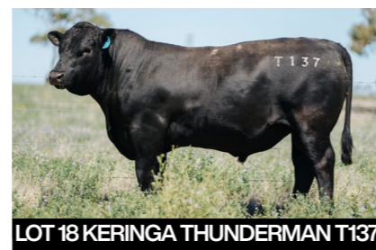
LOT 18 KERINGA THUNDERMAN T137