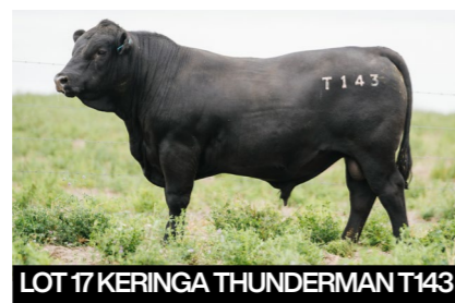
LOT 17 KERINGA THUNDERMAN T143