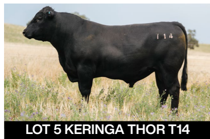
LOT 5 KERINGA THOR T14