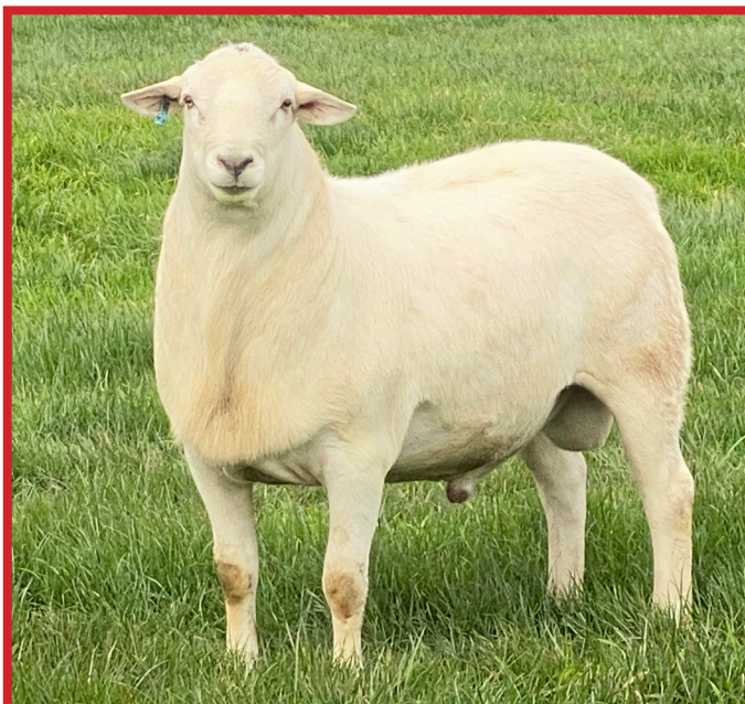
Photo is of top son 221348 "Fulcrum" 9 Stud Ewes, 8 Stud Rams & 16 Flock Rams Represented

Sire: ET 190770 ET 180208 210842 ET 180146 Dam: ET 190033 ET 180158 ET 170236