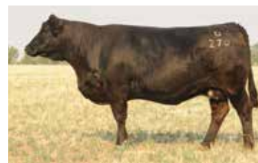
ST PAULS PEAR D270

At the Elite Sale, as invited guest, Silversmith sold for $22,000. Serbia being M412 natural calf sold for $20,000 and Secret Squirrel at $18,000. Two younger M412 sons, Story Teller and Ship sold as a pair for $25,000, privately as yearlings at St Pauls. $85,000 in total.