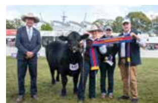
BULL CALF CHAMPION SILVERSMITH

CHECK FOR PROGENY LOTS 30 AND 43, GRAND PROGENY LOT 29 AND EMBRYOS LOT 50 AND 51.