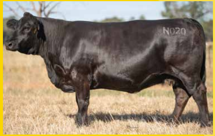
N020, donor dam of embryo Lot 52.