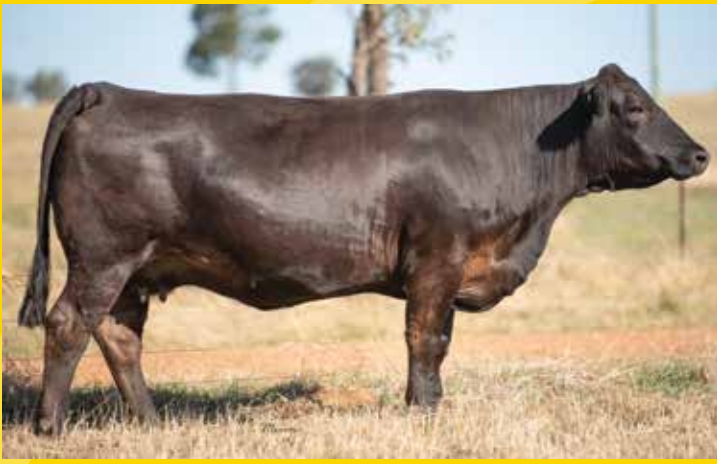
P401, donor dam of embryo Lot 49.