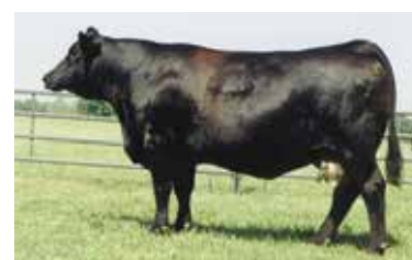
PRICKLY PEAR 615F