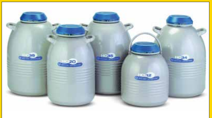
Check out Embryo Lots 48-53; Semen Lots 54-58; plus Semen given in Lots 35 to 47.