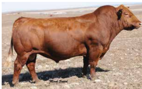
LOT 56 RFS RED IRON T20