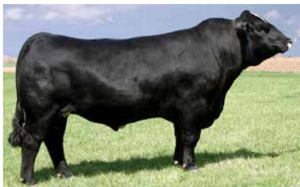
LOT 57 CIRCLE T ANTOINETTES STAR

Comments: Homo Black Homo Polled. New Release to Australia top 1% Growth, top 3% marbling.