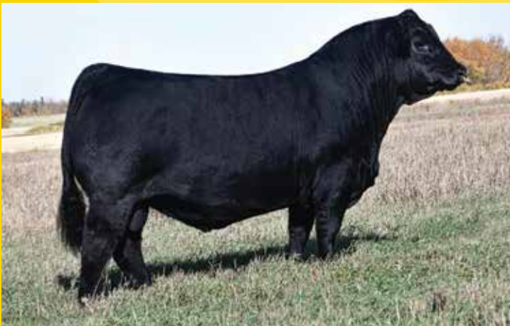
Unique opportunity to get Caliber genetics. 2 embryo lots, 4 females have calves at foot.

OPEN DAY Saturday September 9th at the Henty Farm from 11am to 4pm