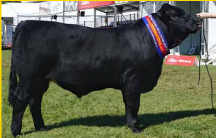
Bull calf champion Simmental 50 Years Feature Sydney 2022. Full sister to Lot 39.