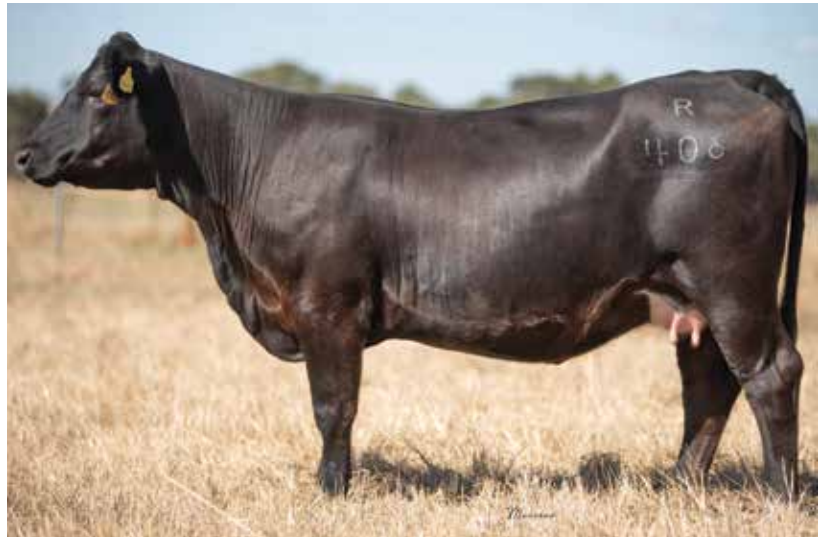
Photo of Dam R406

CCR COWBOY CUT 5048Z Sire: ST PAULS QATAR Q410 ST PAULS OLIE LUCY E433 CCR COWBOY CUT 5048Z Dam: ST PAULS CC K435 LUCY R406 ST PAULS TANKER'S LUCY K435