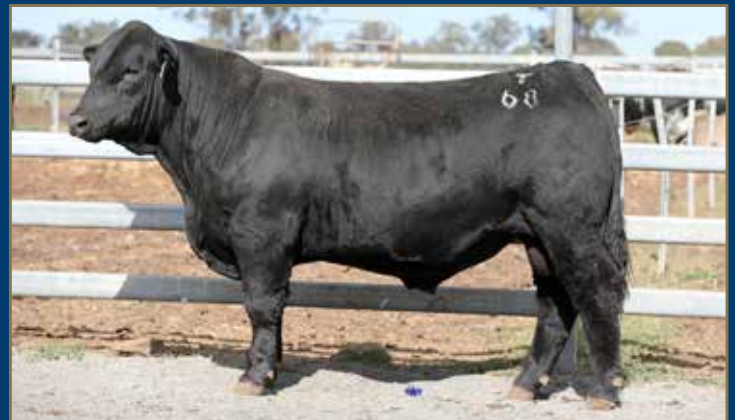
LOT 13 - WOONALLEE TOUCHDOWN T68 PP