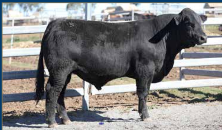
LOT 24 - WOONALLEE TICKET T12 PP