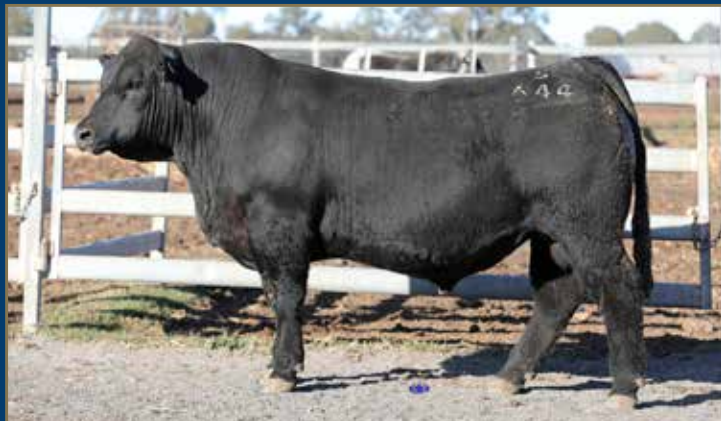
LOT 5 - WOONALLEE STANHOPE S644 PP