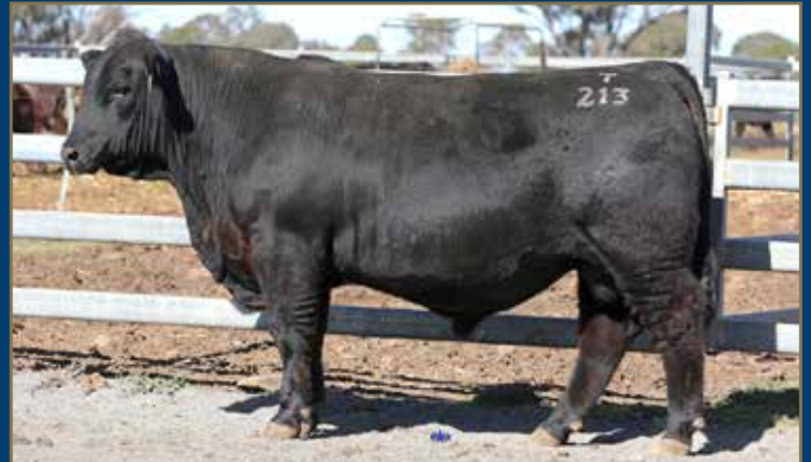
LOT 10 - WOONALLEE THUNDER T213 PP