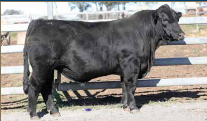
LOT 8 - WOONALLEE SOCIALITE S556 PP