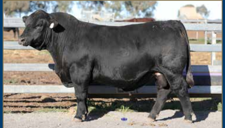
LOT 3 - WOONALLEE SLEEK S504 PP