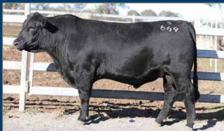
LOT 35 - WOONALLEE CONVERSION S669 PP