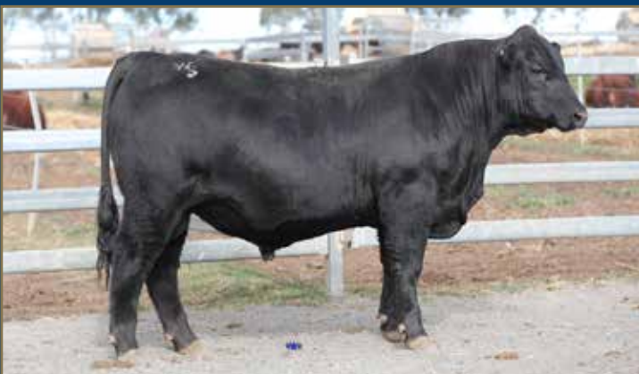
LOT 38 - WOONALLEE QUIXOTE T073 PP