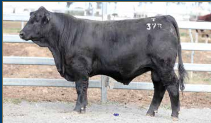
LOT 30 - WOONALLEE TERRANCE T373 PP