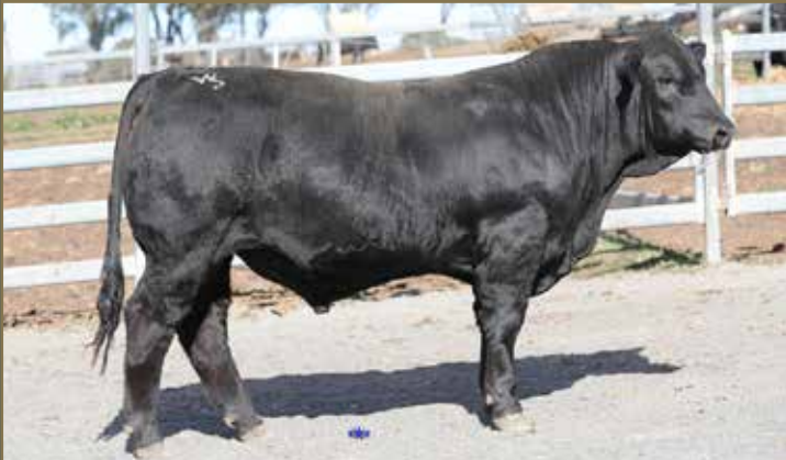
LOT 40 - WOONALLEE NATURAL T209 PP