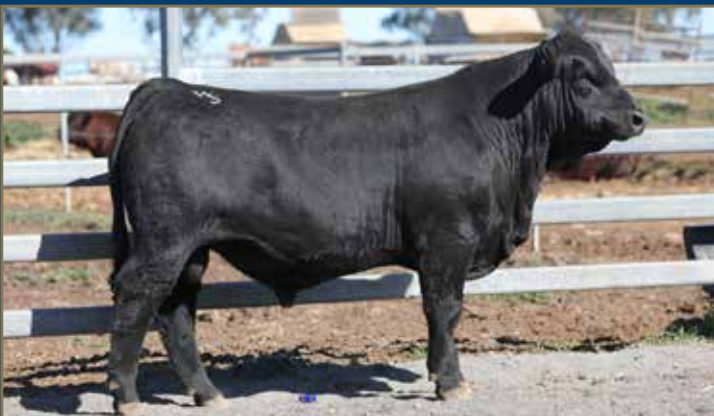
LOT 21 - WOONALLEE TOUGH GUY T110 PP