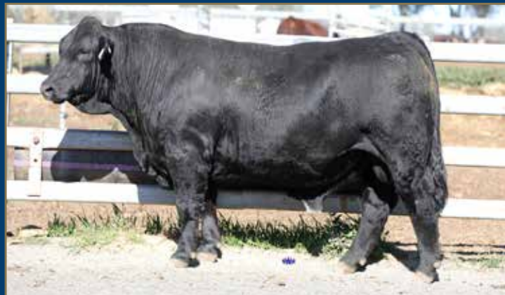
LOT 9 - WOONALLEE SAFARI S590 PP