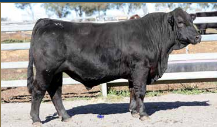
LOT 4 - WOONALLEE SALOON S672 PP