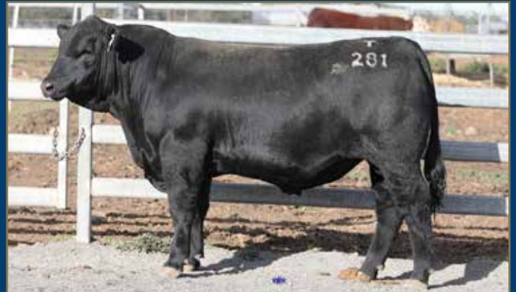
LOT 48 - WOONALLEE QUIXOTE T281 PP