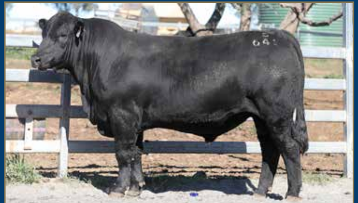
LOT 1 - WOONALLEE SERGEANT S641 PP