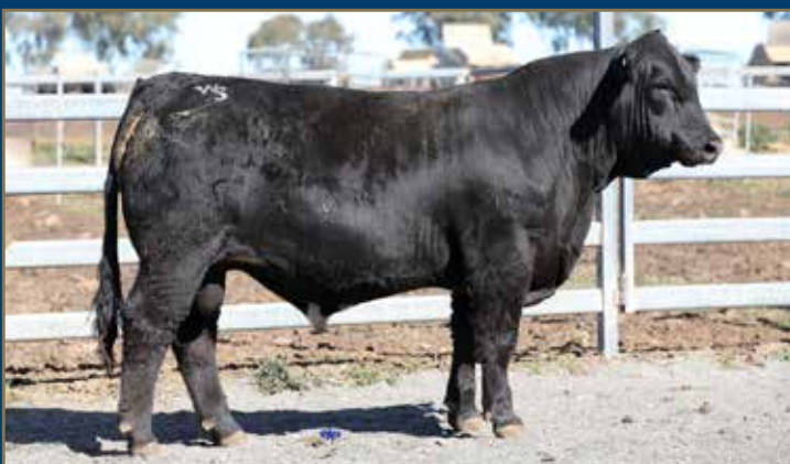
LOT 12 - WOONALLEE TEMPATION T95 PP