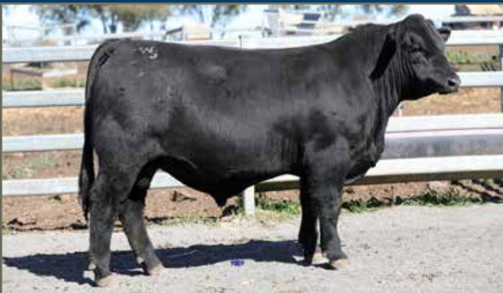
LOT 28 - WOONALLEE TARANTINO T135 PP