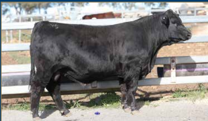
LOT 53 - WOONALLEE BEACON T030 PP