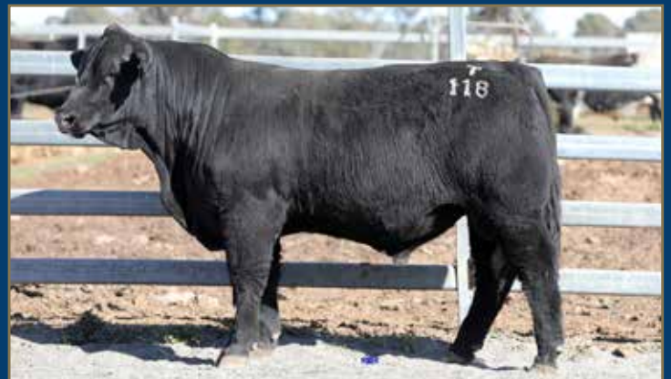
LOT 25 - WOONALLEE TEXTBOOK T118 PP