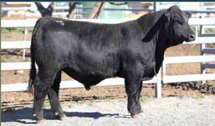
LOT 17 - WOONALLEE TEAMMATE T70 PP