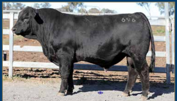
LOT 2 - WOONALLEE SAMBA S696 PP