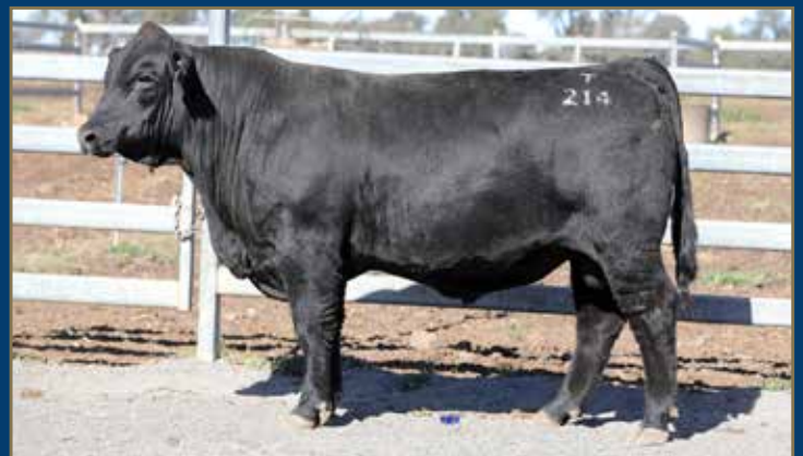
LOT 36 - WOONALLEE CONVERSION T214 PP