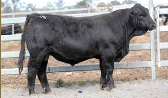
LOT 26 - WOONALLEE TATUM T285 PP