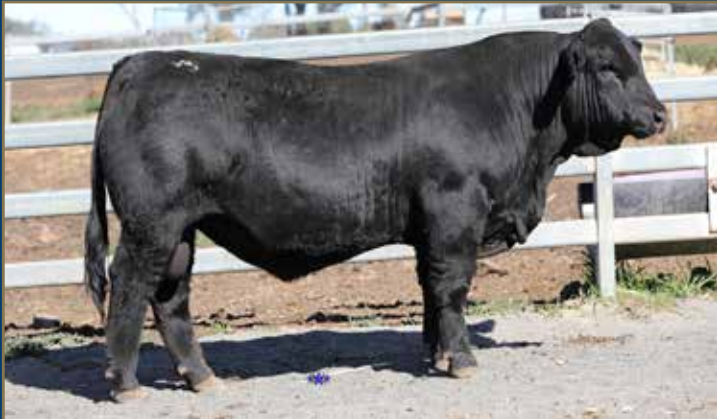
LOT 15 - WOONALLEE TORONTO T274 PP