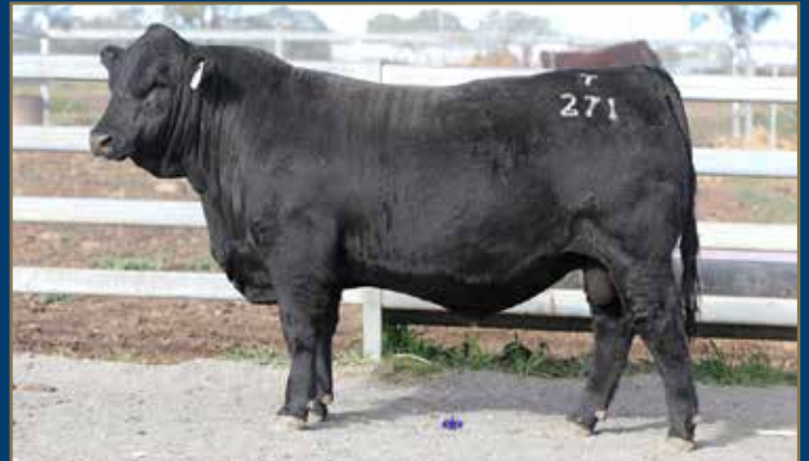
LOT 46 - WOONALLEE CONVERSION T271 PP