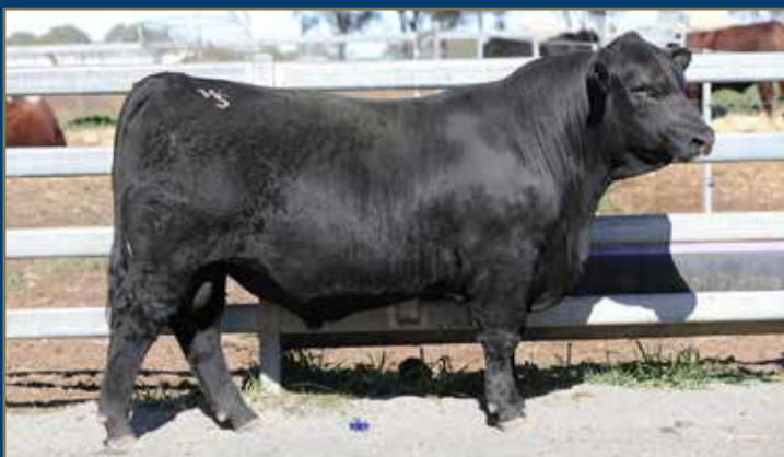
LOT 54 - WOONALLEE NATURAL T235 PP