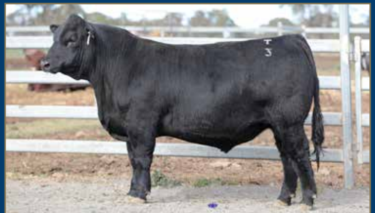
LOT 52 - WOONALLEE FIREMAN T003 PP