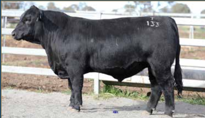
LOT 47 - WOONALLEE MESSIAH T133 PP