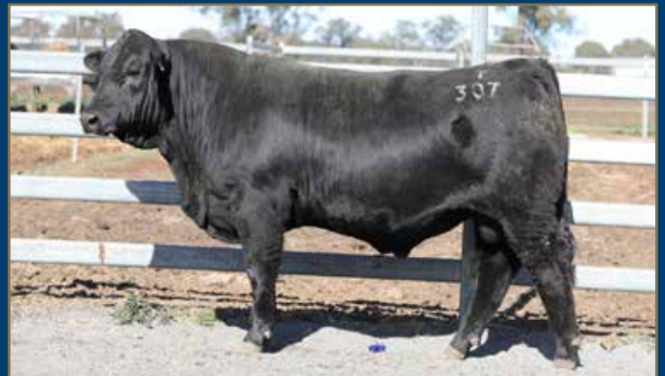
LOT 11 - WOONALLEE TRADITION T307 PP