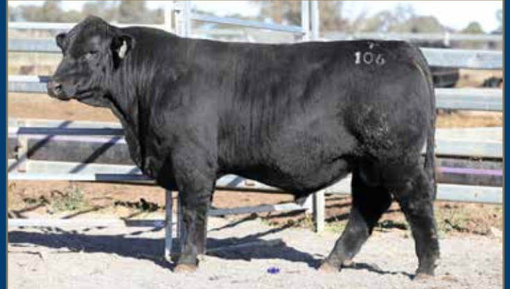
LOT 16 - WOONALLEE TEQUILA T106 PP