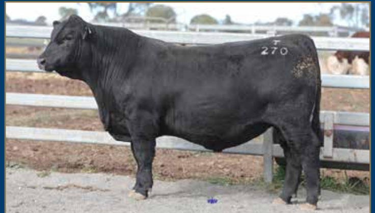
LOT 39 - WOONALLEE CONVERSION T270 PP