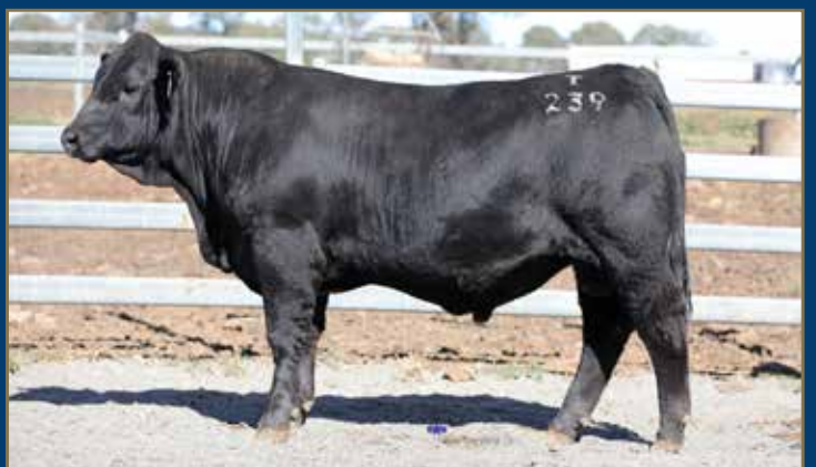
LOT 20 - WOONALLEE TRANSPARENT T239 PP