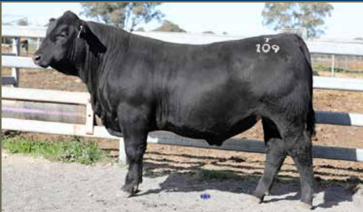
LOT 41 - WOONALLEE QUIXOTE T109 PP