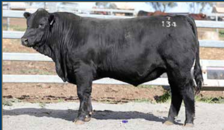
LOT 19 - WOONALLEE TRUMAN T134 PP