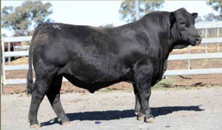
LOT 32 - WOONALLEE CONVERSION S691 PP