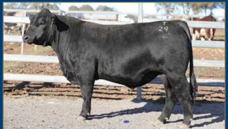
LOT 49 - WOONALLEE FIREMAN T029 PP