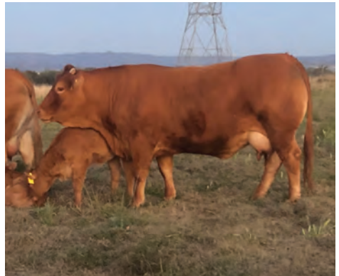
Dam of Lot 44

Junction thanks all the buyers & bidders at the 2022 sale