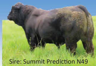
Sire: Summit Prediction N49

OFFERING LOT 21 BIZ SONIC PREDICTION HOMO POLLED