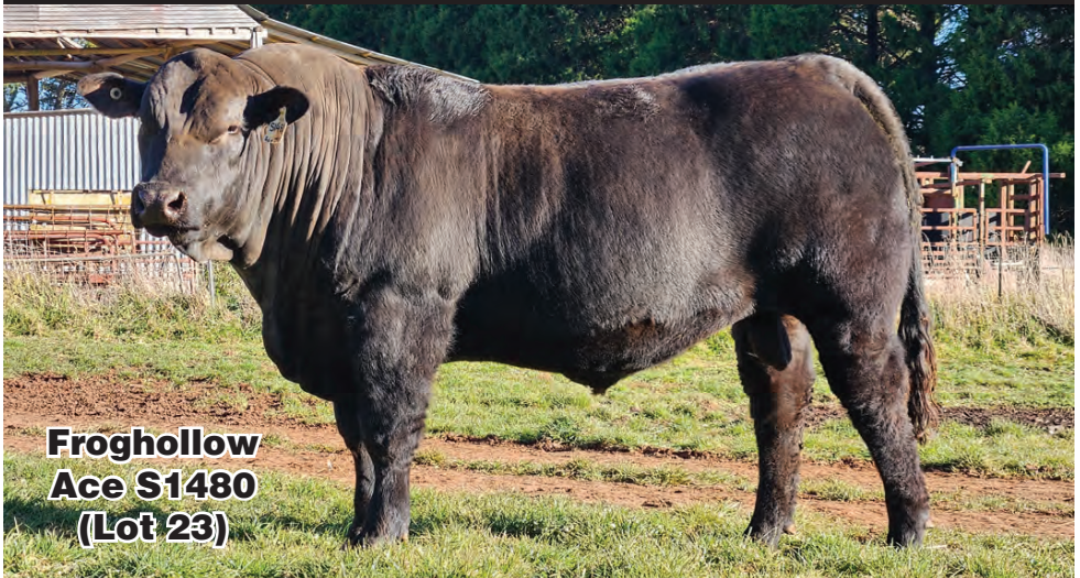
Froghollow Ace S1480 (Lot 23)

Returning to this year's Northern Limousin Breeders' Sale with 3 Bulls