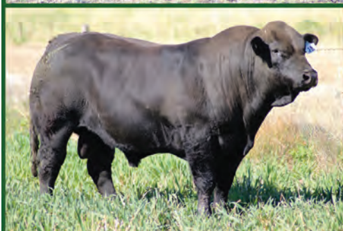
ANGLEDALE PRESTIGE P16 Sire of Lots 30 & 31

We wish to thank all our buyers and underbidders for their support and hope to see you again when you next require a bull.