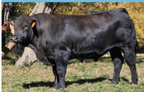
LOT 12 - SWLPS164 DOB 19/08/2021 HOMO Polled and HOMO Black