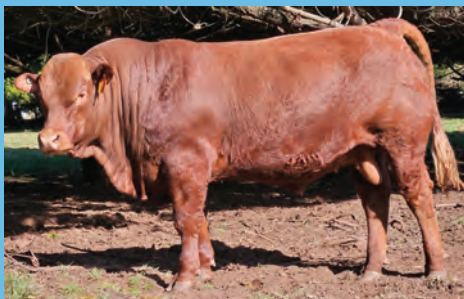
LOT 36 - SWLPS176 DOB 1/11/2021 Polled (Awaiting DNA results)

Farm enquiries & inspections always welcome