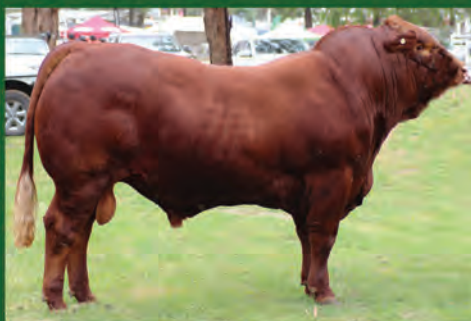
ANGLEDALE PRESIDENT P5 Sire of Lots 2, 5, 6, 28 & 29

Inspections Welcome Contact Craig Devine: 0438 451 744