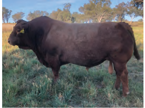
Sire of Lots 20 & 44

● Semen tested and vet inspected ● Both ready to work