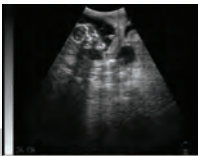
94 day bull calf head (24 cm mode)