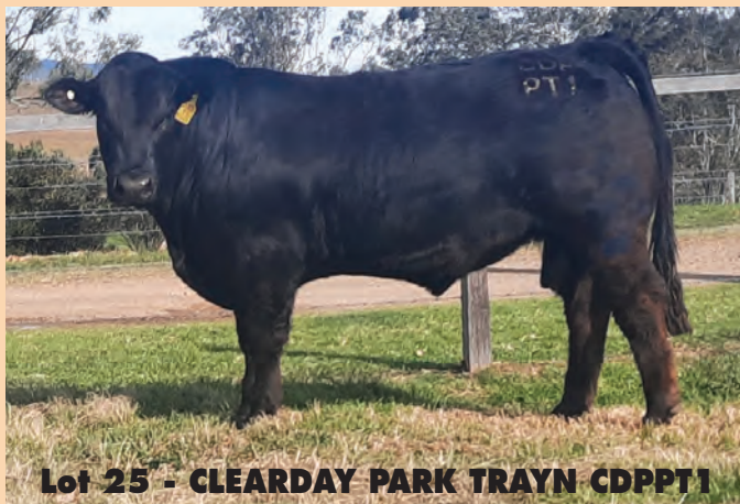
Lot 25 - CLEARDAY PARK TRAYN CDPPT1