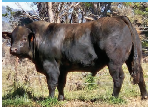
LOT 11 - SWLPS162 DOB 17/08/2021 HOMO Polled and Black