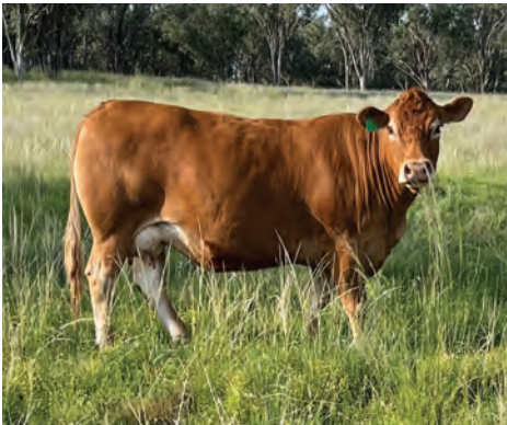
Dam of Lot 20

● Semen tested and vet inspected ● Both ready to work