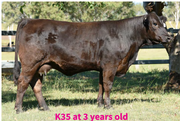
K35 at 3 years old

LFLC DENVER 857D (PP BB AA) WARRAWINDI RESPONDER R6 (PP BB AA) WARRAWINDI NATIONAL TREASURE (PP B U) WULFS UPPERMOST 6196U (PP B AC) OSULLIVANS BLACK PEARL K35 (PP BB AC) OSULLIVANS BLACK PEARL E42 (P B U)