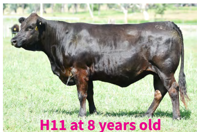
H11 at 8 years old

We really are spoiling you now. A daughter of H11 the matriarch of arguably the best cow line at OSullivans with the Gem family from Warrawindi featured on the top side. This is a special heifer that should have a spot in the donor pen of any Limousin herd.