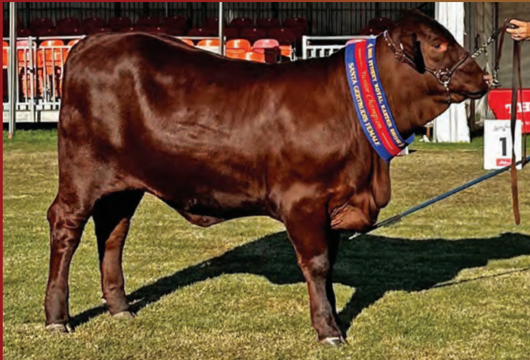
Glenalbyn Tiktok - Junior Champion Female