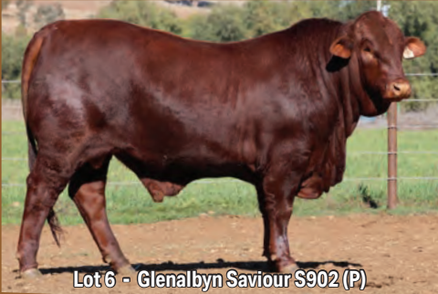
Lot 6 - Glenalbyn Saviour S902 (P)