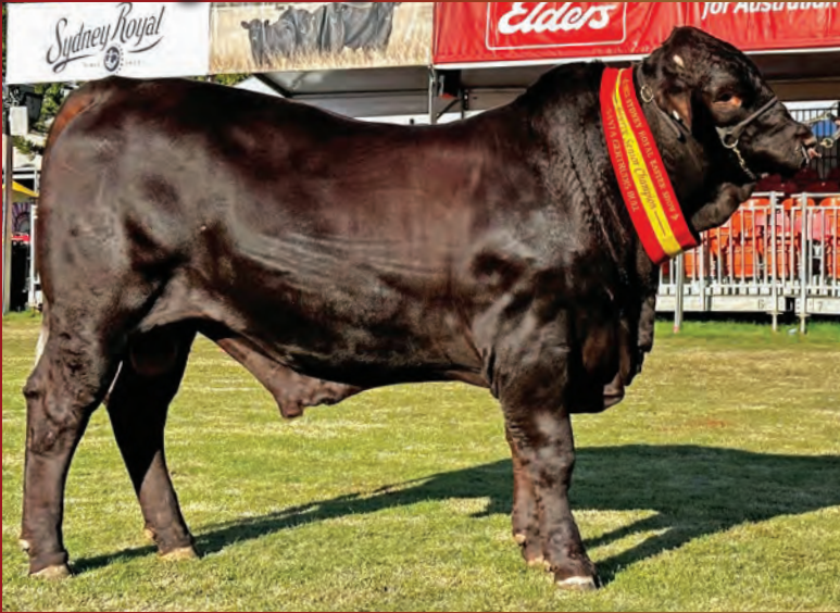
Glenalbyn Schooner - Reserve Senior Champion Bull