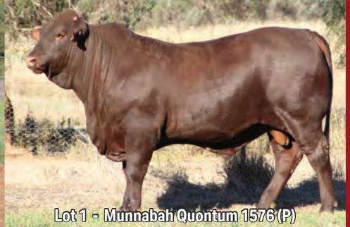
Lot 1 - Munnabah Quontum 1576 (P)