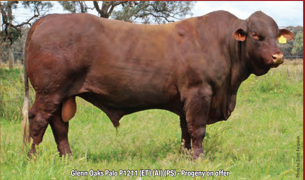
Glenn Oaks Palo P1211 (ET) (AI) (PS) - Progeny on offer