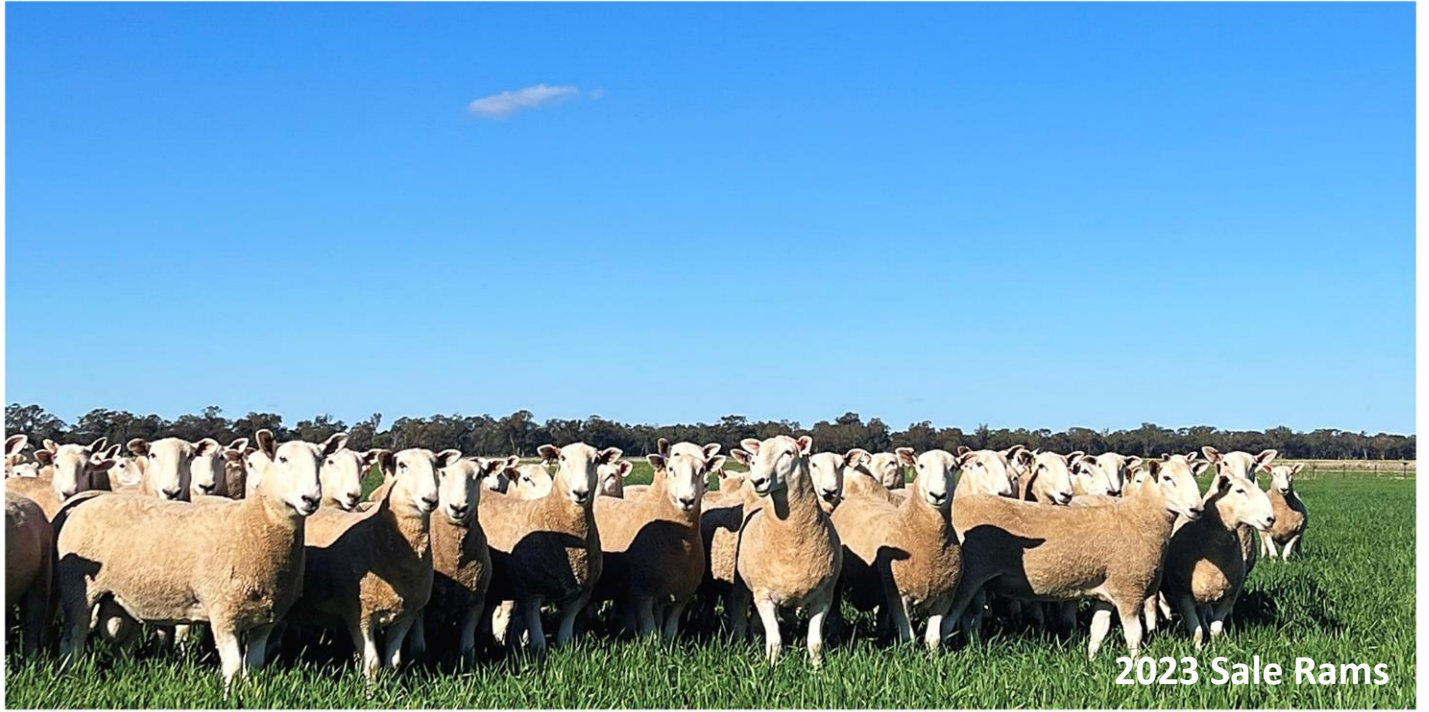
2023 Sale Rams