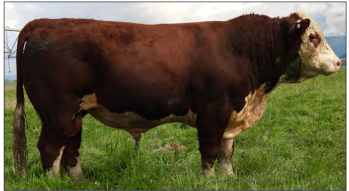
LOT 23 - OPCS072