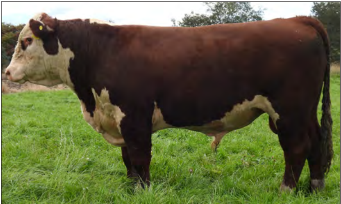
LOT 6 - OPCS091