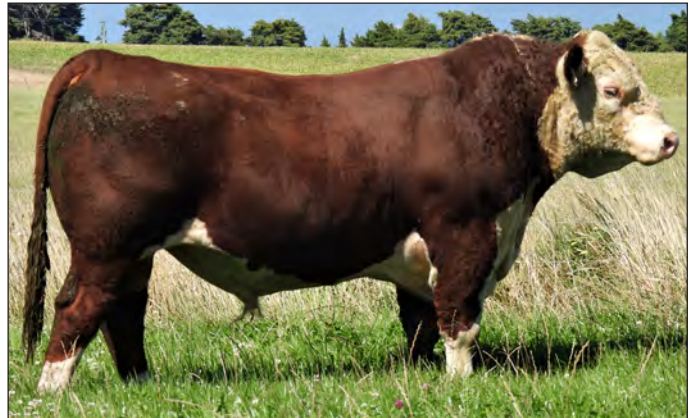
LOT 4 - OPCS054