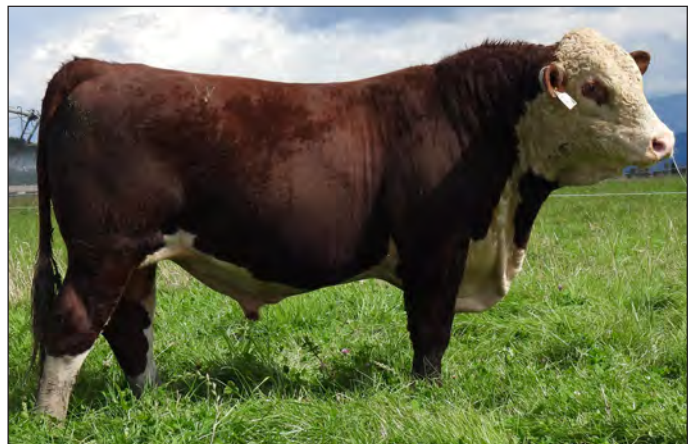
LOT 10 - OPCS107