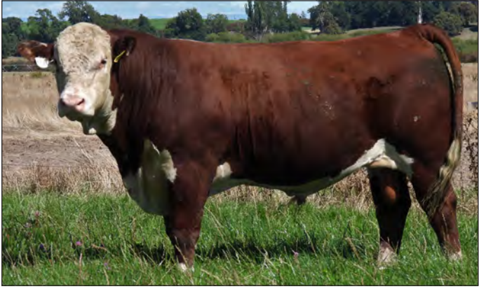
LOT 3 - OPCS047