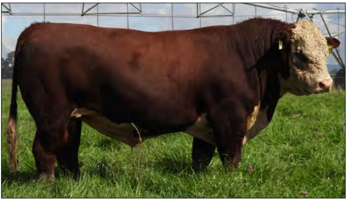
LOT 25 - OPCS089