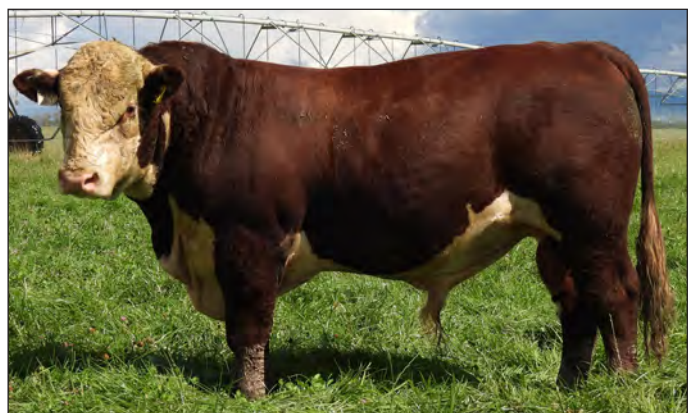
LOT 28 - OPCS150