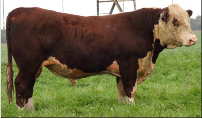
LOT 12 - OPCS026