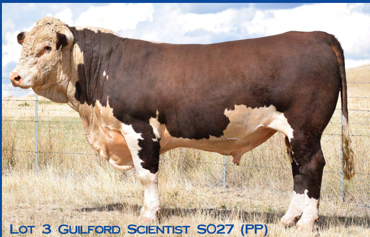
LOT 3 GUILFORD SCIENTIST S027 (PP)