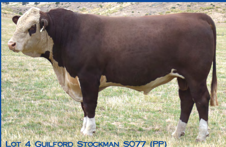
LOT 4 GUILFORD STOCKMAN S077 (PP)