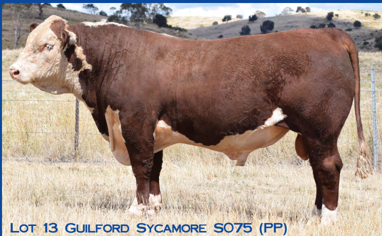
LOT 13 GUILFORD SYCAMORE S075 (PP)