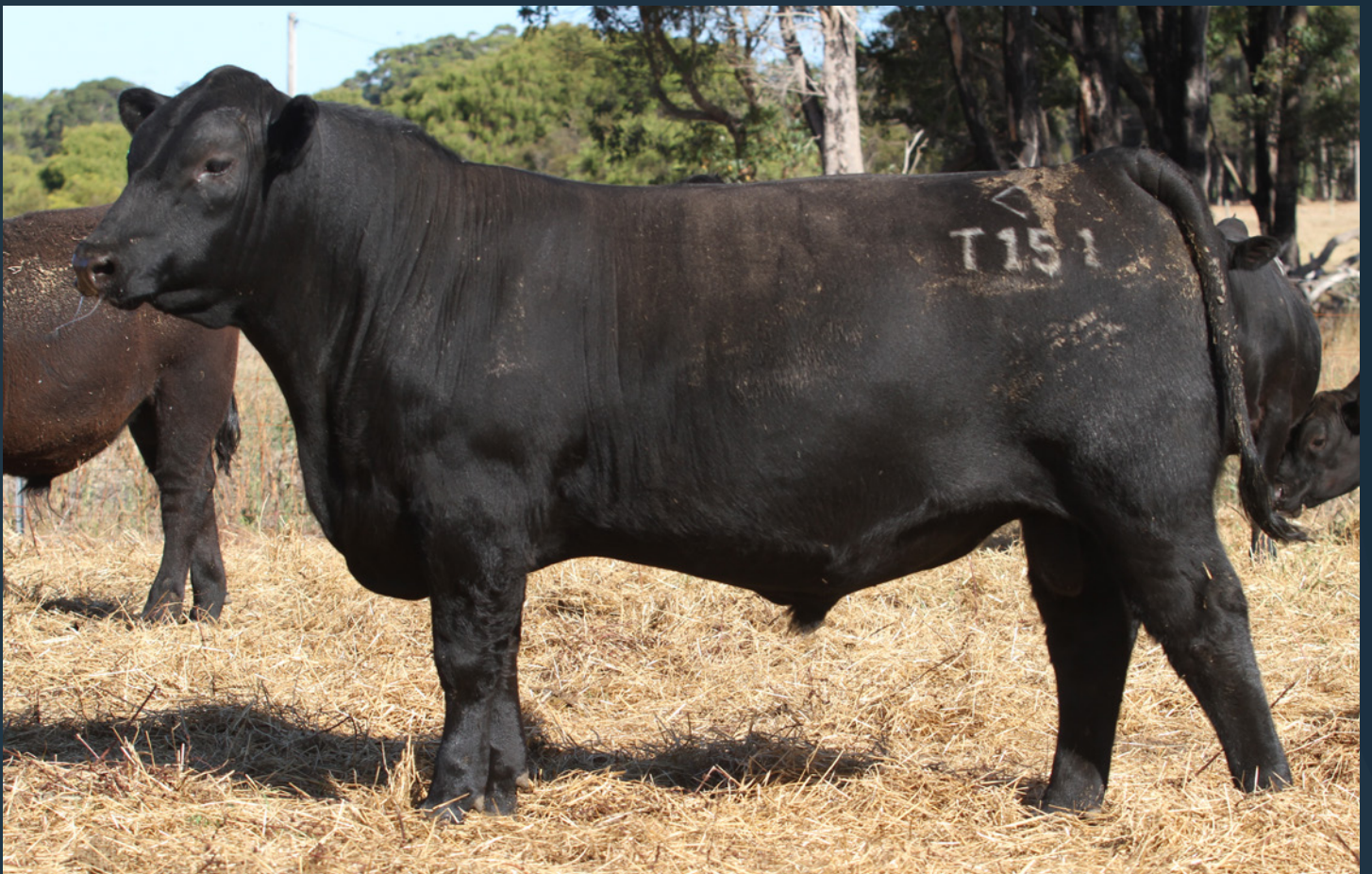
Lot 30 | Gandy Fair N Square T151