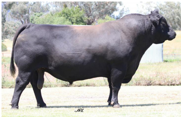
KAROO K12 REALIST N278 SV