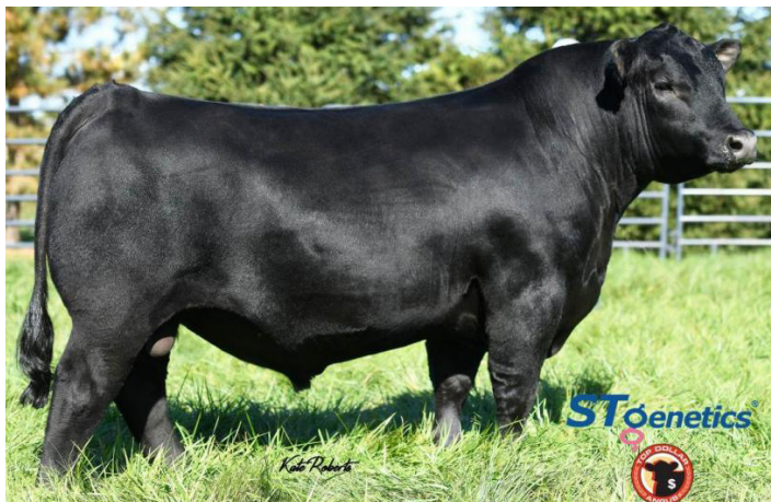
MYERS FAIR-N-SQUARE M39 PV