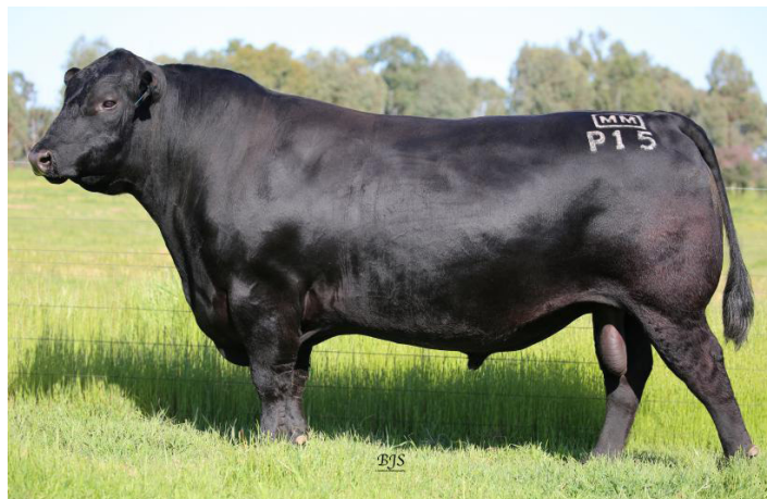
MILLAH MURRAH PARATROOPER P15 PV