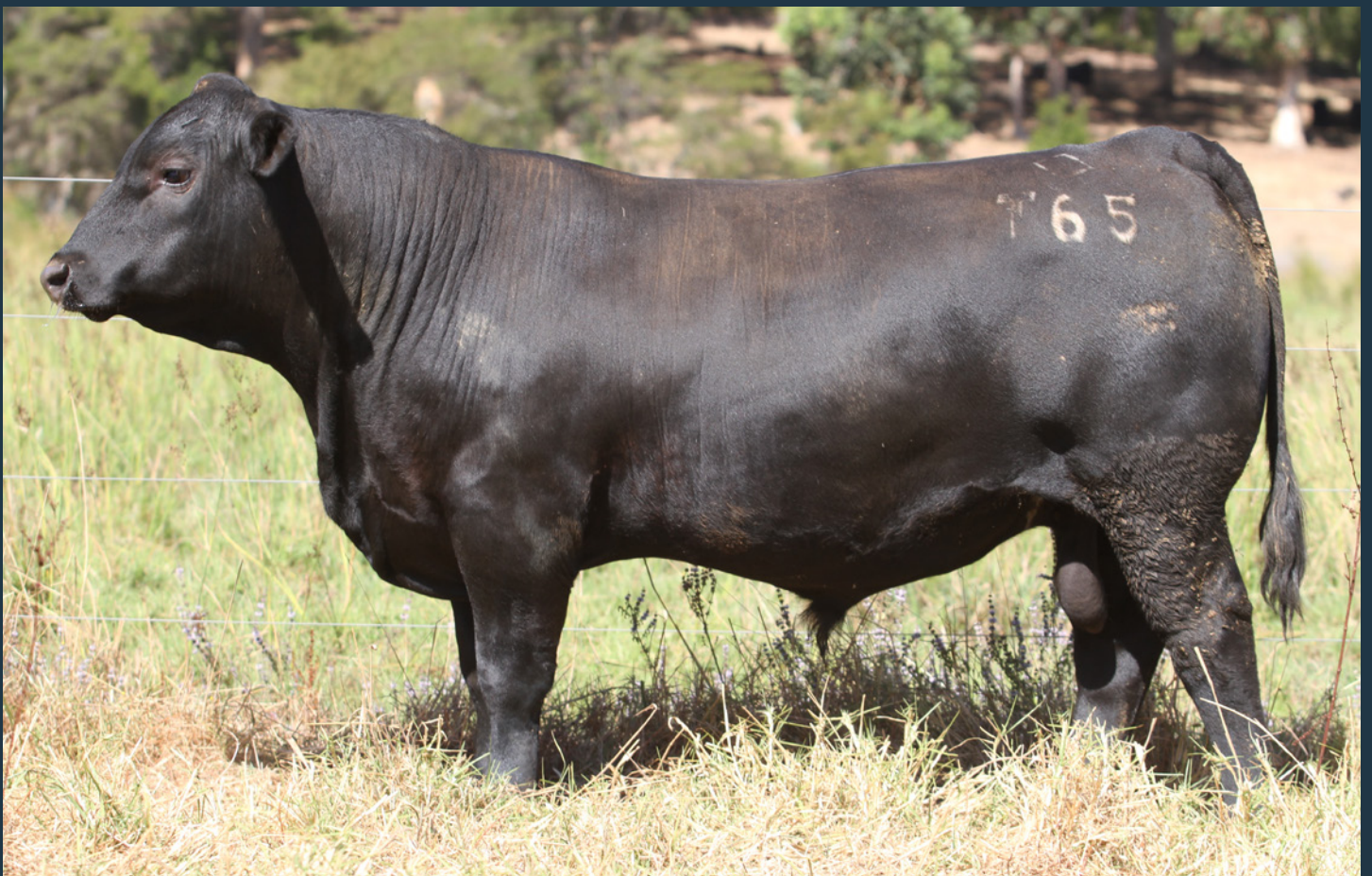
Lot 3 | Gandy Geddes T65