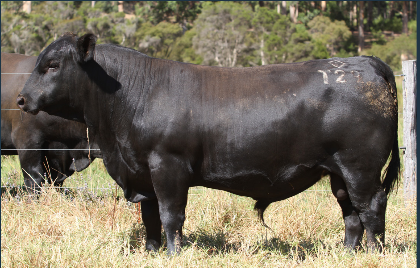
Lot 2 | Gandy Paratrooper T29