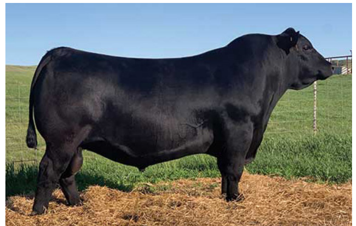
S A V CHECKMATE 8158 PV