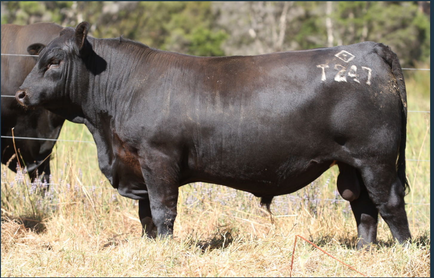
Lot 35 | Gandy Beast Mode T247