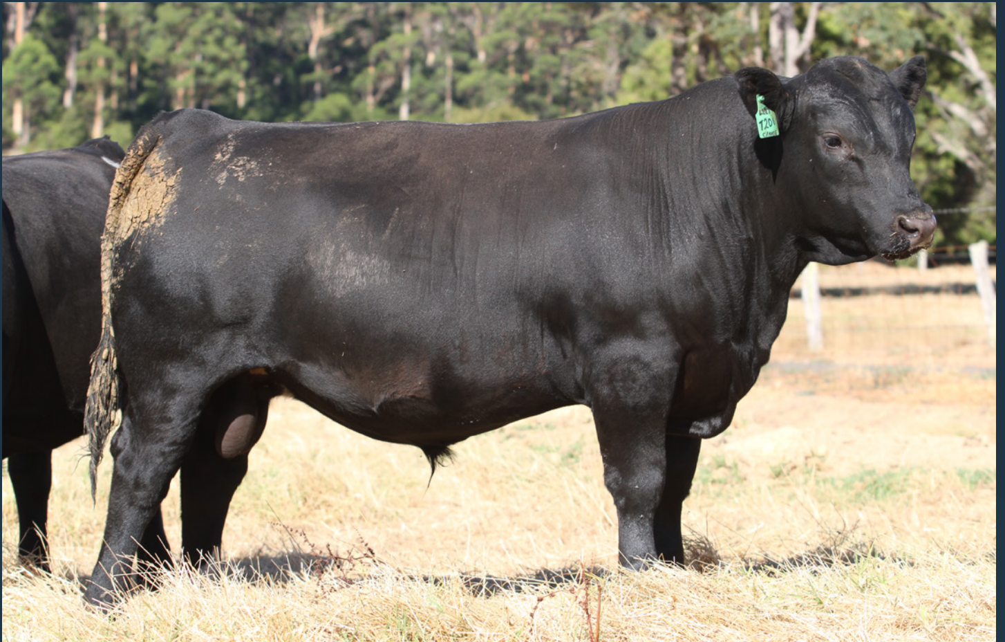
Lot 9 | Gandy Checkmate T201