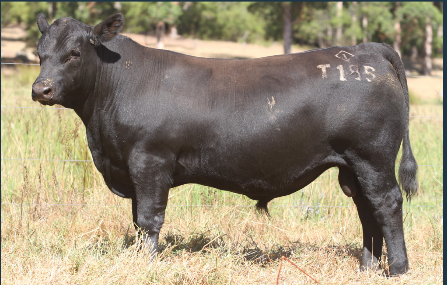
Lot 36 | Gandy Fully Loaded T185