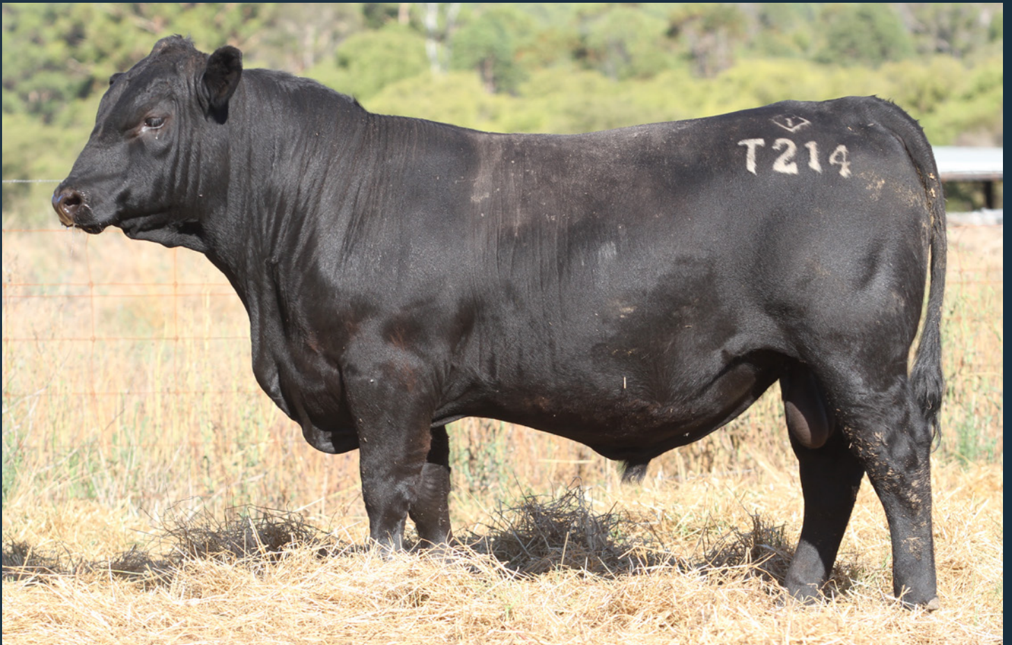
Lot 11 | Gandy Realist T214