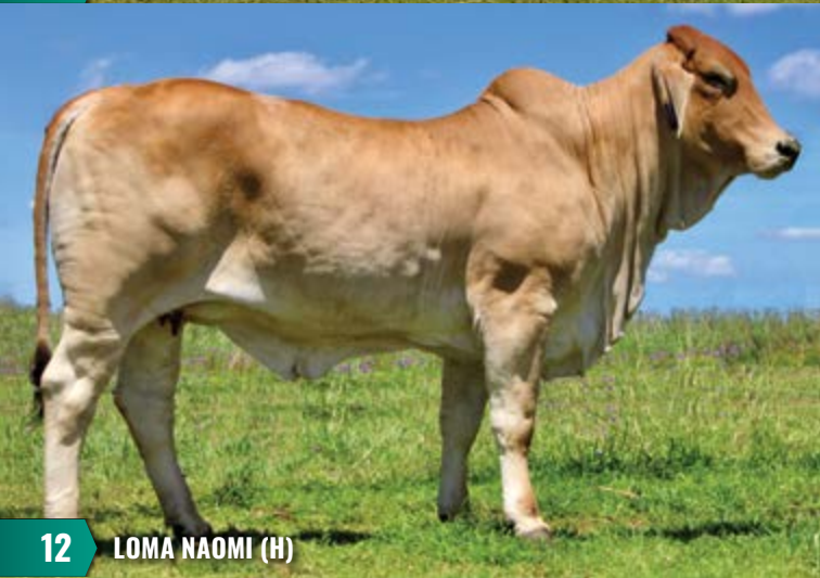
12 LOMA NAOMI (H)