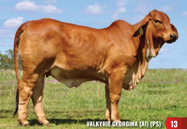
VALKYRIE GEORGINA (AI) (PS)