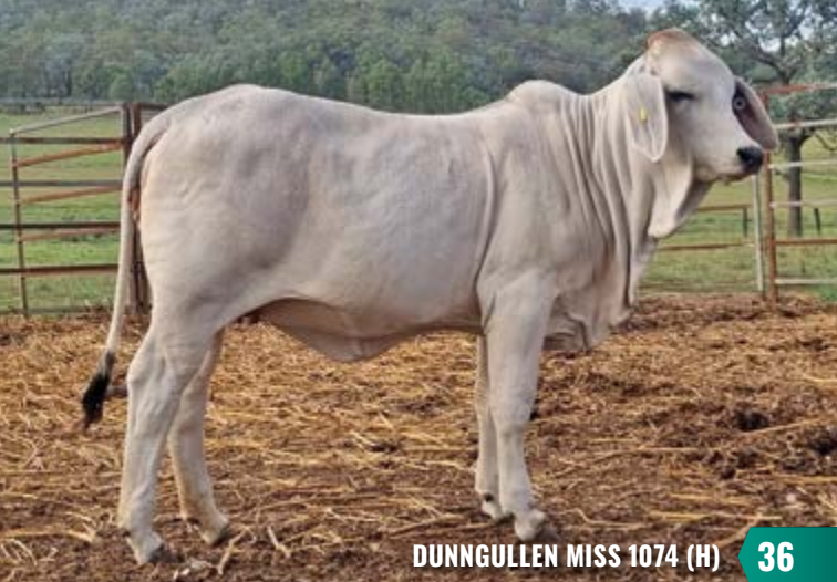
DUNNGULLEN MISS 1074 (H)