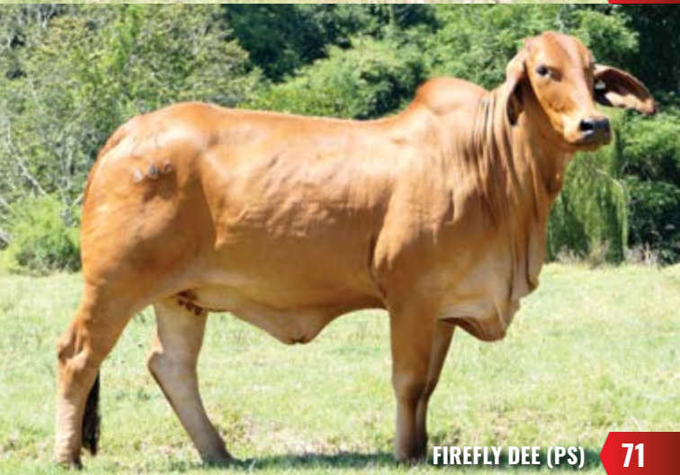
FIREFLY DEE (PS)