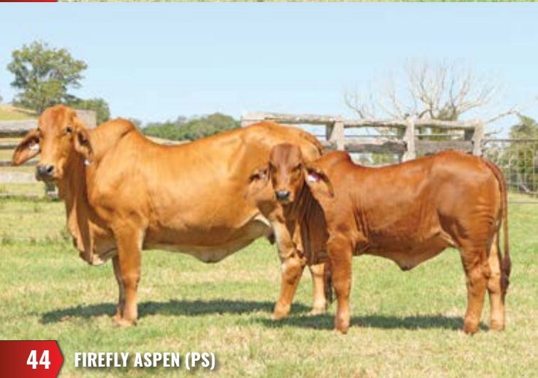
44 FIREFLY ASPEN (PS)