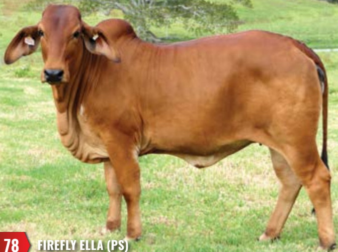
78 FIREFLY ELLA (PS)