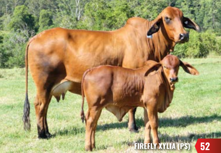
FIREFLY XYLIA (PS)