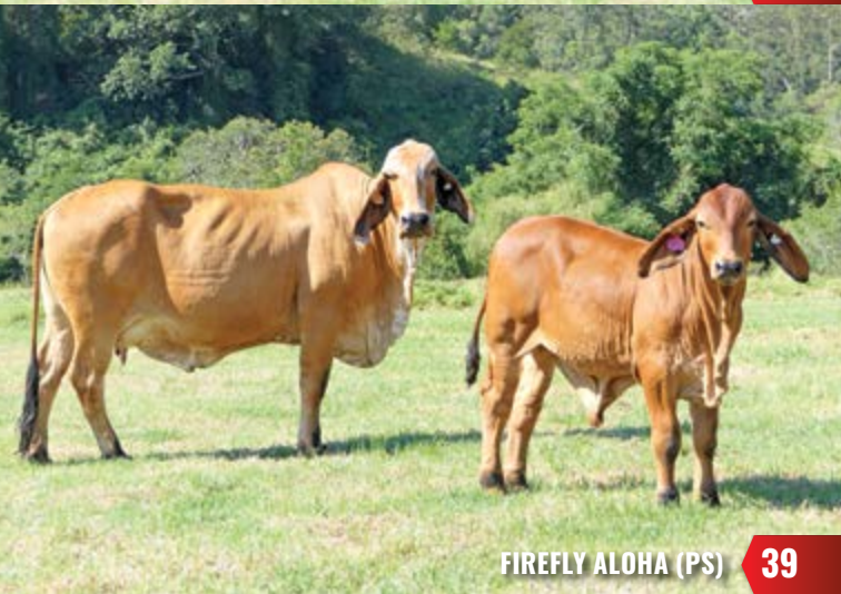
FIREFLY ALOHA (PS)