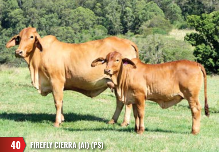
40 FIREFLY CIERRA (AI) (PS)