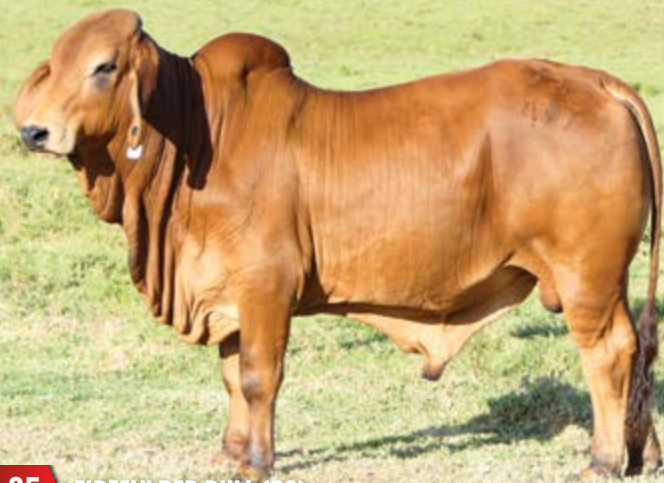
85 FIREFLY RED BULL (PS)