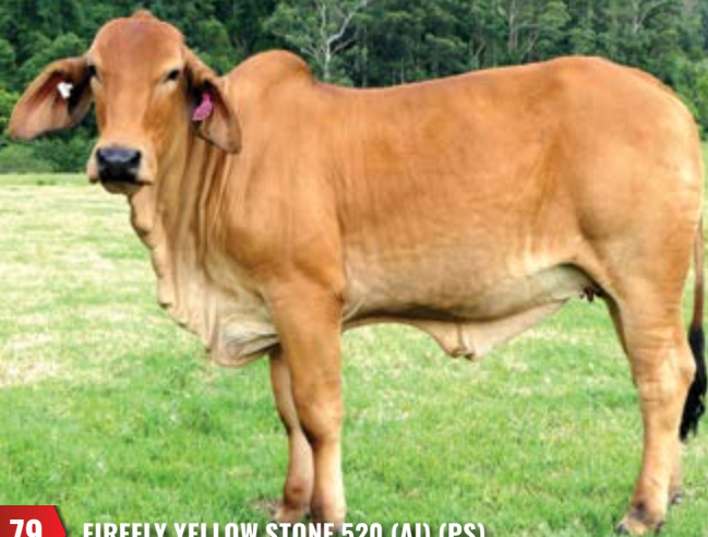
79 FIREFLY YELLOW STONE 520 (AI) (PS)