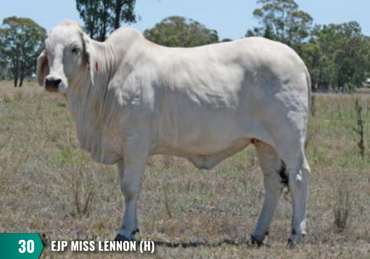
30 EJP MISS LENNON (H)