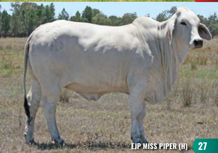
EJP MISS PIPER (H)