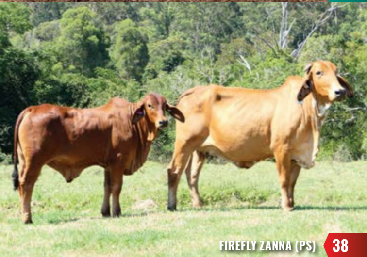
FIREFLY ZANNA (PS)