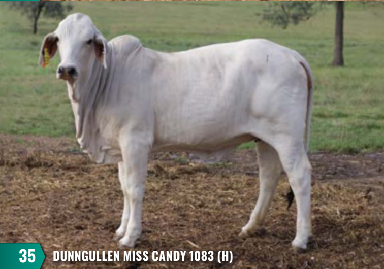
35 DUNNGULLEN MISS CANDY 1083 (H)