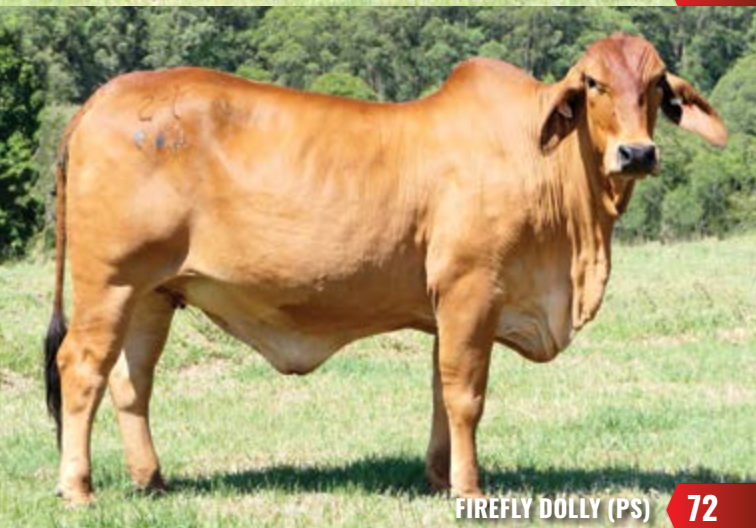
FIREFLY DOLLY (PS)