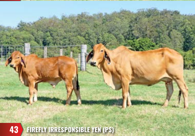
43 FIREFLY IRRESPONSIBLE YEN (PS)