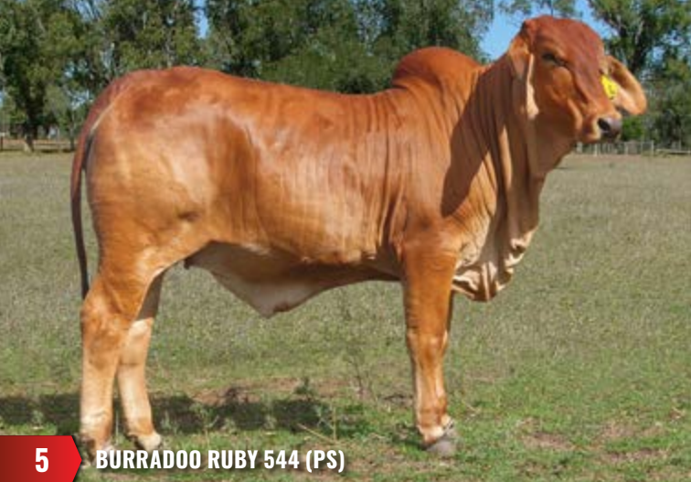
5 BURRADOO RUBY 544 (PS)