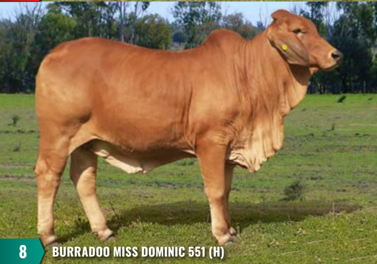
8 BURRADOO MISS DOMINIC 551 (H)