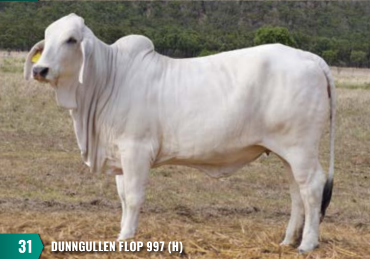
31 DUNNGULLEN FLOP 997 (H)