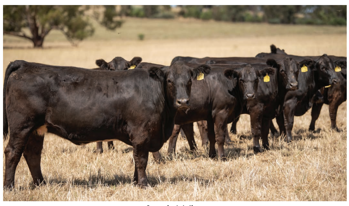
Group of sale heifers.

Whilst sad to be selling the first ET crop, we are certainly excited with her 2 natural heifers calves by Nukara and All Time and T series ET heifer calf by Riddler. These 3 heifers along with M415 will create the M415 dynasty.