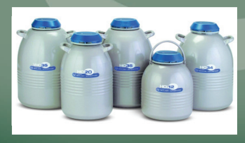
Check out Embryo Lots 52-61; Semen Lots 62-71; Semen Tanks Lots 72-73.