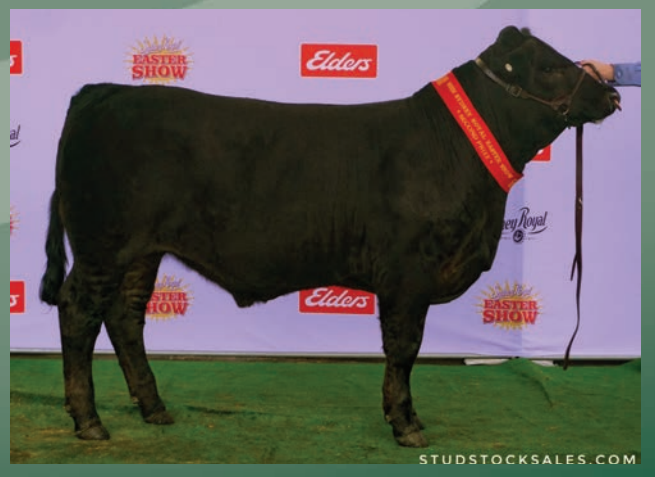
St Pauls Doug, Sydney Feature Show, 2nd on Hoof, 1st on Hook Class, 1st Taste Test, Silver Medal.