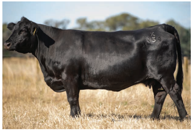
JANUARY 2023 SIMMENTAL TRANS TASMAN BREEDPLAN