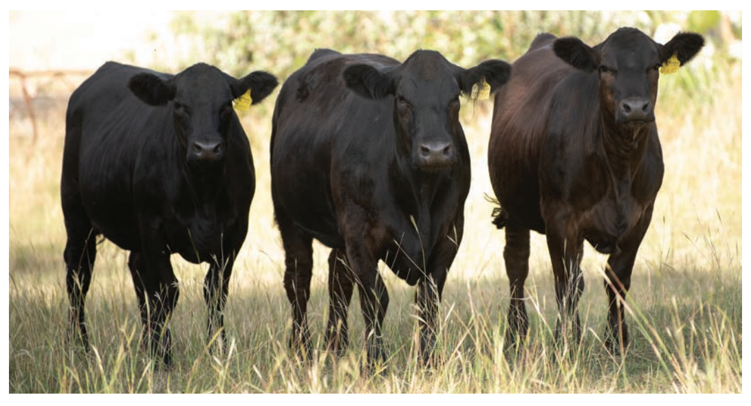
3 females L to R lot 20, 36 (the carcass queen) and Lot 37.

4 daughters sell at Lots 19-22 and a son at Lot 6.