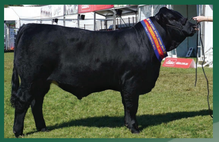
Bull calf champion Simmental 50 Years Feature Sydney 2022. Full sisters Lot 7-9.