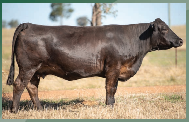
P401 sells Lot 35, embryos 60, 61, daughter Lot 36 - the carcass queen.