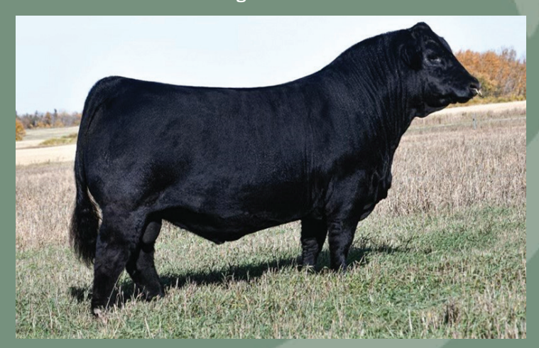
Unique opportunity to get Caliber genetics. 3 embryo lost. 9 females carry his service.

Why not combine this with the Australian IGS Convention at Wagga just 45 minutes drive.