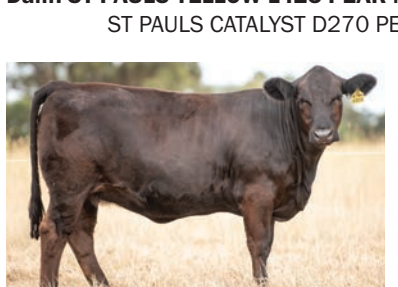
Daughter S358 - Lot 16