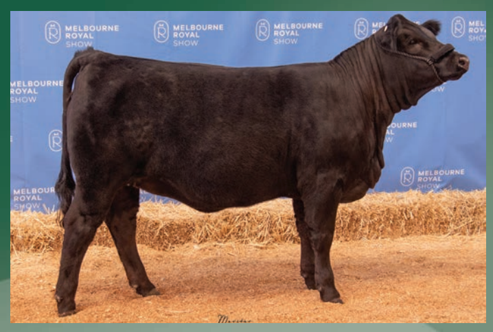
All 4 St Pauls Melbourne Show heifers in this sale -Lots 7, 16, 17 and 18.