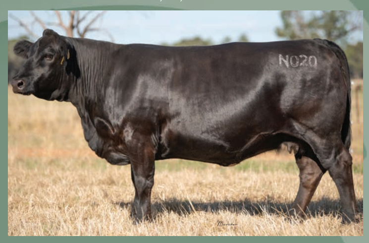
Lot 39 this donor sells, plus embryo Lot 57, daughter Lot 40.