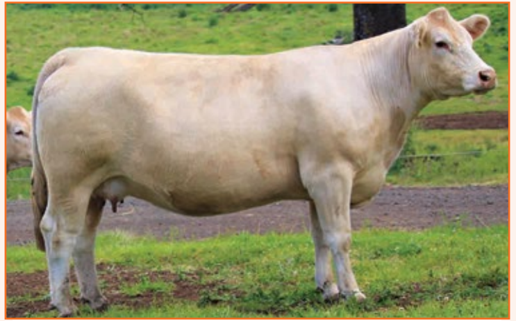
Photo taken in 2020. Age 12 months. She was Champion Female at the Charnelle invitational sale in 2020.