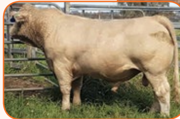
Inset photo at 2.5 years after joining one mob and out with his second mob of cows.