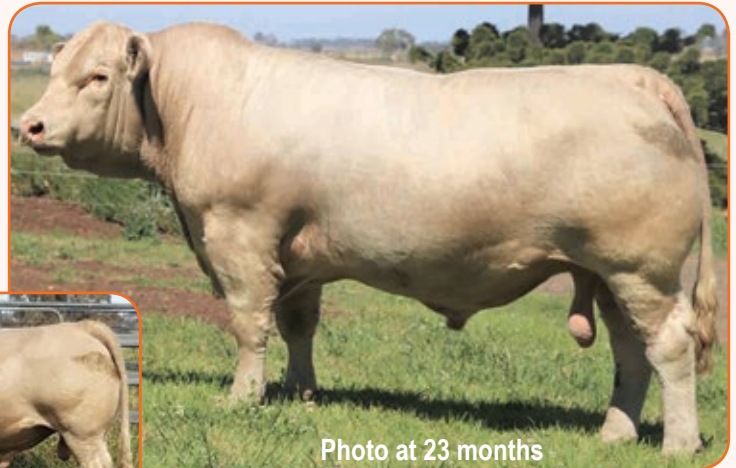
Photo at 23 months