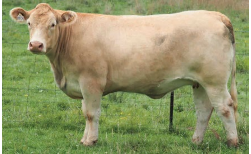
Led female that will attract attention whenever she is on a halter in the show ring.

COMMENTS: What a tremendous female to start a run of 5 E.T. heifers. Thick bodied, excellent fat cover, bone, strong polled head. PLEASE NOTE all of the females in this sale presented straight out of the paddock with no supplementary feeding, which really just highlights their quality. Dam is Glenlea Janet Z8E, she raised her last natural calf at 16 years. Her lifetime earnings are in excess of $75,000, R106 could easily exceed this figure. Sired by breed legend, Silverstream Hostler (P) growth, carcass and finish are his progeny hallmarks. DNA PV verified to mating