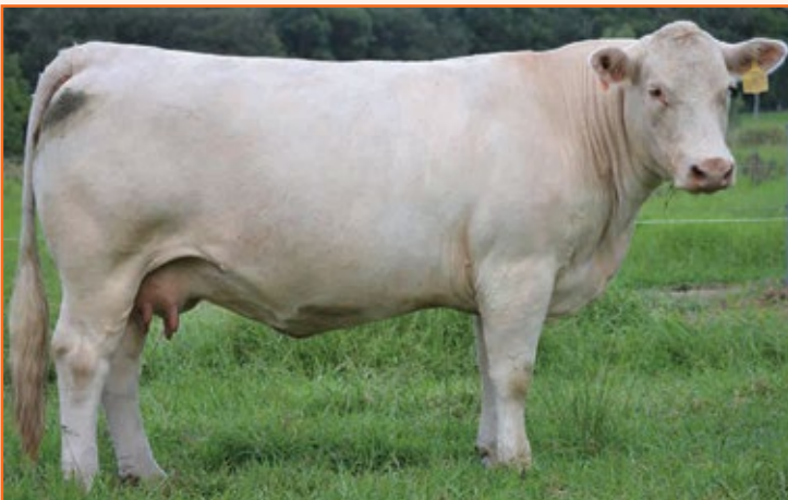
Photo taken in 2021. Age 7 years