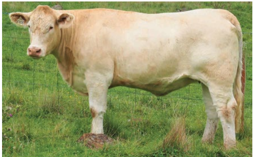
Led female that would be competitive at any show in 2023/24.

COMMENTS: Absolute outstanding Red Factor females like R102 never get sold, except in a dispersal such as this sale! Growth, fine coated, great bone, carcass and strong maternal traits, bred to breed stud sires! Dam has been a great producer, from another of Glenlea's oldest cow families with one of the lead young cows and calves at lot 18 a full sister to R102E. Sire is a growth trait leader in the breed with nearly 100 registered progeny and this heifer and Lot 18 are two of his best daughters. DNA PV verified to mating