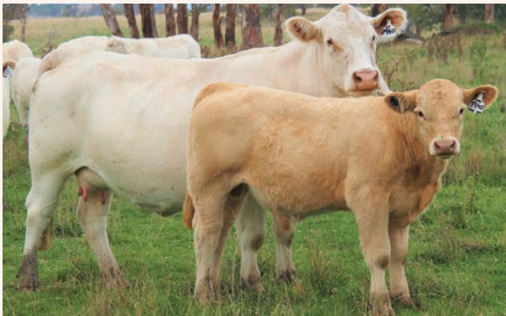
Lot 20 and her outstanding 6 month old bull calf by Glenlea Kowboy (P) R/F