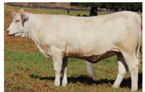
Photo above: First calf of L22, Glenlea Isabella 3rd (P) GLE P2E at age 12 months.

EBV's Top 1% of breed for Rib and Rump Fat and IMF%, top 5% for Milk, Top 10% for EMA, Top 15% for all growth traits, Carcass Wt. and Scrotal. All this and still below breed average BW. And looks as classy as she does! Total of 13 traits better than breed average!