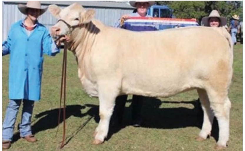
Photo: Q27's Dam, Waterford Lady Gina L33E.

COMMENTS: This young cow has extra length, softness and bomb proof temperament. Photo of her will be on AuctionsPlus prior to sale day. Sire is well known Hallmark, with over 550 registered progeny he is a totally proven sire. Dam is lot 16 the champion show cow. She has 3 daughters in this sale. Her 2022 Bull calf retained for sale later in 2023, she is offered as a joined female. Double Polled.