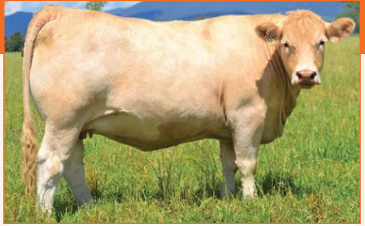
Photo taken in 2021. Age 8 years