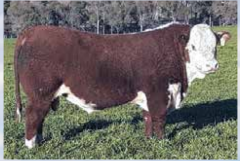
YALGOO NINJA P228 (PP) SODP228