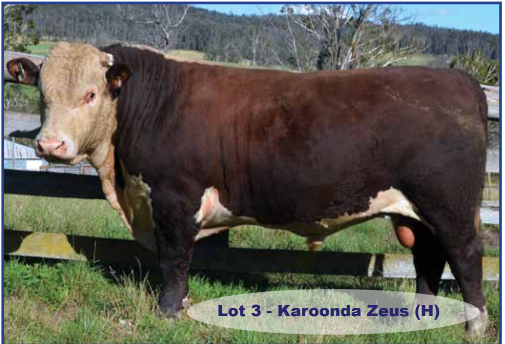
Lot 3 - Karoonda Zeus (H)