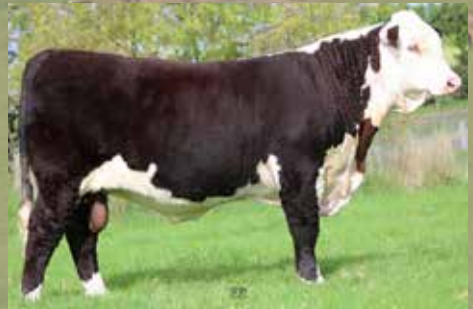
MAWARRA IF ONLY (H) HRPQ264