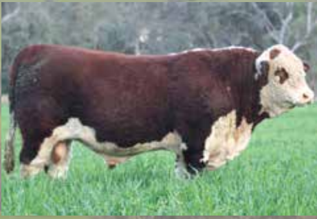
CASCADE ANZAC P162 (PP) CDEP162