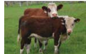
Pictured Left - K. Rosette E308 at 13 years with her 2022 drop bull by Warwick Court Quaff (H)

KAROONDA SILVER (H) KAROONDA WOODBINE Q781 (H) KAROONDA FIRST DAY HO34 (H) KAROONDA ZIMMERMAN S491 (H) RED HILL WHISKY 2 (AI) (H) KAROONDA ROSETTE E308 (AI) (H) KAROONDA ROSETTE B198 (H)