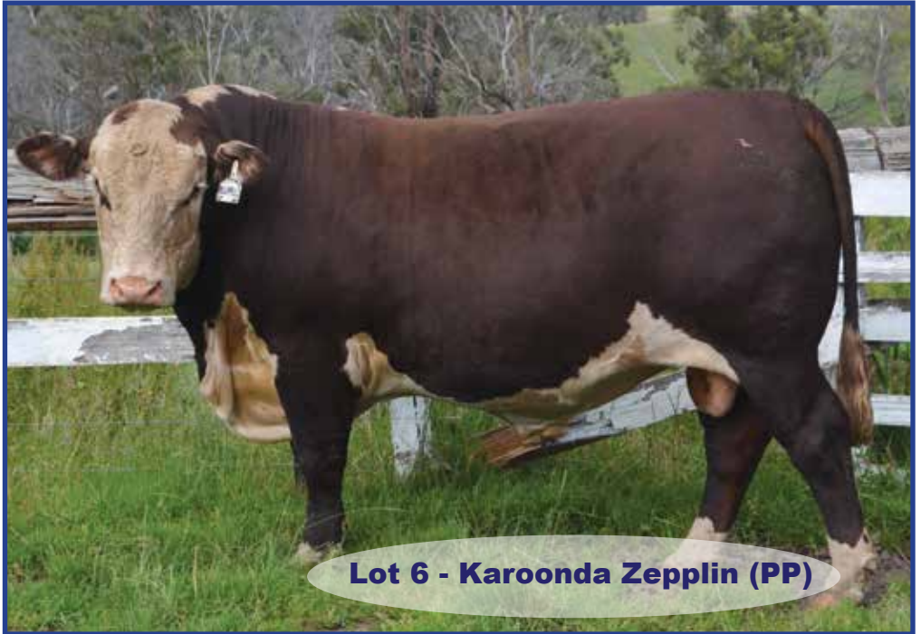
Lot 6 - Karoonda Zeplin (PP)