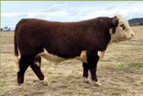
YALGOO MINOTAUR Q132 (AI) (PP) - SODQ132