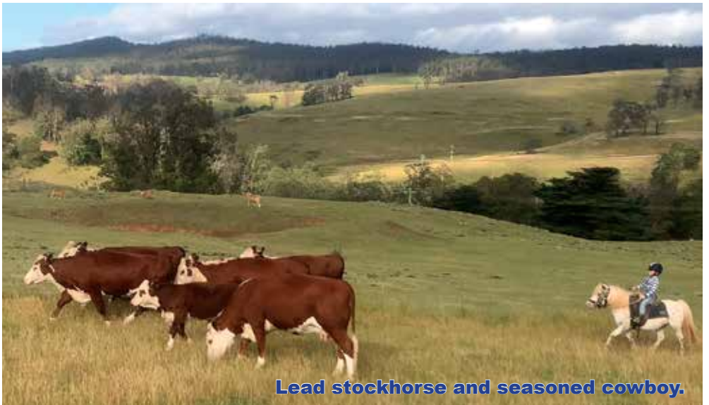
Lead stockhorse and seasoned cowboy.

All bulls genomically tested & sire verified.