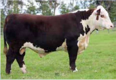
MAWARRA SHOWTIME P277 (PP) HRPP277