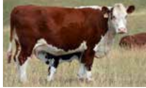
Pictured Left - K. Last Day F707 with K. Zanetti.

KAROONDA SILVER (H) KAROONDA WOODBINE Q781 (H) KAROONDA FIRST DAY HO34 (H) KAROONDA ZANETTI S500 (H) IRONBARK RAMBO C225 (AI) (H) KAROONDA LAST DAY F707 (H) KAROONDA LAST DAY V671 (AI) (H)