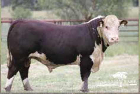
YARRRAM LOTTERY R126 (H) YPHR126