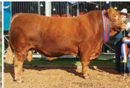
Morrisvale Kept Secret