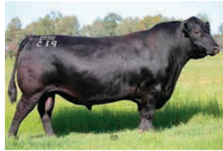
Millah Murrah Paratrooper