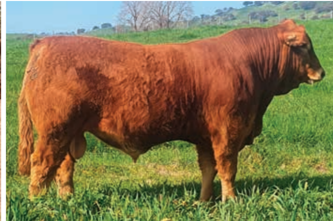
Flemington Quick Level Q40