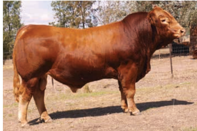
Flemington Next Level N40