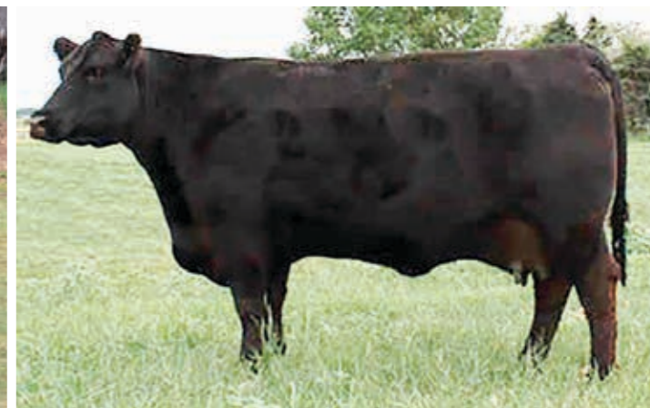
Youngdale Pollyanna 22P DSK Donor Dam 2006 Grand Champion Female, Farmfair