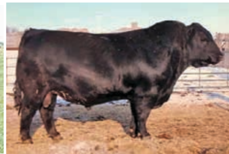
Youngdale Xcaliber 32X Sire of JSRL Pokerface P21