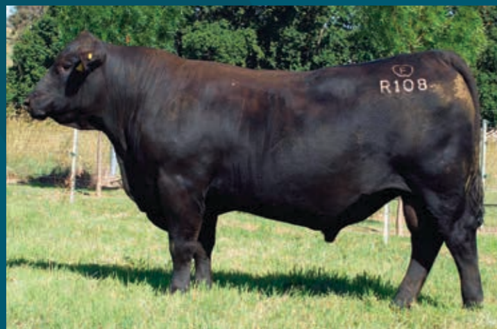
FLEMINGTON RICOCHET R108 Sold to Hewitt Cattle Co. for $16,000