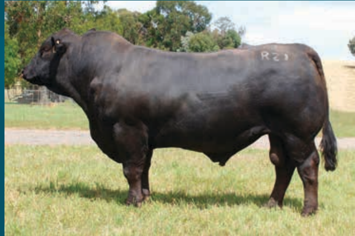
FLEMINGTON READY OR NOT R21 Sold to Provenance Limousins for $34,000