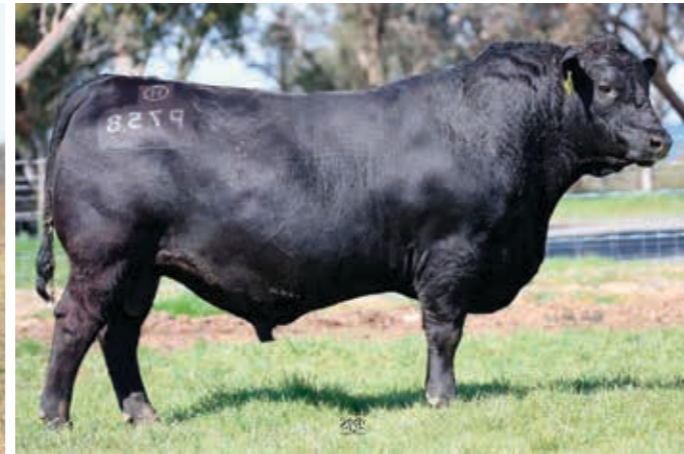
Dunoon Prime Minister