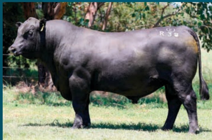
FLEMINGTON GI RESISTANCE R38 Sold to Hewitt Cattle Co. for $16,000