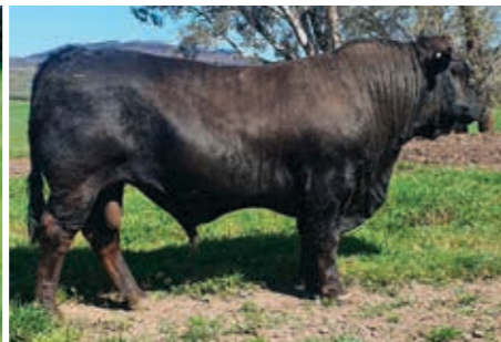
Mandayen King P57