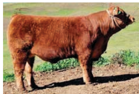
Grand Champion Carcase 2021 Glen Innes

OFFERING A CASH INCENTIVE OF $500 TO THE SUCCESSFUL PURCHASER, if any of these steers go on to win a Grand Champion Hoof or Hook Award at a Royal Show or a Major Steer Show.