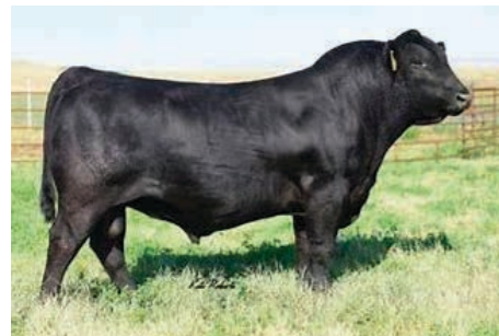
Byergo Black Magic