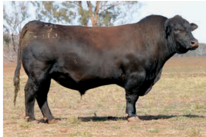
Texas Earnan L612