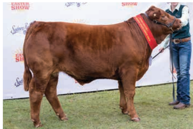
Flemington P8 Reserve Champion Middleweight Carcase & Gold Medal Winner Sydney Royal

The steers offered will be offered individually (dam not included) and will be weaned prior to delivery (dam excluded from sale). Due to their age, if required, the steers can stay at Flemington until 30th April 2023.