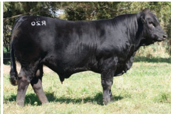
Flemington Ready to Roll R20