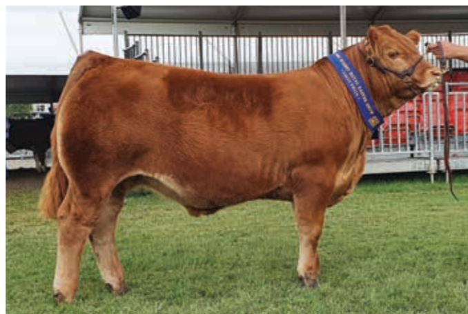
Class Winner 2022 Sydney Royal Sold for $10 per kg

Some of our major steer awards in recent years include: