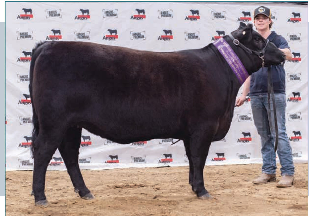
JSRL ENTICE JESTRESS S18 Supreme Exhibit - 2022 Angus Youth Roundup Maternal sister to Lot 23

A low birthweight bull that should suit a heifer joining.