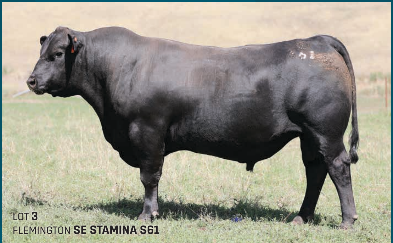
LOT 3 FLEMINGTON SE STAMINA S61