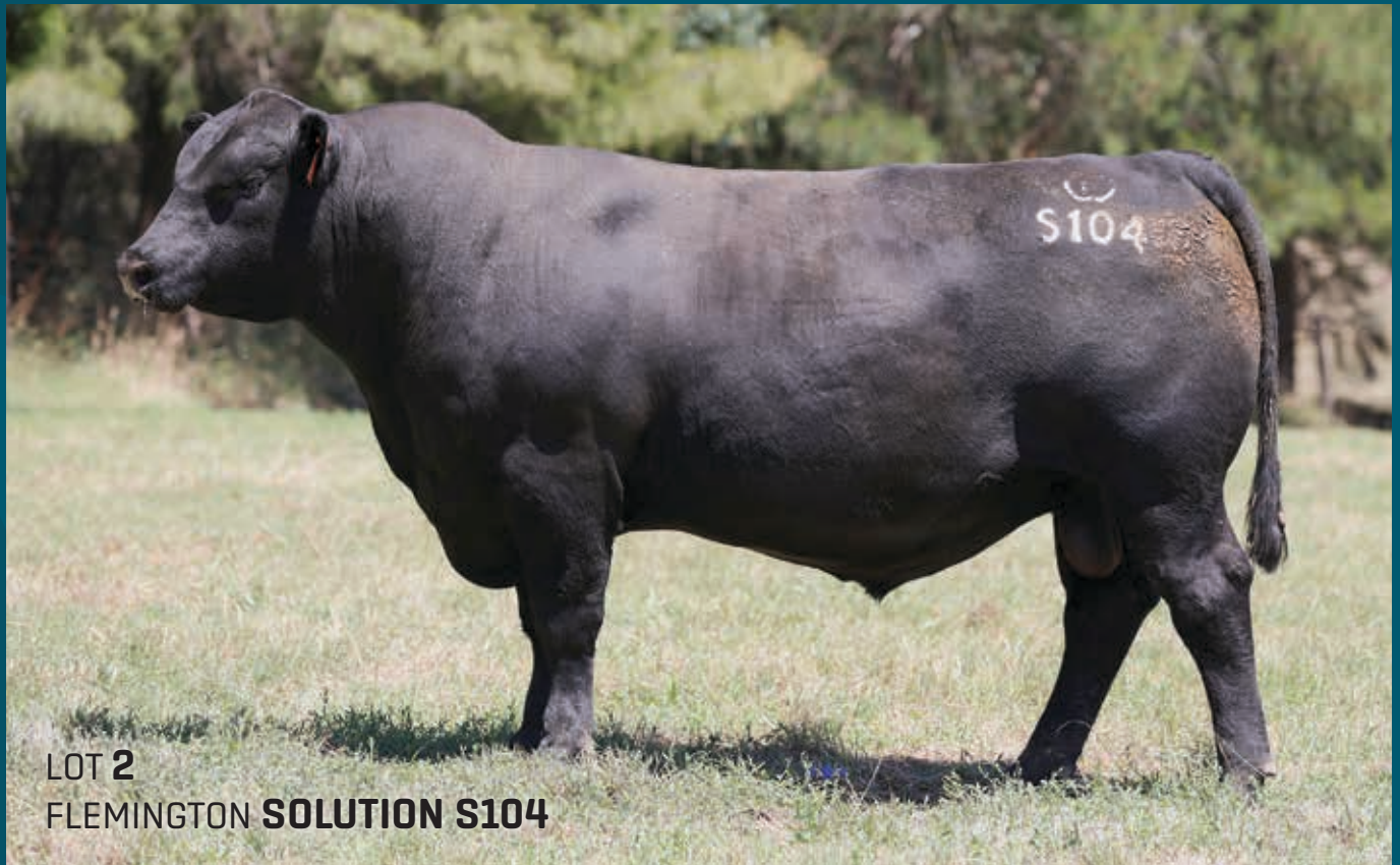
LOT 2 FLEMINGTON SOLUTION S104