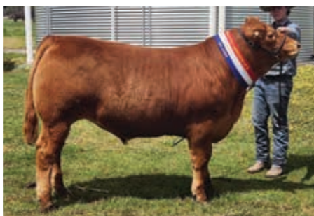
Heavyweight Champion Steer 2022 Scone Beef Extravaganza