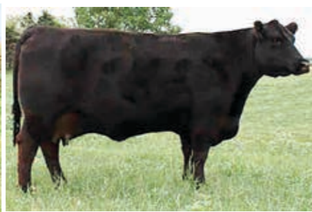
Youngdale Pollyanna 22P Dam of JSRL Pokerface P21