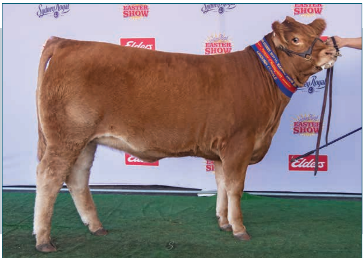
FLEMINGTON 704F U-BEAUT R94 Junior Champion Female - 2022 Sydney Royal Sired by Greenwood Fernando 704F

Travelling to find suitable animals to suit our breeding criteria of maternal strength, fertility, extra frame and muscle content with the efficiency and constitution to suit our Australian conditions.