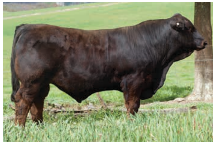
Flemington Quiet Achiever Q63