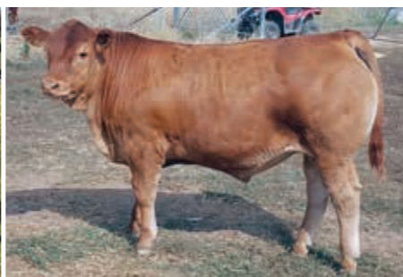
Class Winner - Sydney Royal Sold for $14 per kg