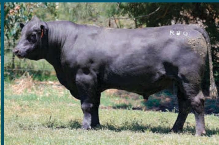
JSRL ROCK STAR R80 Sold to Sawpit Creek Angus for $16,000