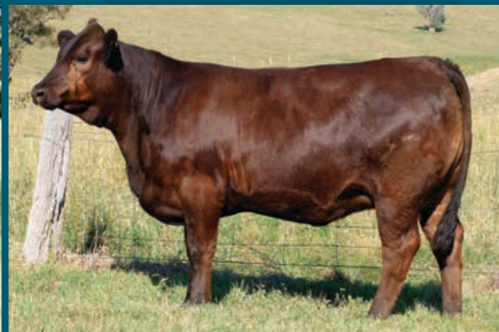
FLEMINGTON CUPID R15 Sold to Provenance Limousins for $16,000