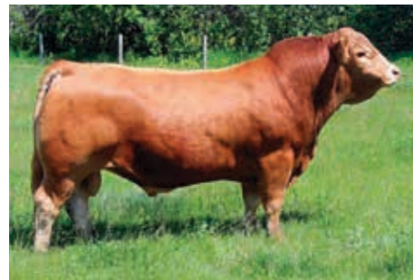
Greenwood PLD Fernando 704F