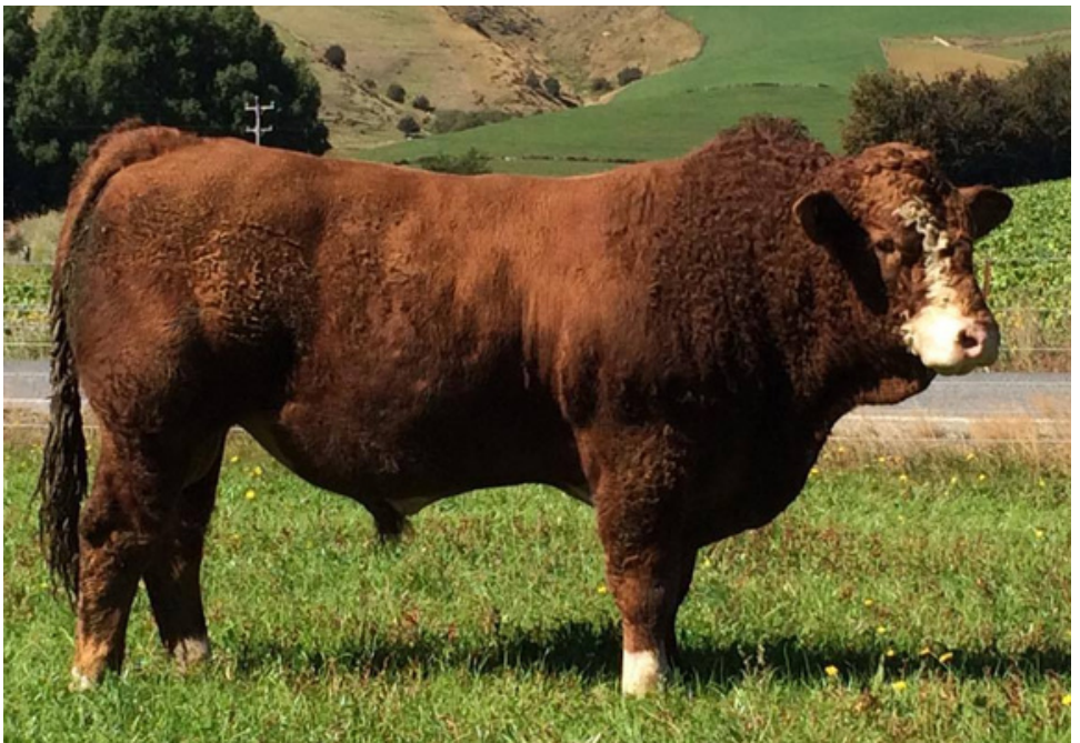
GLENSIDE CRUMPY C4 (PP)