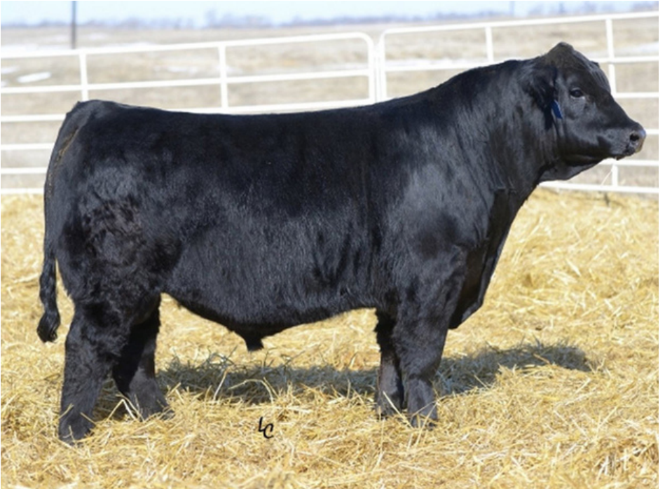
KBHR HIGH ROAD E283 (P) (B)