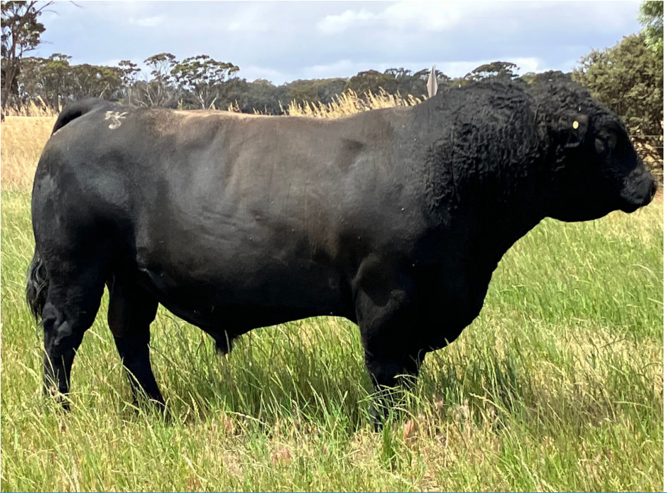
WOONALLEE PHYSIO (PP) (AI) (B)