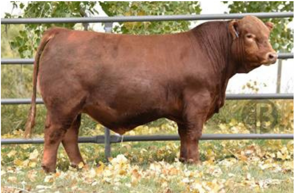
WS EPIC E152 (P) (R)