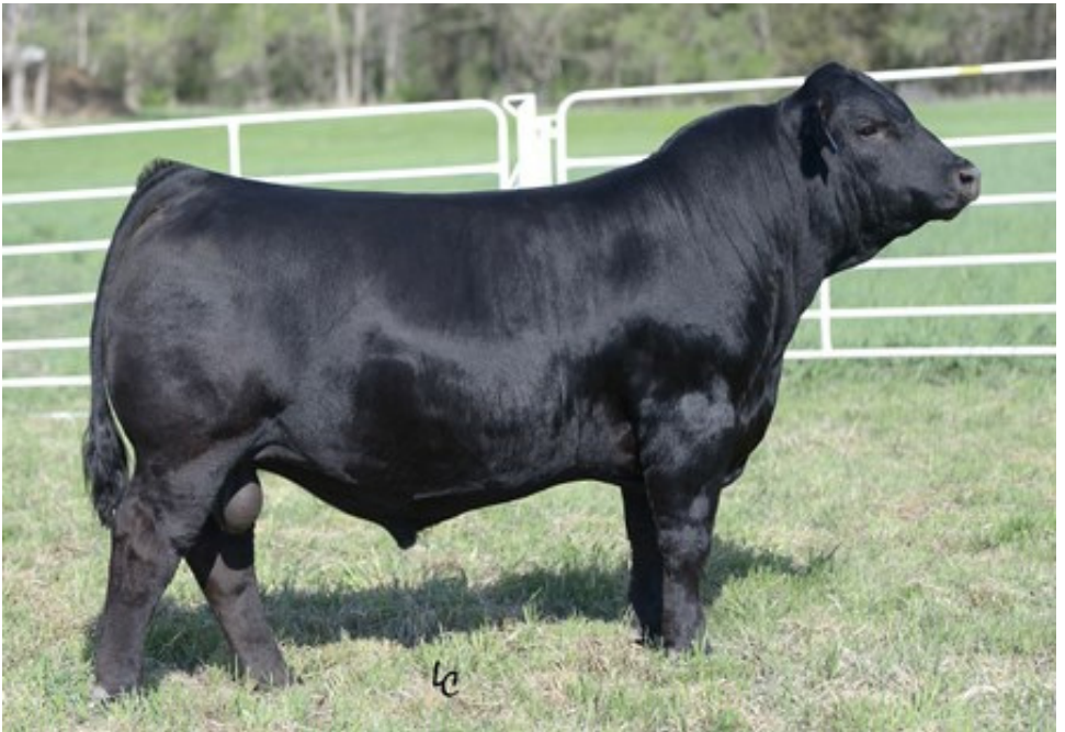
WS PROCLAMATION E202 (P) (B)