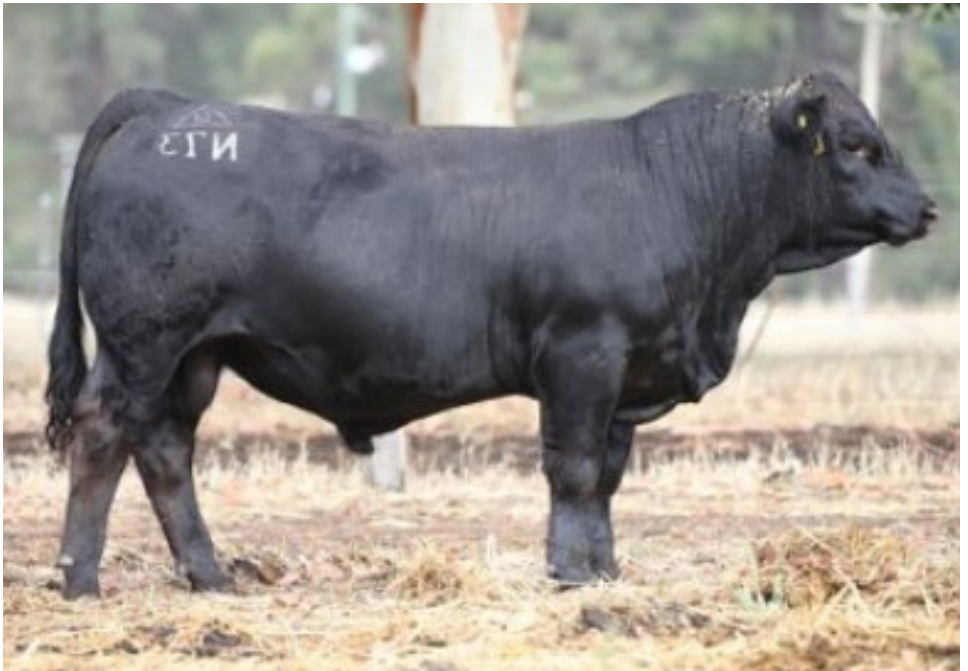
BONNYDALE NUKARA (P) (AI) (B)