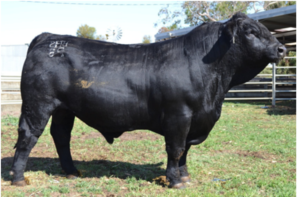
BULLOCKHILLS PERCY P5 (PP) (ET) (AI) (B)