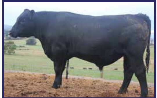
BARNETT TITAN T3