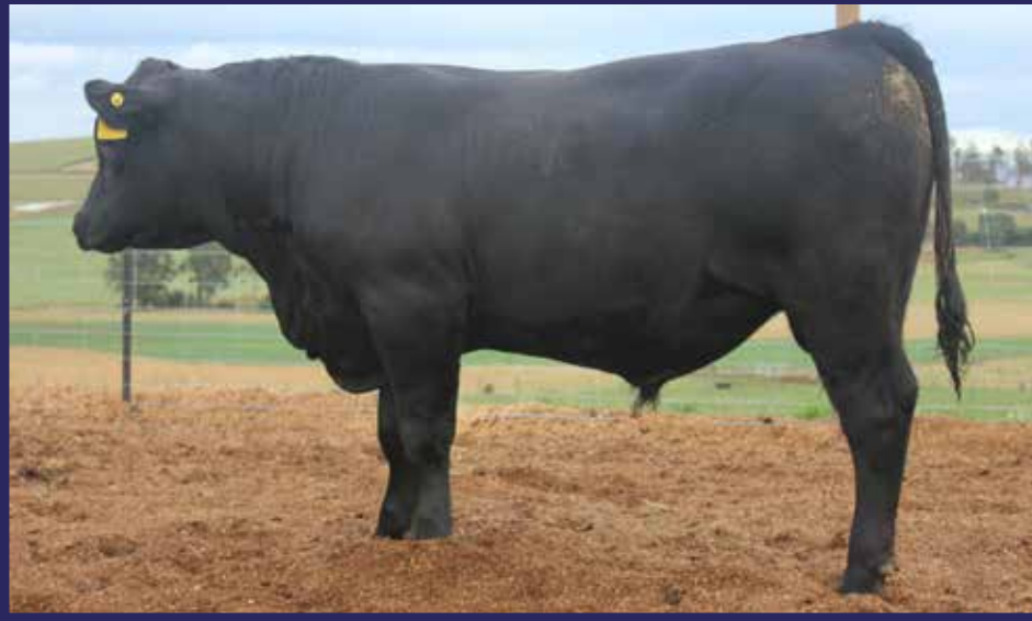
BARNETT TITUS T17