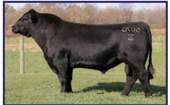
SIRE: G A R DUAL THREAT