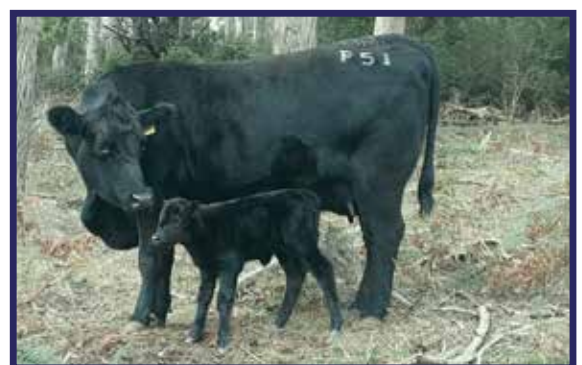
DAM: AYRVALE PROTOTYPE P51