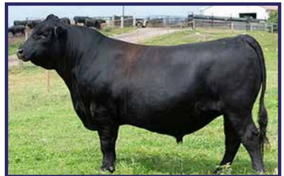
SIRE: ROSEDA POWERBALL23 F091