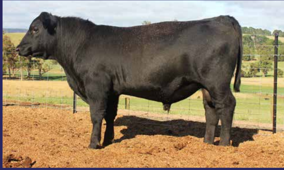
BARNETT TAURUS T22