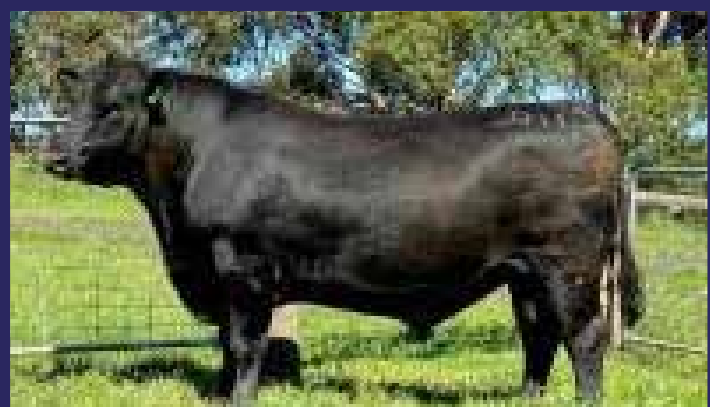
MURDEDUKE QUARTERBACK Q011