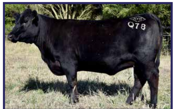
DAM: AYRVALE QUEANBEYAN Q78