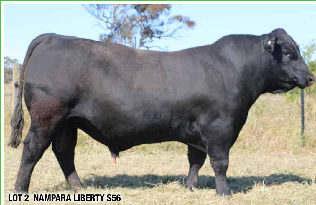
LOT 2 NAMPARA LIBERTY S56