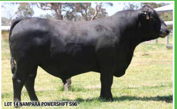
LOT 14 NAMPARA POWERSHIFT S96