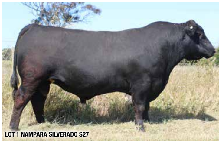
LOT 1 NAMPARA SILVERADO S27