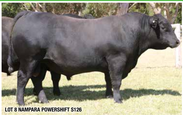
LOT 8 NAMPARA POWERSHIFT S126