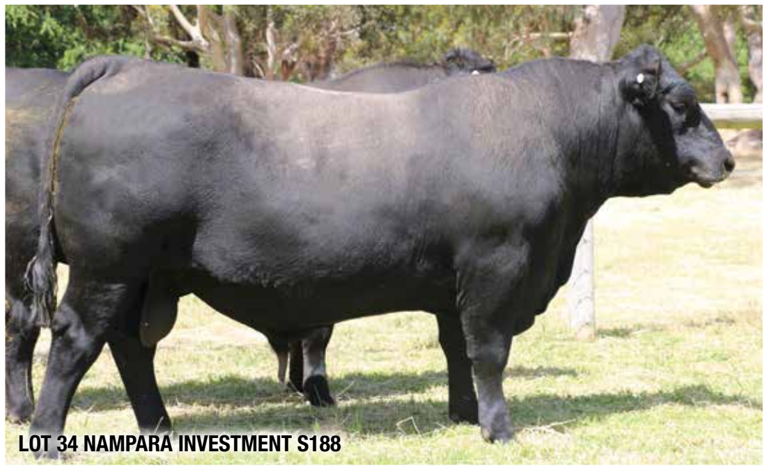
LOT 34 NAMPARA INVESTMENT S188