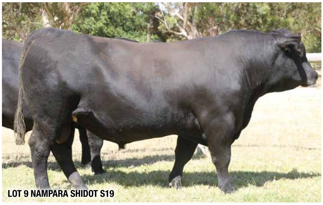
LOT 9 NAMPARA SHIDOT S19