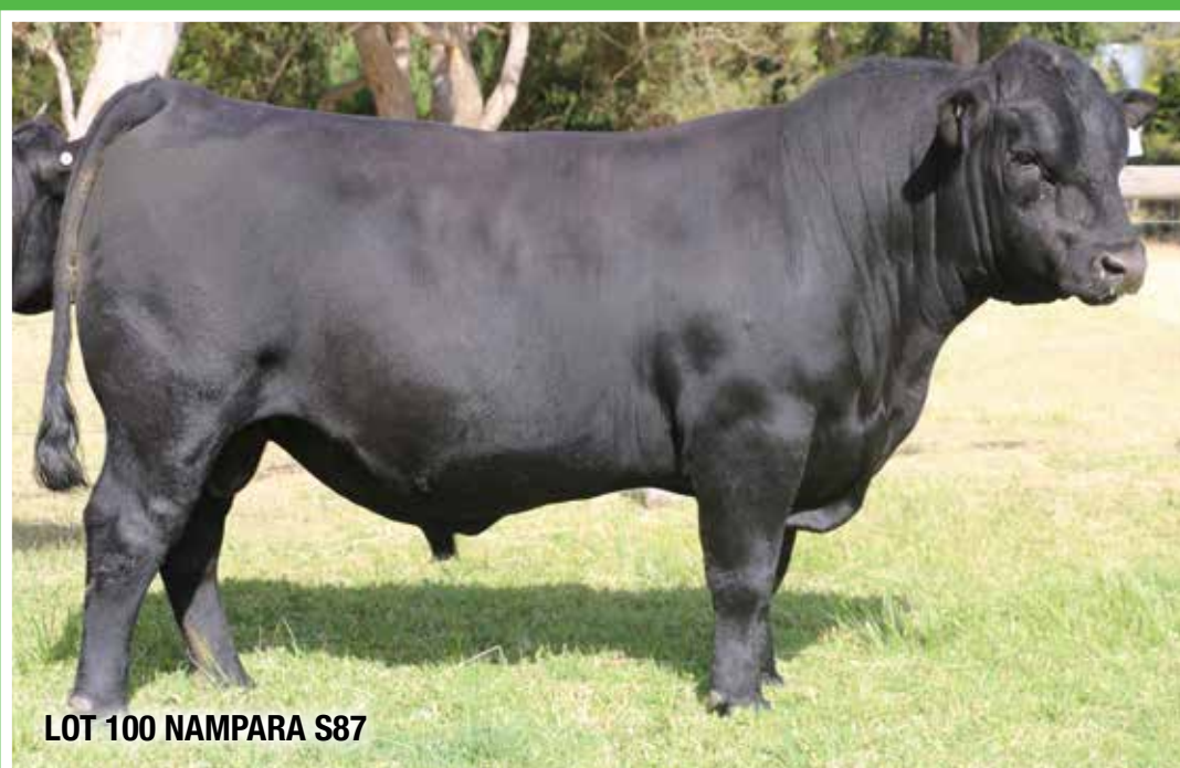
LOT 100 NAMPARA S87