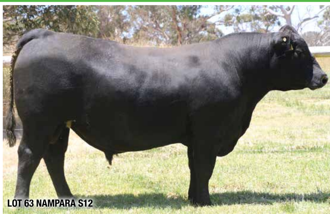
LOT 63 NAMPARA S12