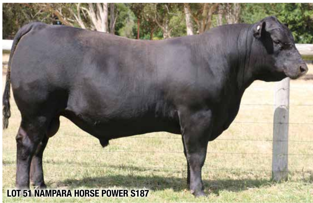
LOT 51 NAMPARA HORSE POWER S187