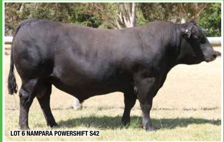
LOT 6 NAMPARA POWERSHIFT S42