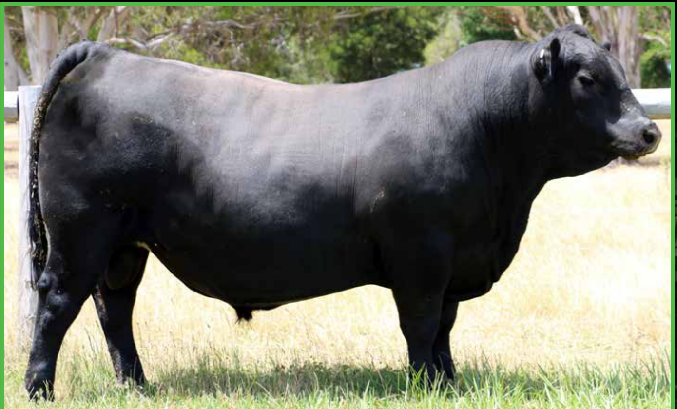
Nampara Liberty R185 sold to the Smith family, "Shady Grove" for $32,000 at our 2022 sale.

NAMPARA PAST CO 13 HEIFERS PTIC ANGUS To Nampara Past Co Angus B 14 NAMPARA PAST CO 15 HEIFERS PTIC ANGUS Rising 2 yr old. Bulls in 20/5/15. Bulls out 22/7/15. To Nampara Past Co Angus B