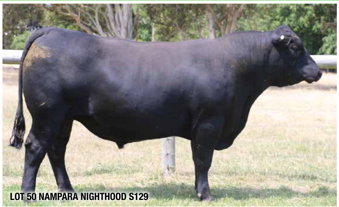
LOT 50 NAMPARA NIGHHOOD S129