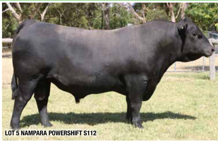
LOT 5 NAMPARA POWERSHIFT S112