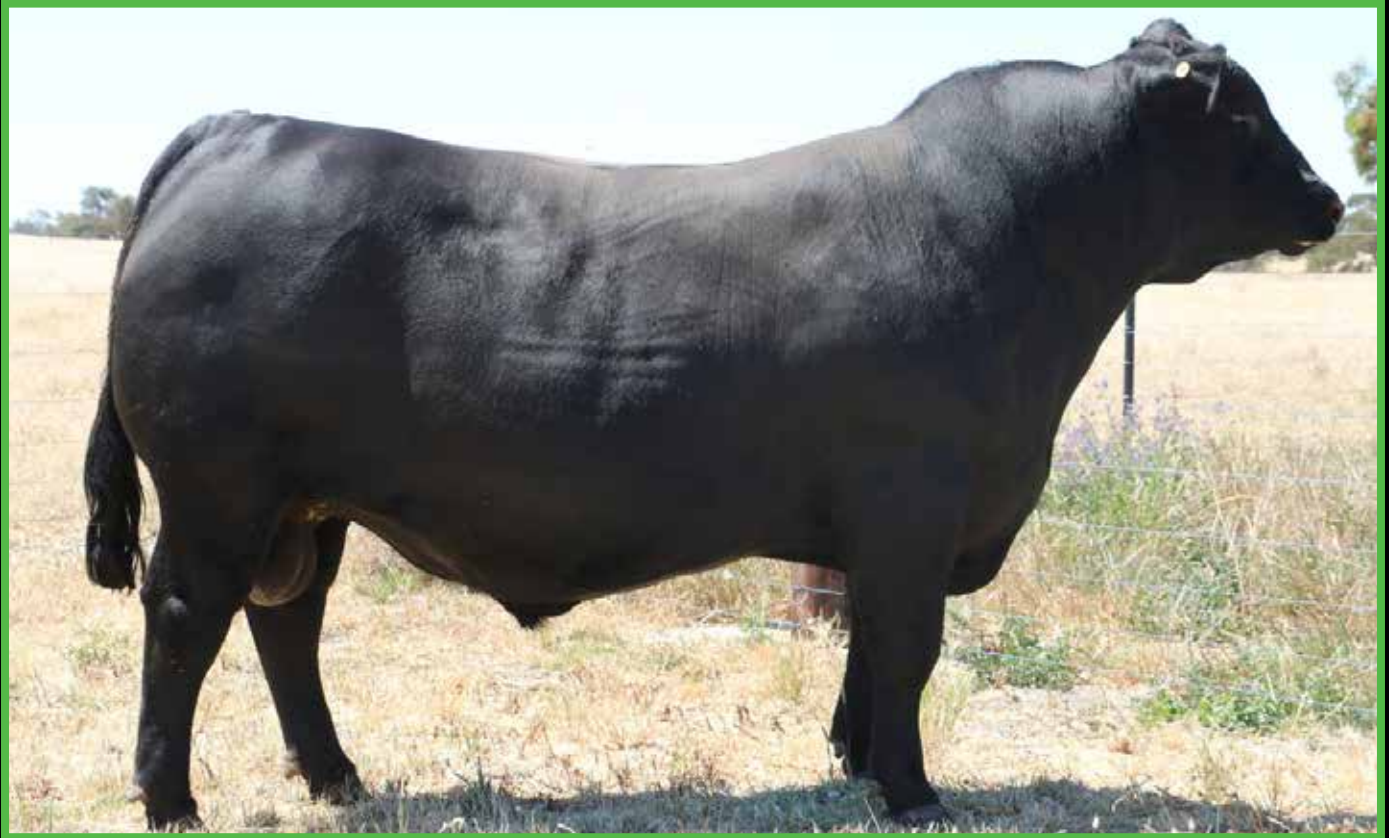
Nampara Freightliner R11 sold to Camp Creek Partnership for $32,000 at our 2022 sale.