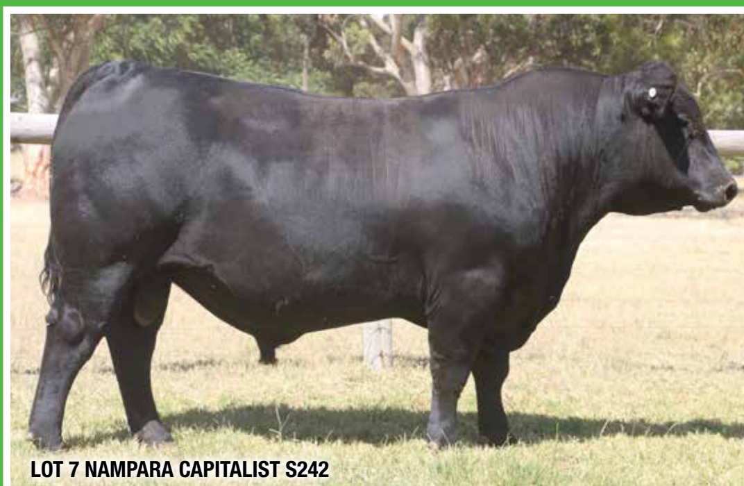
LOT 7 NAMPARA CAPITALIST S242