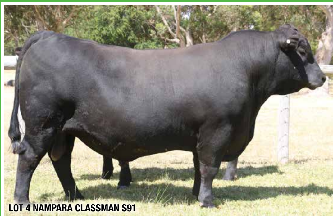
LOT 4 NAMPARA CLASSMAN S91