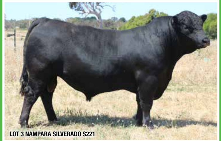
LOT 3 NAMPARA SILVERADO S221