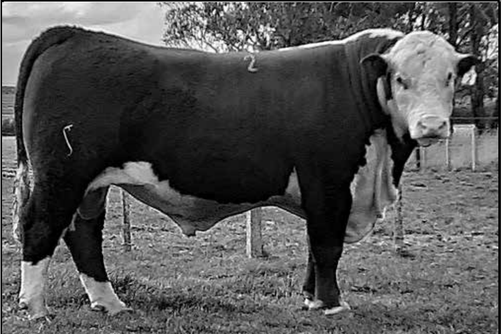
Cascade Roman R060