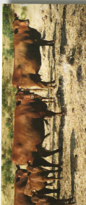
Long bodied females with super udders in the main breeding herd on Molliacca.