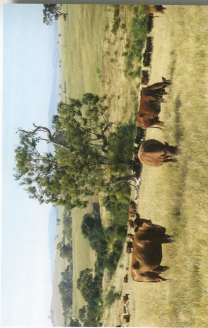
The Red Angus breeding herd in beautiful undulating country, the sown tree lines along the creek can be seen in the background.