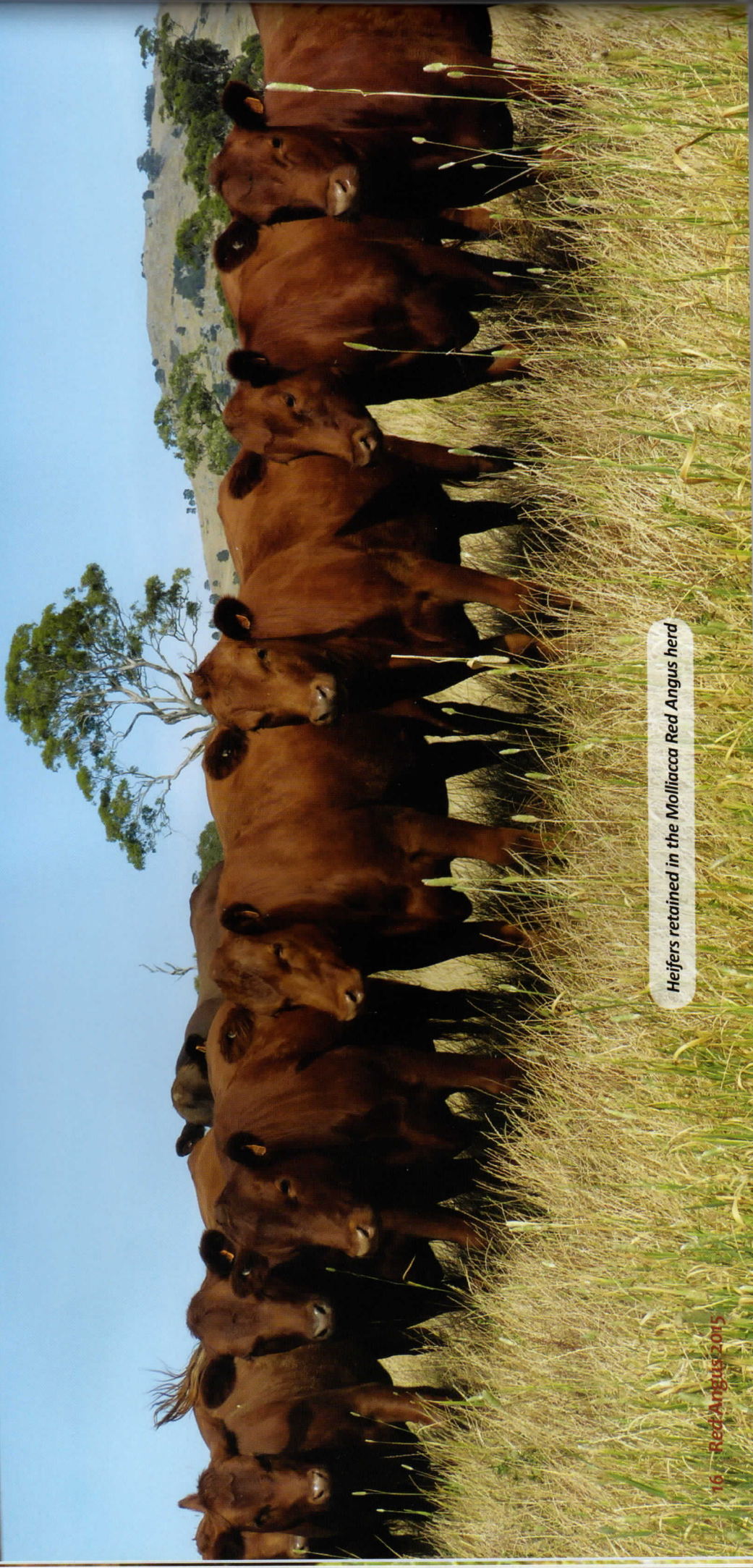
Heifers retained in the Mollitacca Red Angus herd