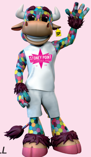
PERRY THE BULL

All semen is stored at TLG Camperdown. Purchasers will assume responsibility for storage, delivery and any other ongoing costs. Stoney Point will furnish the appropriate release authorities to TLG.