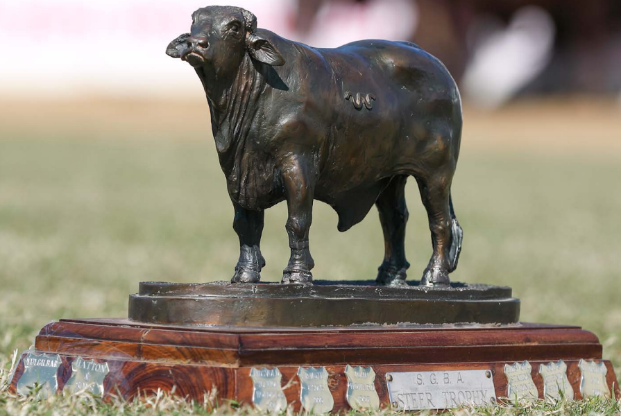
SGBAA National Steer Trophy · Winners 2018 & 2021