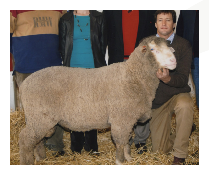
Animal ID: MACQUARIE - 174342

Reference sire MD Majestic 17-4342 .... highest ranked 2017 drop Registered Dohne ram. Retained for stud use.