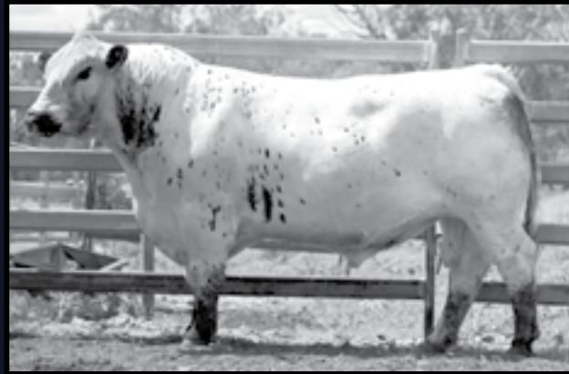
DUST N SMOKE