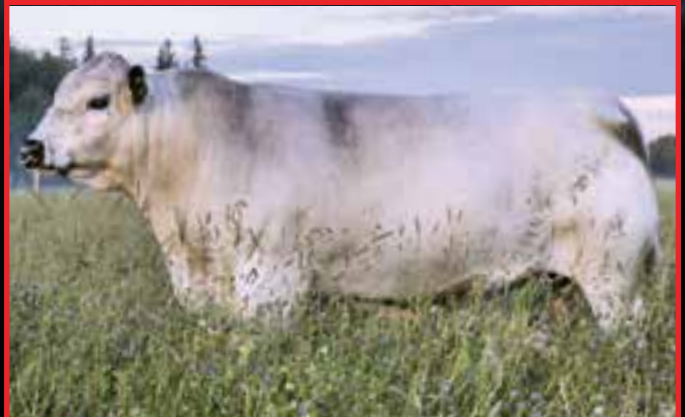
JOHNER STOCK FARMS TRADE SECRET

SIRE: SEMEX ALLIANCE YOGI GOES REDNECK DAM: MONNERY RIVER 7W