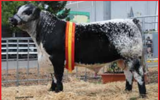
WATTLE GROVE 15R RANSOM

SIRE: A & W 15R DAM: WATTLE GROVE MISS WATTLE E3