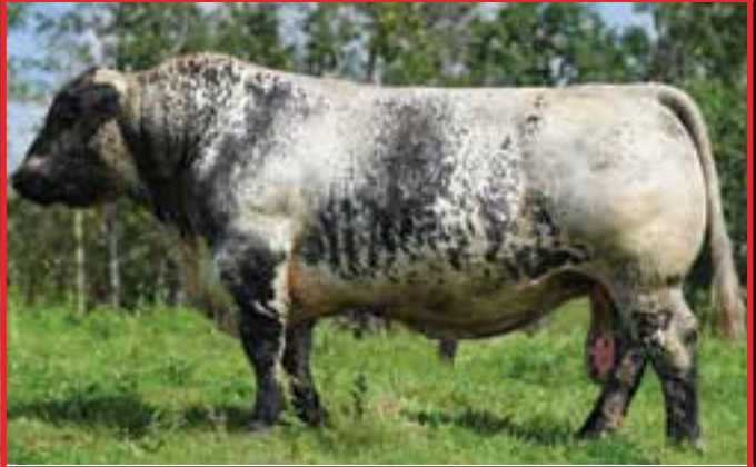
UPTO SPECS ULYSSES 25U

SIRE: RAVEN MEADOWS MAGNUM 10N DAM: PRAIRIE HILL REBA 154F