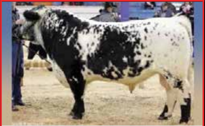
RIVER HILL 12X A'MAN 94A

SIRE: RIVER HILL GNK 12X DAM: PRAIRIE HILL PASSION 94P