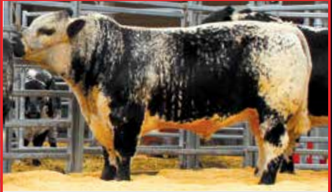
WATTLE GROVE NITRO F17

SIRE: STARBANK LACERTA 68L DAM: PARAIRIE HILL DREAMAKER 88K