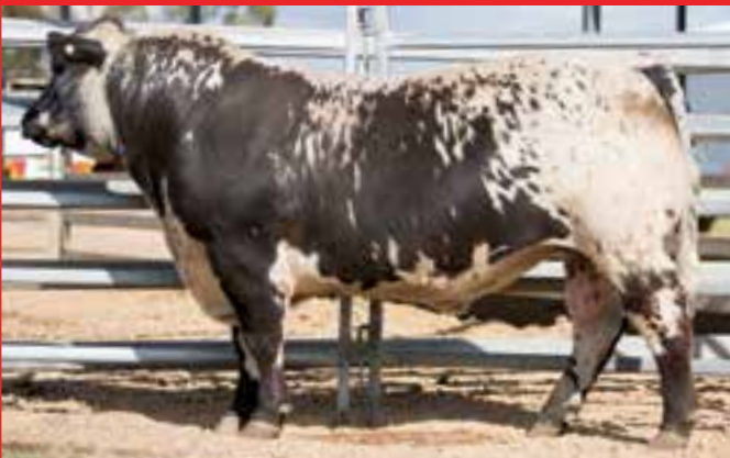
WATTLE GROVE JAGERBOMB Q120

SIRE: SIX STAR RARE COMMODITY DAM: WATTLE GROVE 99Y FAIR MAIDEN L258