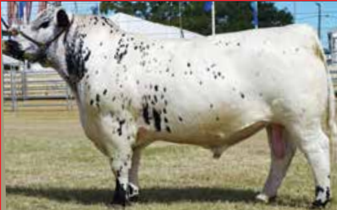
WATTLE GROVE DUST N SMOKE P07

SIRE: WATTLE GROVE SMOKE AND MIRRORS L275 DAM: WATTLE GROVE STAR DUST E2