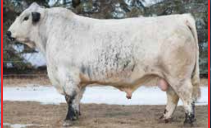
COLGAN'S BAXTER 1B

SIRE: MOOVIN ZPOTZ CAMARO 6X DAM: MOOVIN ZPOTZ ROXY AMBER 4R