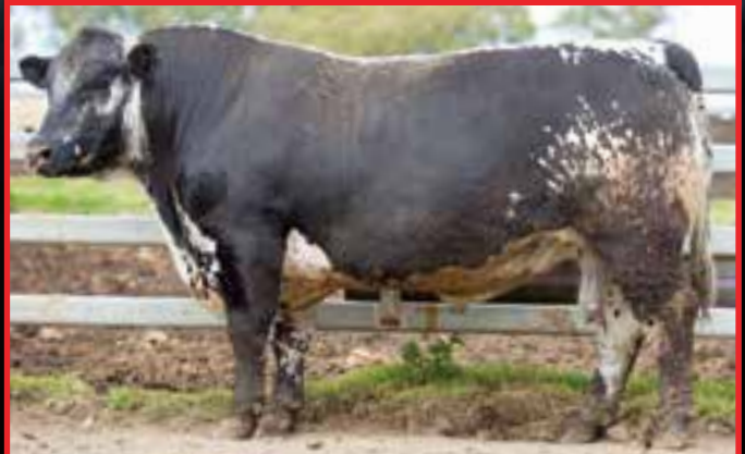
WATTLE GROVE N58 TRACTOR Q116

SIRE: WATTLE GROVE THEODORE N58 DAM: WATTLE GROVE E11 UNIQUE N25