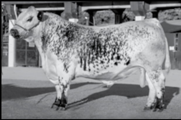
SMOKE AND MIRRORS