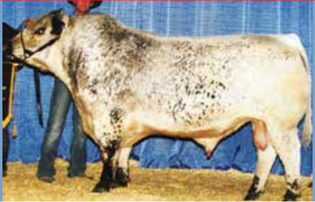
RIVER HILL LINE DRIVE 54Z

SIRE: RIVER HILL 26T WALKER 60W DAM: NOTTA PHO-FINISH 54P