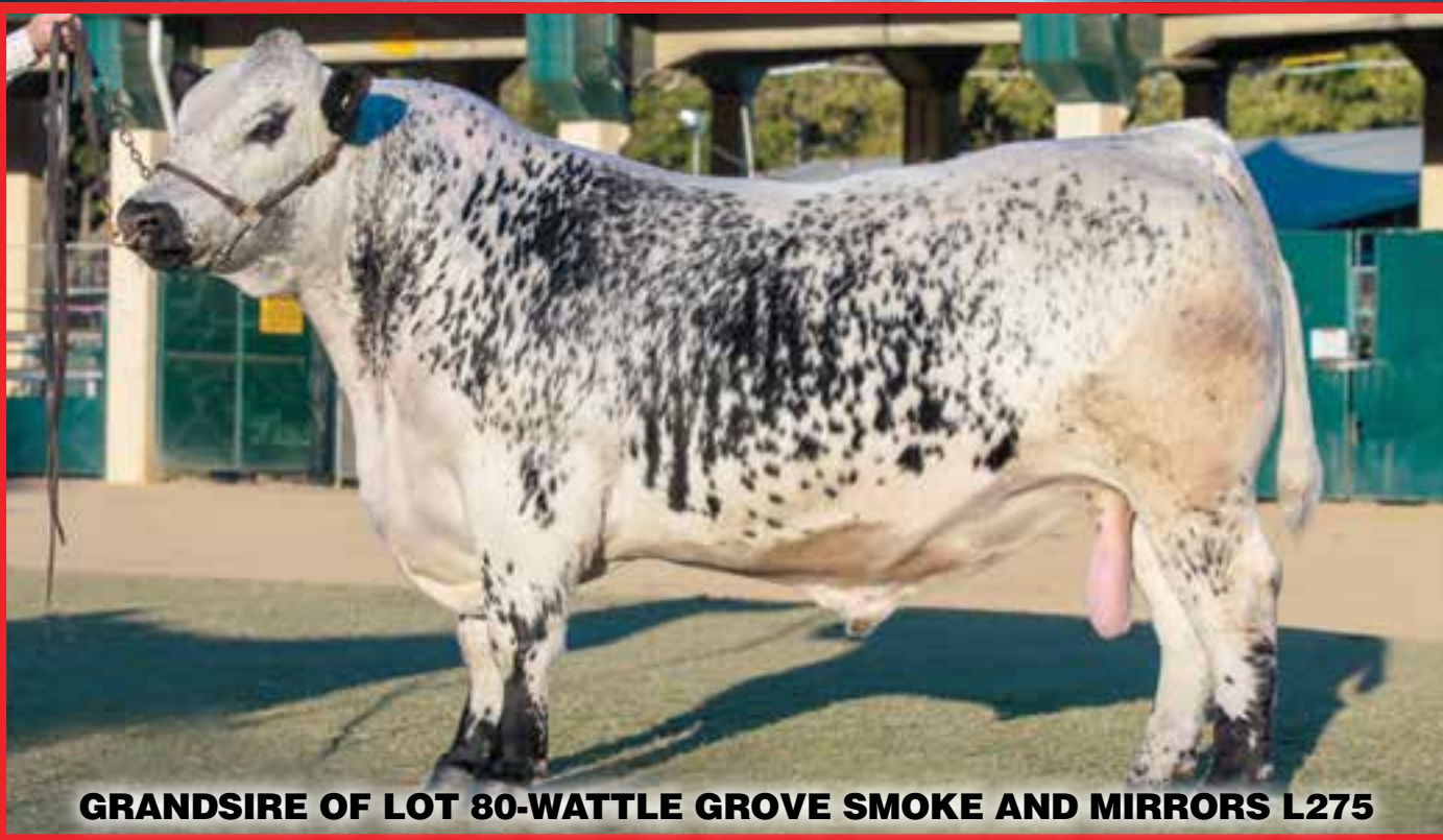
GRANDSIRE OF LOT 80-WATTLE GROVE SMOKE AND MIRRORS L275