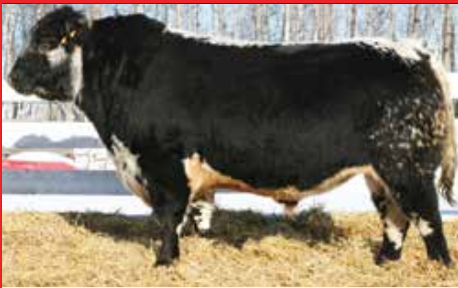
RIVER HILL TRAFFIC JAM 26T

SIRE: RAVEN MEADOWS MAGNUM 10N DAM: PRAIRIE HILL REBA 154F