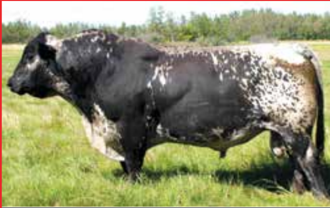
AVERY CREEK BANJO 01B

SIRE: ZORO MATTERS 1Z DAM: TUMBLEWEED ACRES LULU 18Y