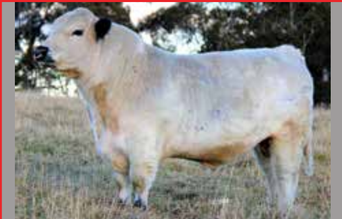
WATTLE GROVE MERLIN F67

SIRE: CODIAK CRIKEY GNK 13U DAM: WILDWOOD KARA 4K