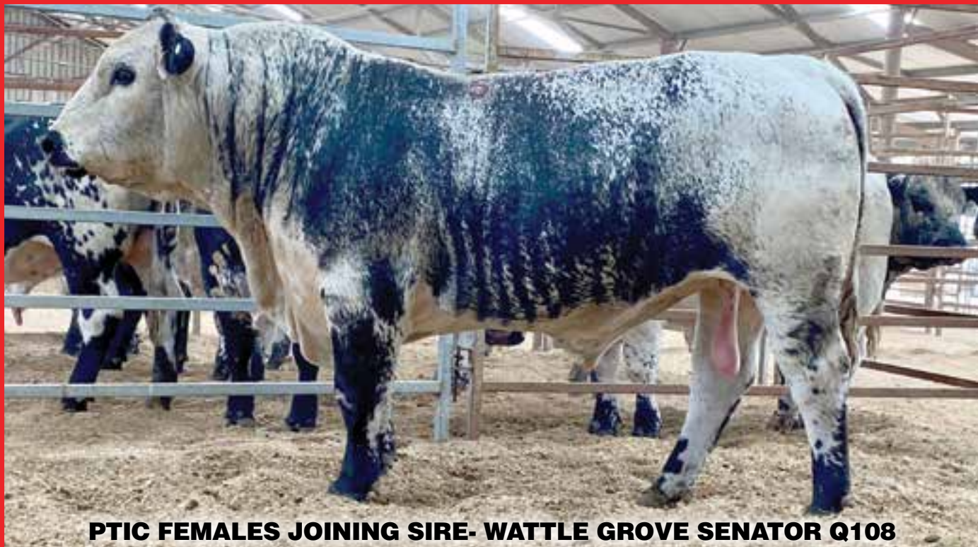
PTIC FEMALES JOINING SIRE- WATTLE GROVE SENATOR Q108