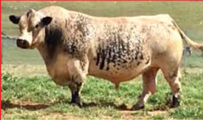
WATTLE GROVE SMOKE AND MIRRORS L275

SIRE: CODIAK PUTNAM GNK 61Y DAM: CODIAK GOOD GOLLY GNK 11U