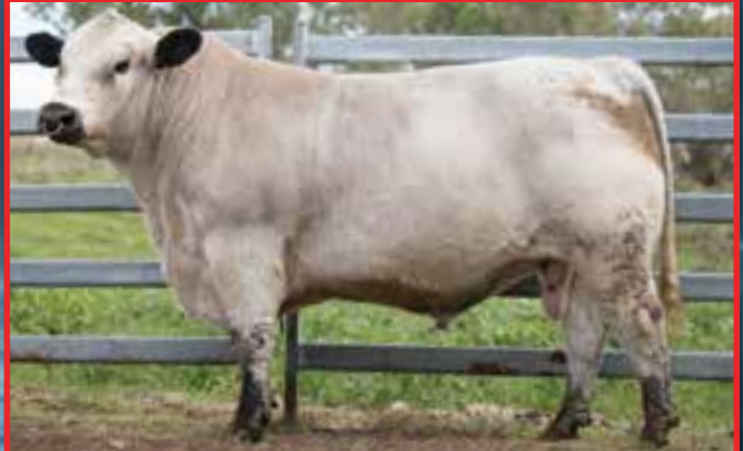
WATTLE GROVE PLAYER P201

SIRE: AVERY CREEEK BANJO 01B DAM: WATTLE GROVE E41 STARDUST J33