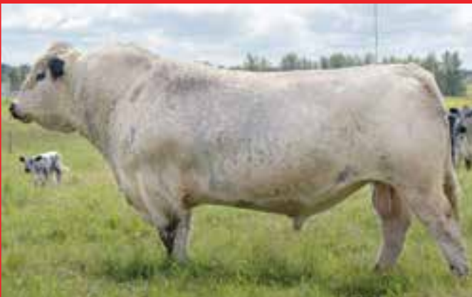
CODIAK MONUMENT GNK 107D

SIRE: CODIAK OSCAR GNK 8S DAM: CODIAK UNIQUE GNK 8R