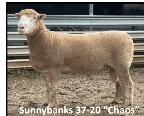
Sunnybanks 37-20 "Chaos"