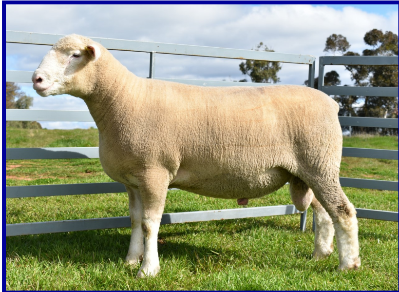
GLENORE 48/21 - Retained in Stud

Commencing at 1.00pm Viewing from 10.00am - Luncheon Provided