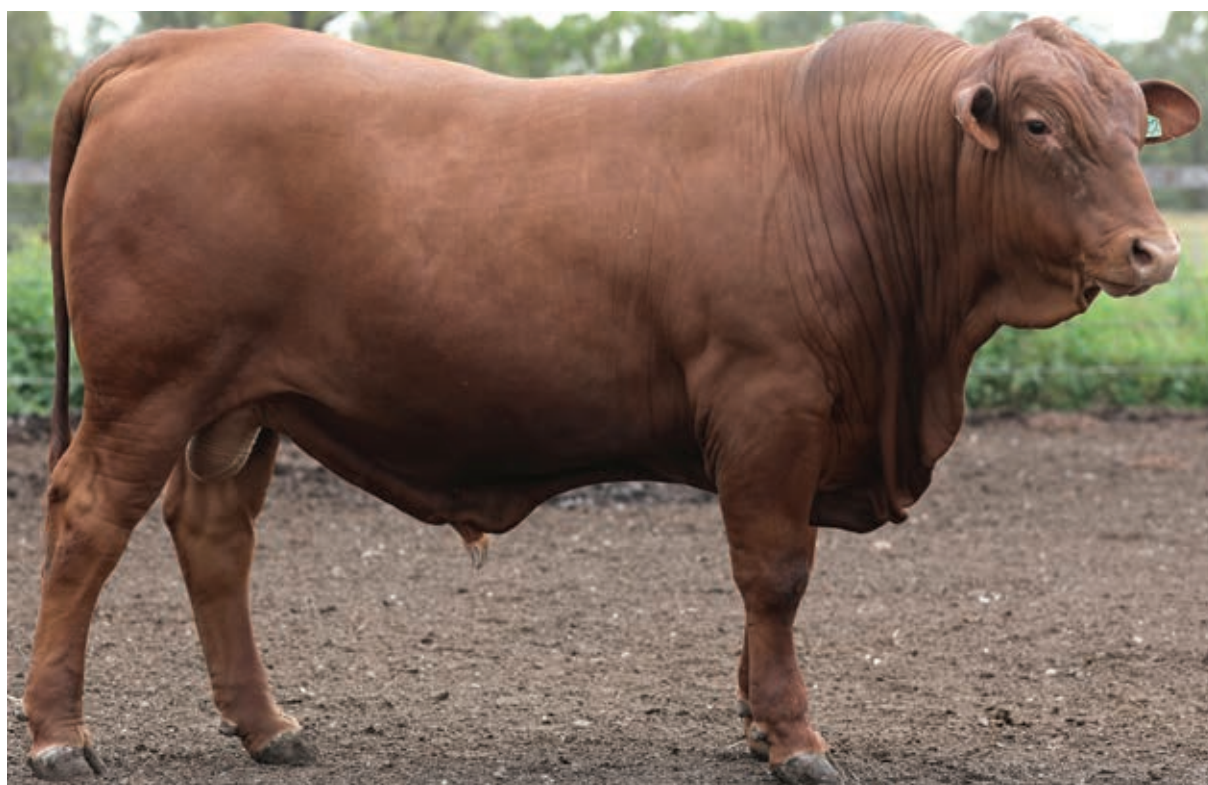
5 STAR 211222

Top 10% for weaning weight EBV. Out of a fertile 1st calf heifer, calving down at 2 years and in calf again.