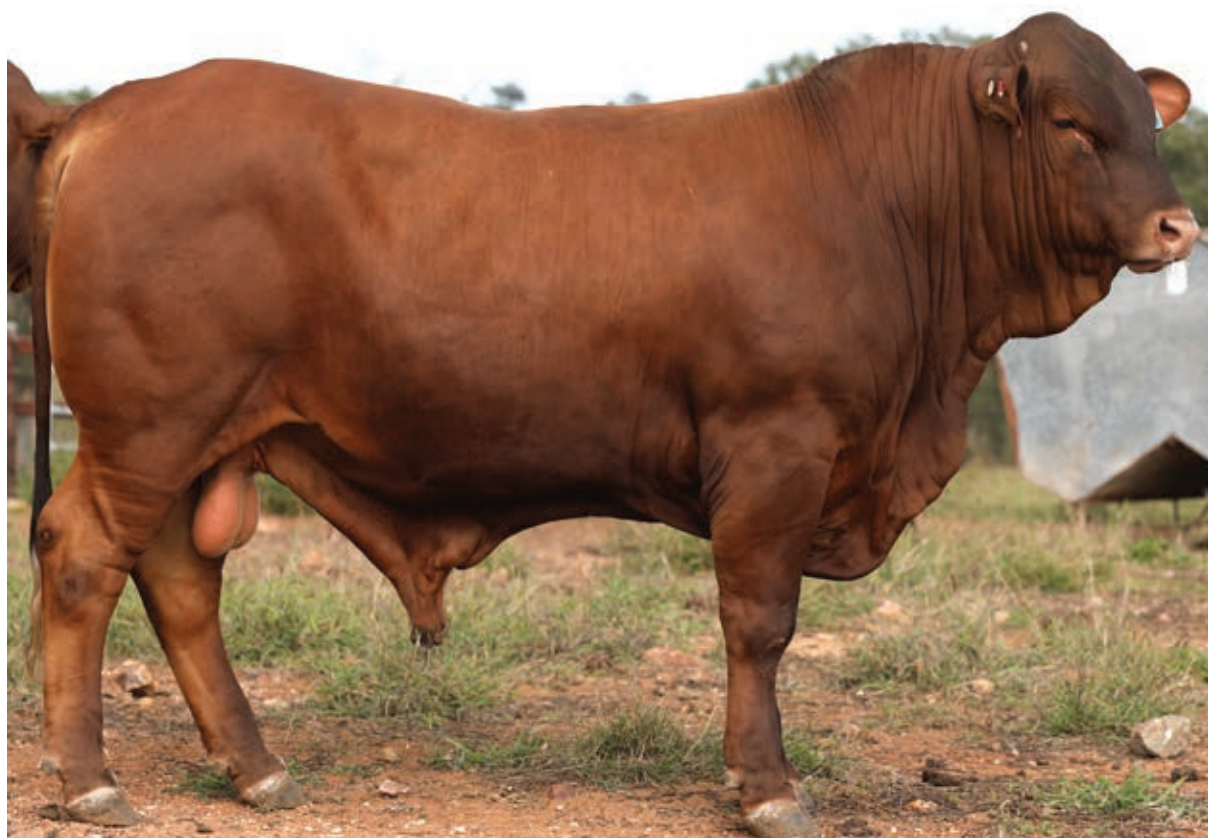
5 STAR 210655

Top 15% for re-breeding. Top 15% for 600 day growth. Top 10% for 400 day growth. Top 20% for 200 day growth. Packing 39cm scrotal at 20 months with 80% motility. Sire is DNA verified.