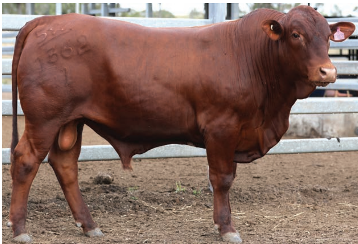
5 STAR 211362

Top 20% for 600 day growth EBV. Top 10% for yearling growth EBV. Top 25% for 200 day/wean growth EBV. 39cm scrotal with 90% motility. Sire is DNA verified.