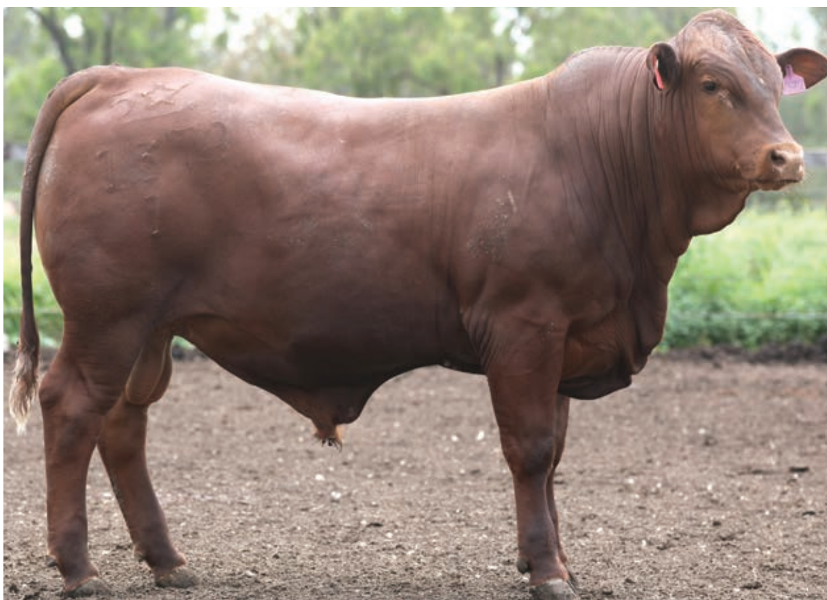
5 STAR 211372

Only a very young bull who has excelled. Complete Hazeldean genetics from the Dam line with proven longevity. Dam has had 6 calves in 6 years.