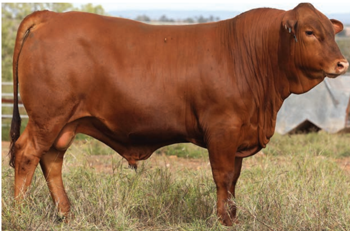
5 STAR 210882

Another 19 month old son of 13-22 with top 35% 600 day growth and top 25% 400 day groth. 39cm scrotal at 90% motlity and 80% morphology. Keen and young.