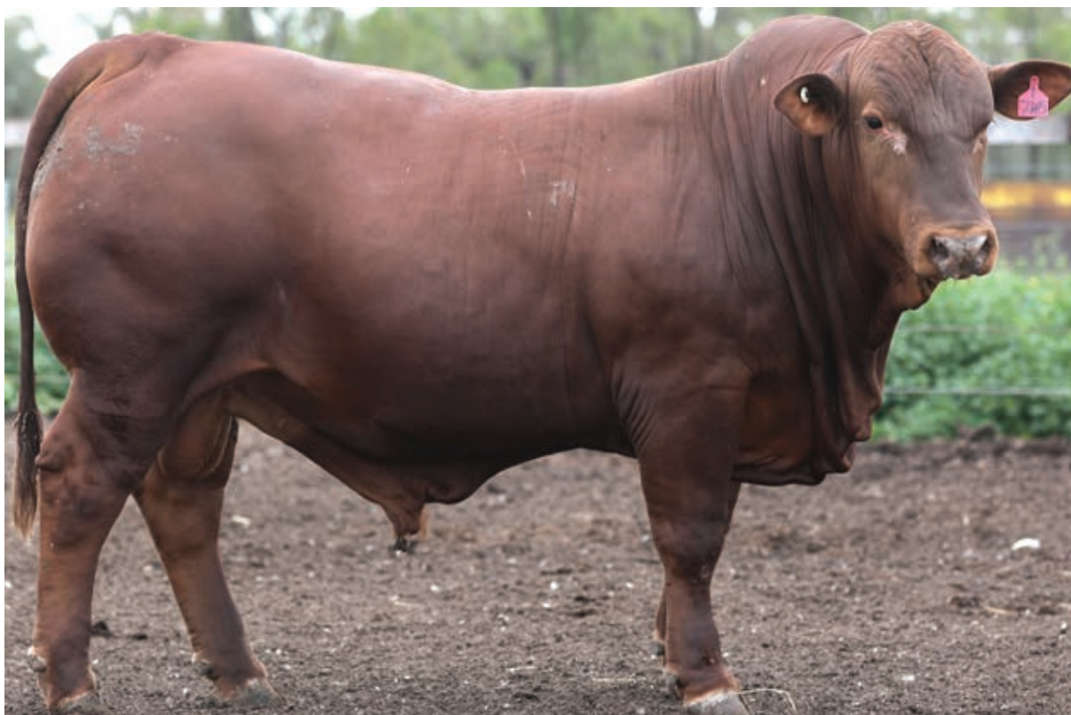
5 STAR 210745

A truly magnificent carcass bull. If you are looking for more thickness in your herd, he is hard to go past. We used him over 30 females as a yearling. Ranked 4th from 78 bulls in 60 day feed trial.