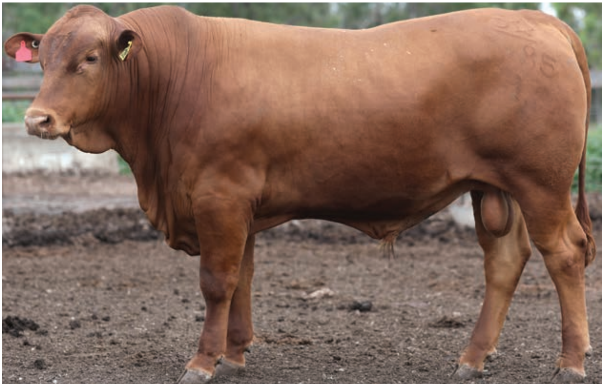
5 STAR 211285

Ranked 5th from 68 bulls in a 60 day feed test. Endorsing his genetic credentials. Sire is DNA verified.