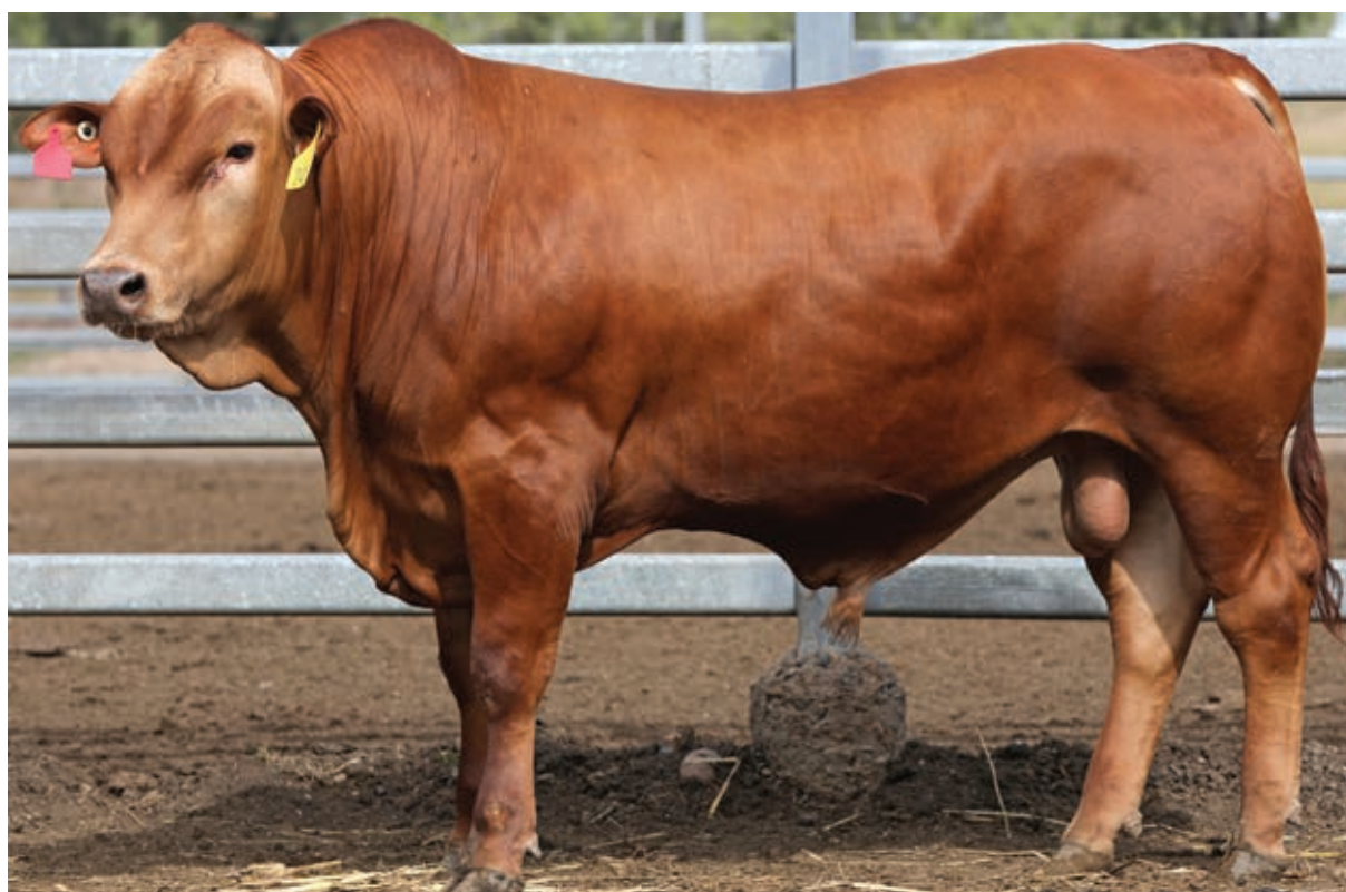
5 STAR 210242

242 is in the top 15% for 600 day growth, top 20% for 400 day growth. Has a 38cm scrotal at 20 months with 90% motility. Sire is DNA verified. Thick set young sire with good capacity through rib to rump and broad topline.