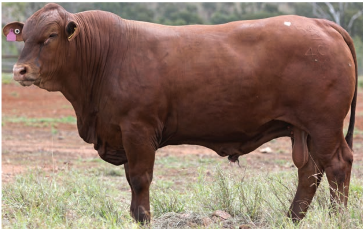
5 STAR 210040

37cm scrotal with 85% motility and 89% morphology. Eye catching son of 650, who covers all bases. Beautiful temperament. Sire DNA verified.