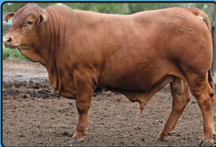
LOT 4, 5ST210745