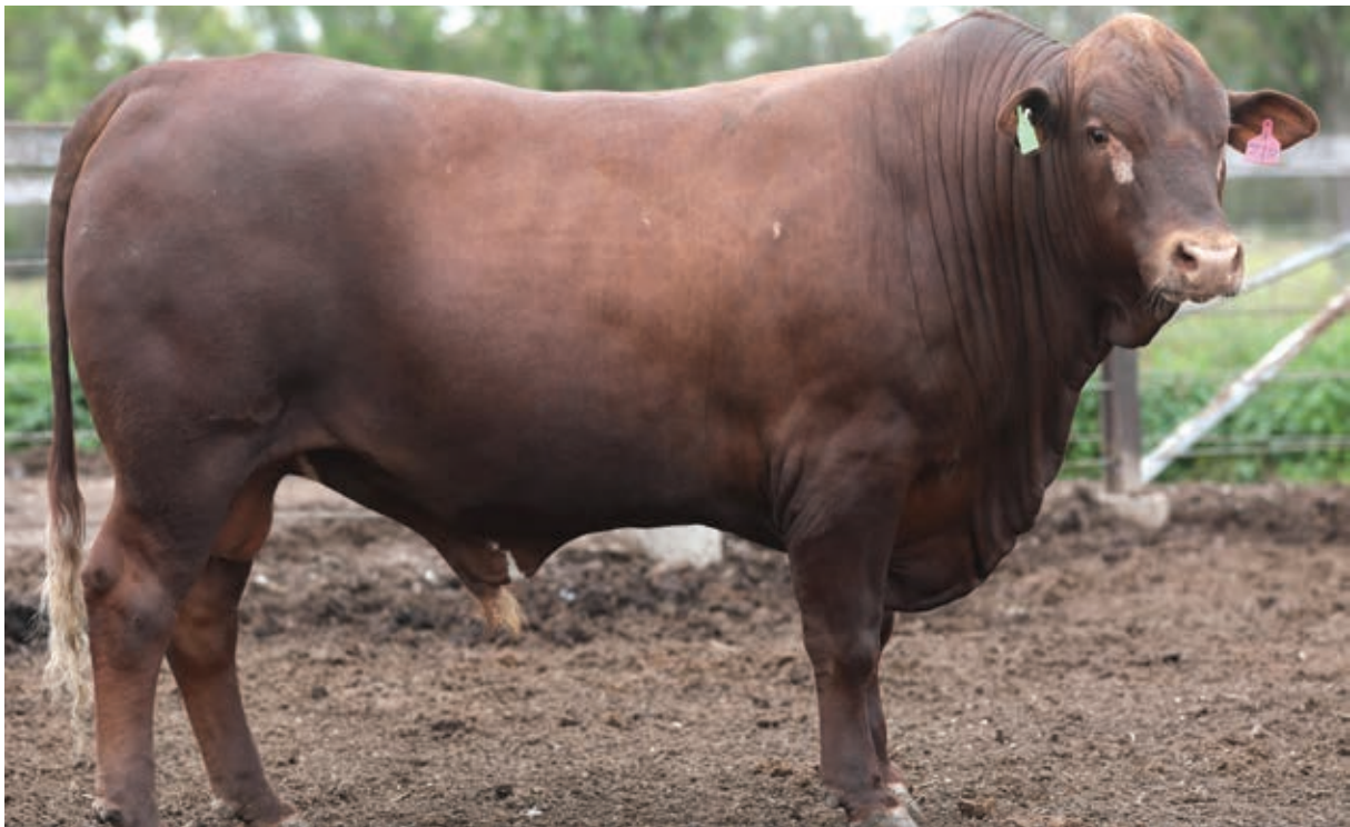
5 STAR 210714

Top 15% for 600 day growth. Top 10% for 400 day growth. 43cm scrotal with 75% motility. His da was 1 of only 10% of heifers that conceived as a yearling in the height of the worst drought in our memory 2018/2019. Sire is Herd recorded, Not DNA verified.