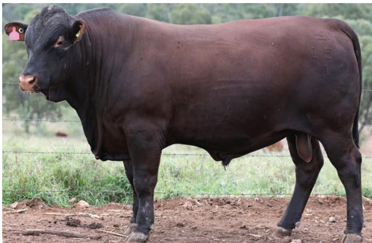
5 STAR 210015

His EBV's don't reflect the actual performance of this bull. 380kg wean weight, and was number 1 weight gain as a yearling and 600 day, on grass. Dam is expecting third calf in 3 years in October. Full bodied, big capacity sire. Sire DNA verified. 95% morphology.