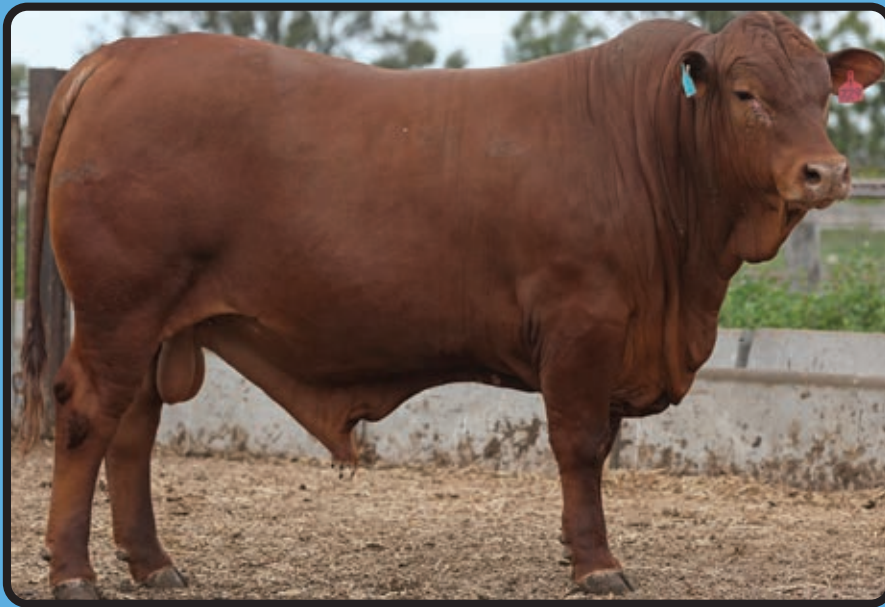
LOT 3, 5ST210729