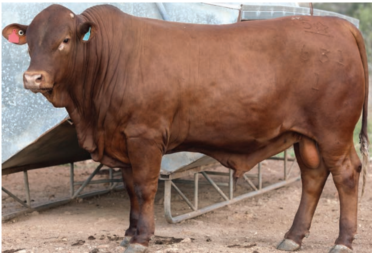
5 STAR 210631

Lower birth weight EBV with good average growth for 400 & 600 day weights. 43cm scrotal and 80% motility and top end rebreeding figures underwrites maximum calf getting ability.