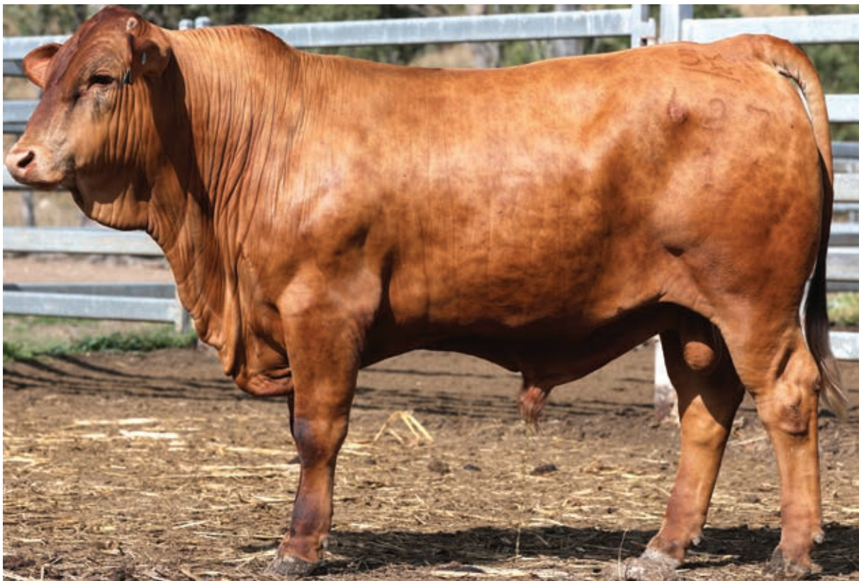
5 STAR 210627

Top 10% for 600 day growth EBV. Top 10% for 400 day growth EBV. A Lighter coloured sire with great carcass shape, fleshing and yield capacity without semen scarifying mobility. 95% motility. Sire DNA verified.