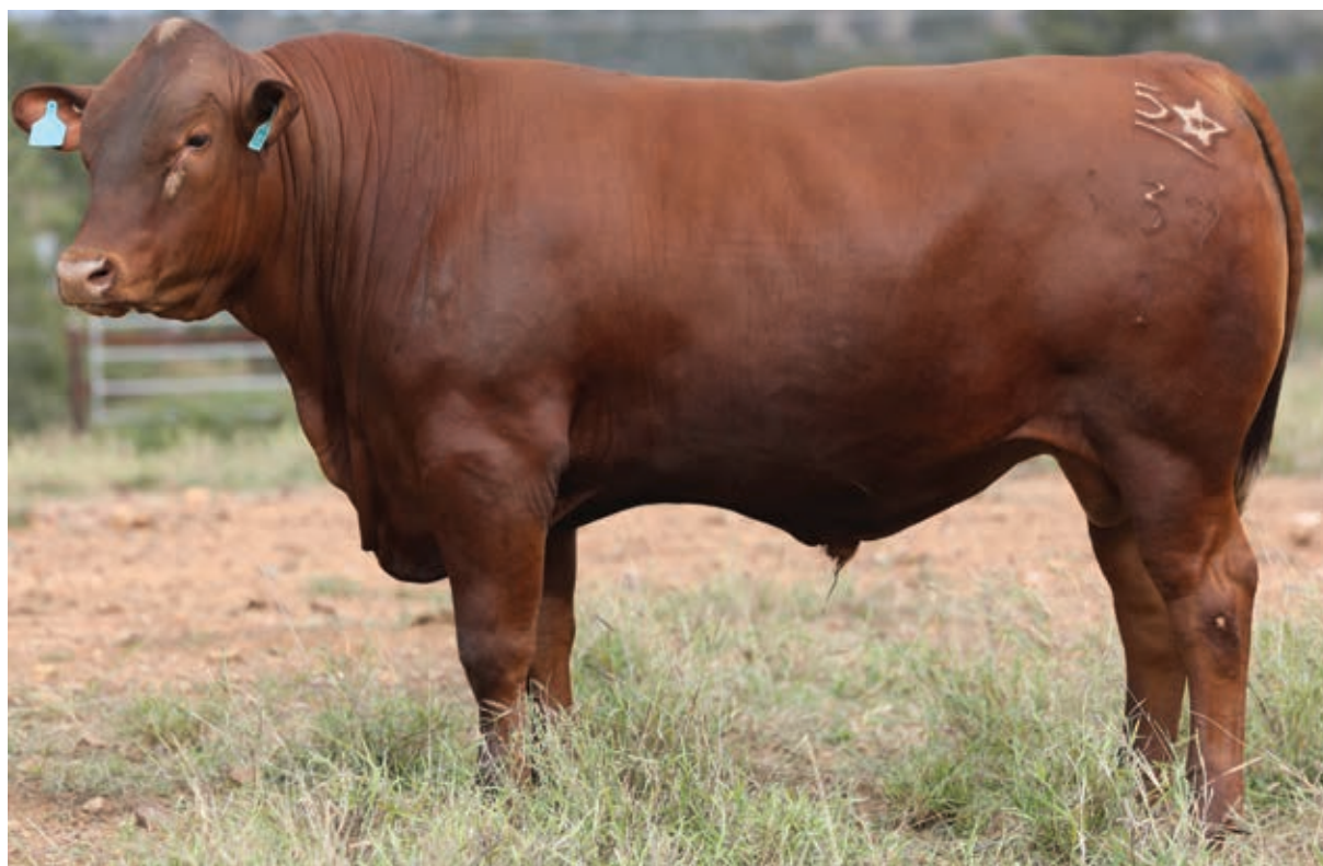
5 STAR 210637

Ranked 28th from 78 bulls in the 60 day feed trial. Sire is DNA verified.