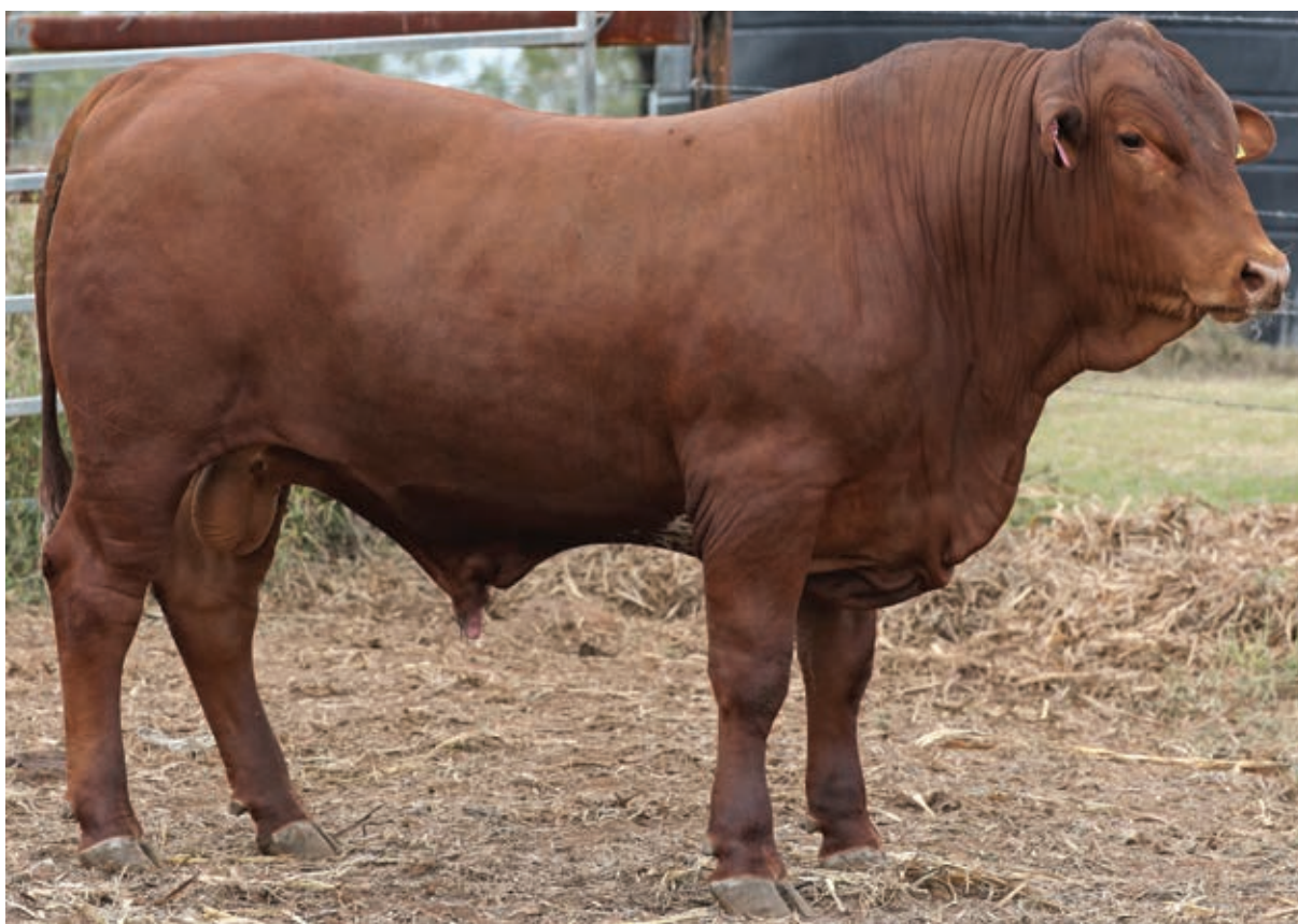
5 STAR 210042

41cm scrotal with 85% motility with 89% morphology. Tremendously high performance package with eye appeal and balance. Sire is DNA verified.