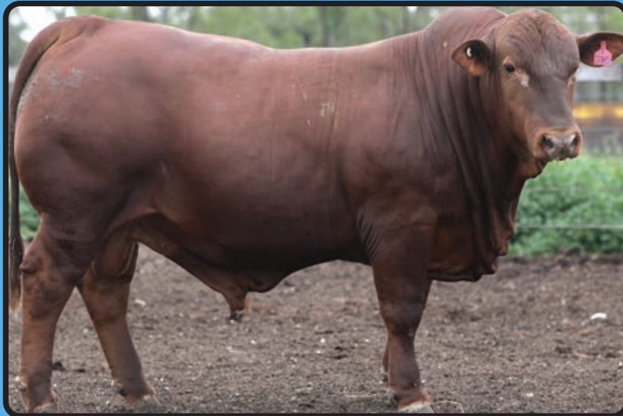
LOT 5, 5ST210745