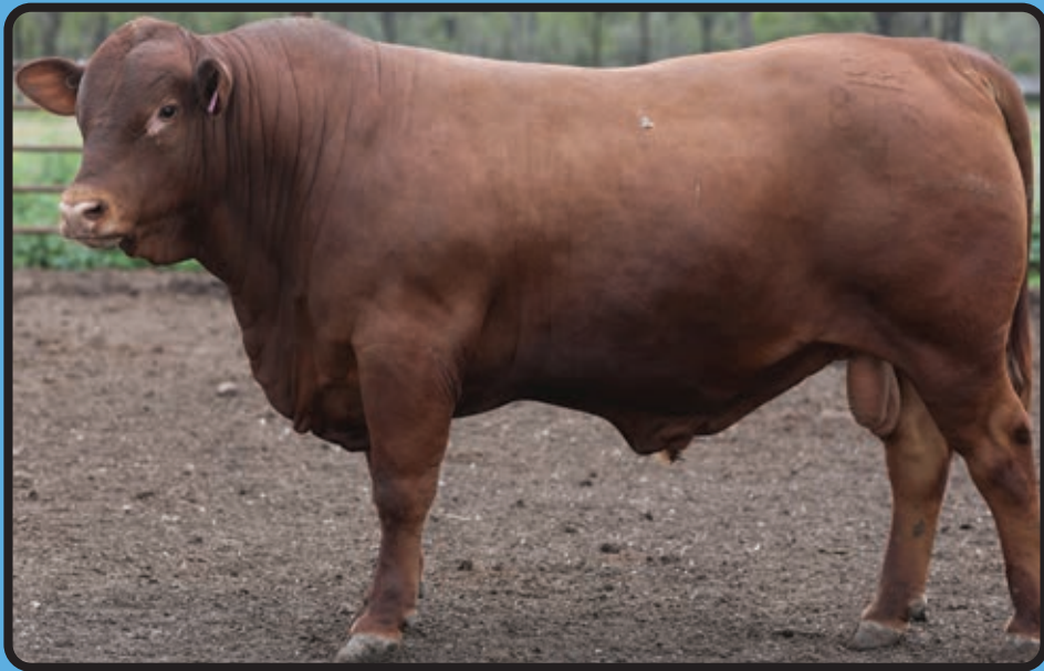
LOT 6, 5ST210815