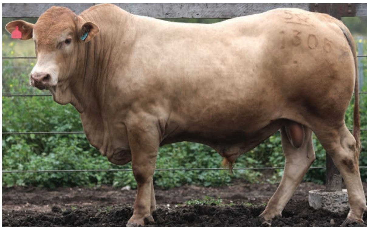
5 STAR 211305

3/4 Sen, 1/4 Char. Top 15% 600 day growth. Top 10% 400 day growth. 39cm scrotal with 70% motility. Grand old dam just culled at 14 years of age.