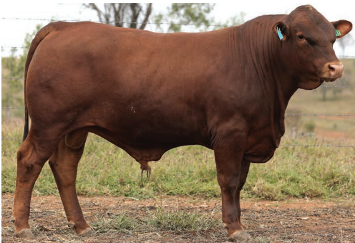
5 STAR 210881

Another younger sire by 13-22. Brilliant for rebreeding coupled with Top 10% 600 day growth, Top 5% 400 day growth, Top 5% 200 day growth. 34 cm Scrotal at 18 months of age. Sire is DNA verified.