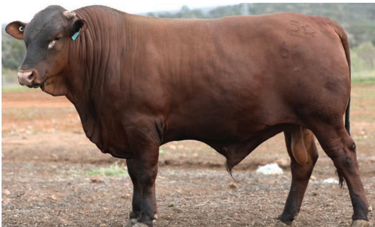
5 STAR 210620

Top 8% of Tropical breeds for re-breeding. Outstanding credentials for fatser conceptions in northern Australian environments. 40cm scrotal with 90% motility. Fertility Plus! Coupled with top 30% for 600 day growth ensures 620 is a high performance package.