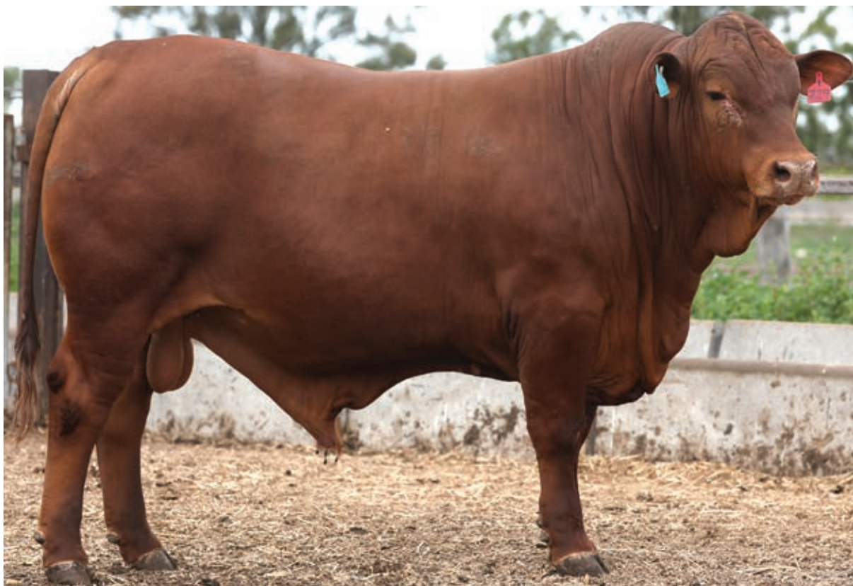
5 STAR 210729

Exceptional top 35% for weaning weight. Ranked 10th out of 68 bulls for 60 day feed trial.