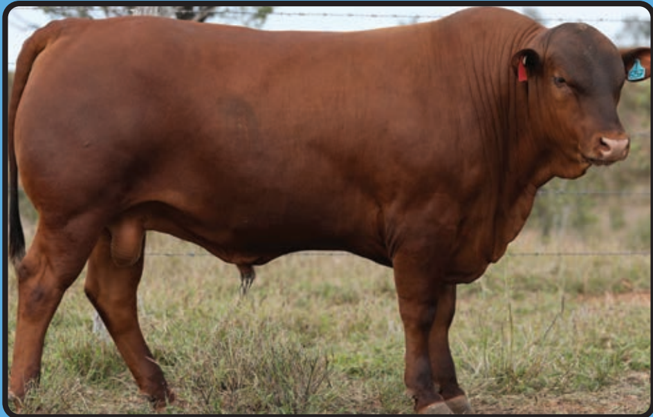
LOT 35, 5ST210657