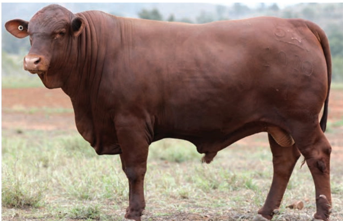
5 STAR 211010

Low birth wt EBV, AMD Grand Sire on the Dam Line, is 13-22. Not a surprise, to see 1010, was sired by a Yearling Bull out of a yearling conceived Dam! 38cm Scrotal, with 95% Motility with 87% Morphology.