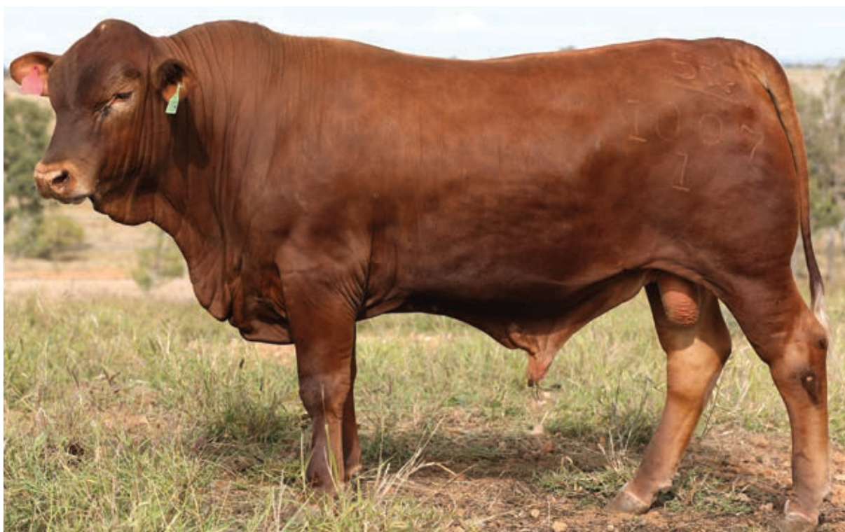
5 STAR 211007

Moderate growth Sire with smaller birth weight EBV. 38cm scrotal with 70% motility. Clean coated sire, very good temperament, Dam is due to calve with 3rd calf in 3 years in November.