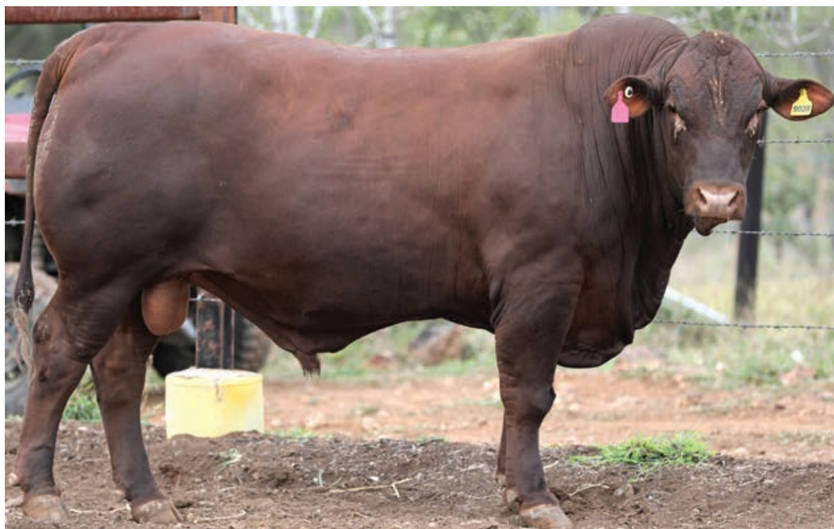
5 STAR 210028

40cm scrotal with 90% motility and 84% morphology. Anyone can buy with confidence with consistent performance data across the board. Sire is paddock recorded.