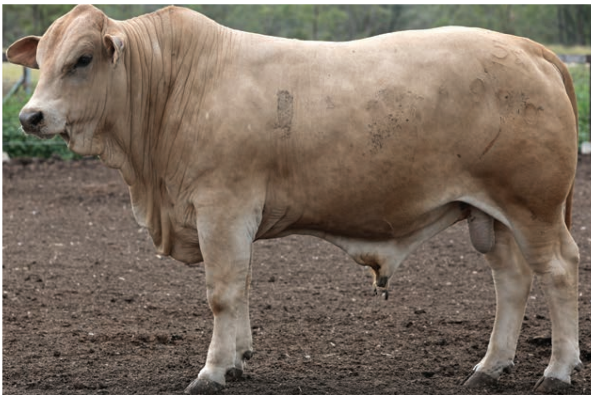
5 STAR 210900

One of my favourites. The G.B.V information has not returned in time for the catalogue print. But 900 is an impressive carcass bull. Not only does he display good muscle pattern but he has good finish or good even fast cover the rib to the rump. I think a lot of this bull.