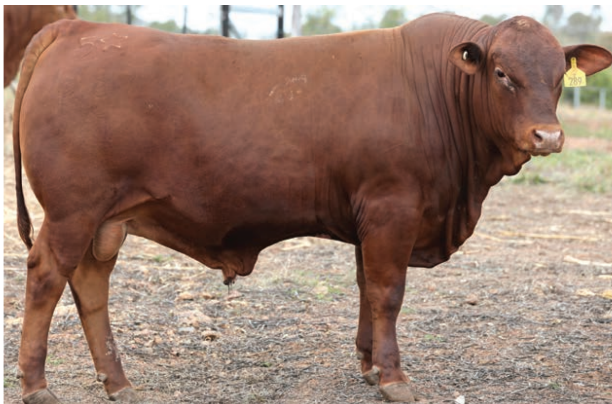
5 STAR 210289

Top 10% for 600 day growth. Top 5% for 200 day growth. Top 10% for 400 day growth. 38cm scrotal at 18 months.