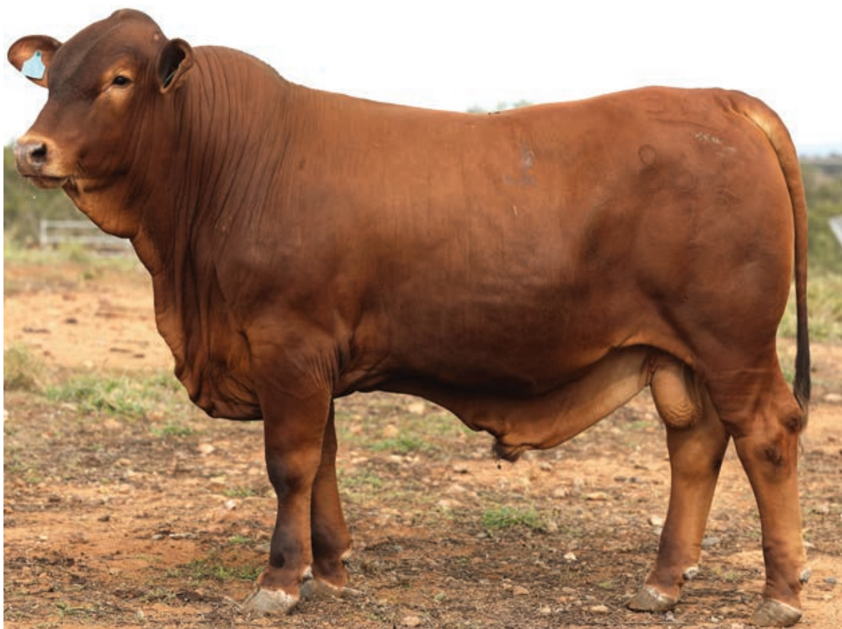
5 STAR 210864

Top 15% for 400 day weight. Top 10% for 200 day weight. Top 25% for 600 day weight. Sire is DNA verified.