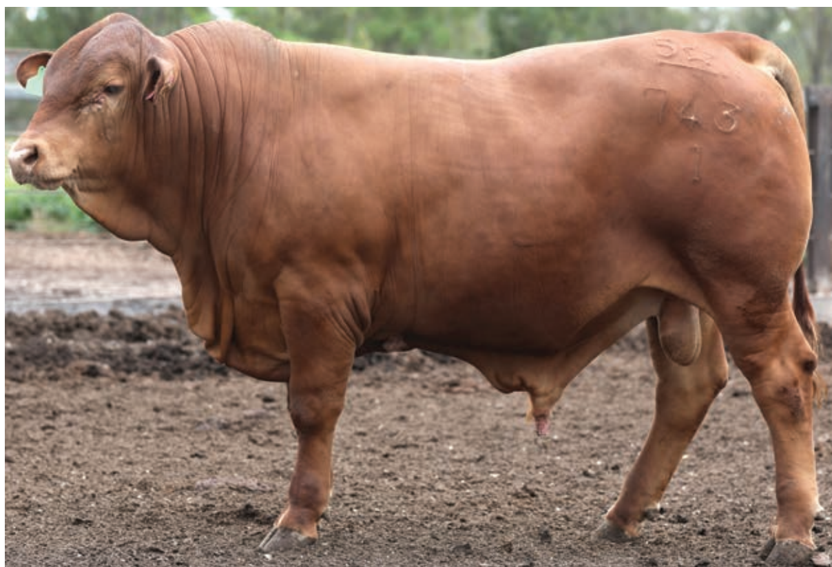
5 STAR 210743

40cm Scrotal and ranked equal 4th from 78 bulls on the 60 day feed trial. Sire recorded. Not DNA verified.