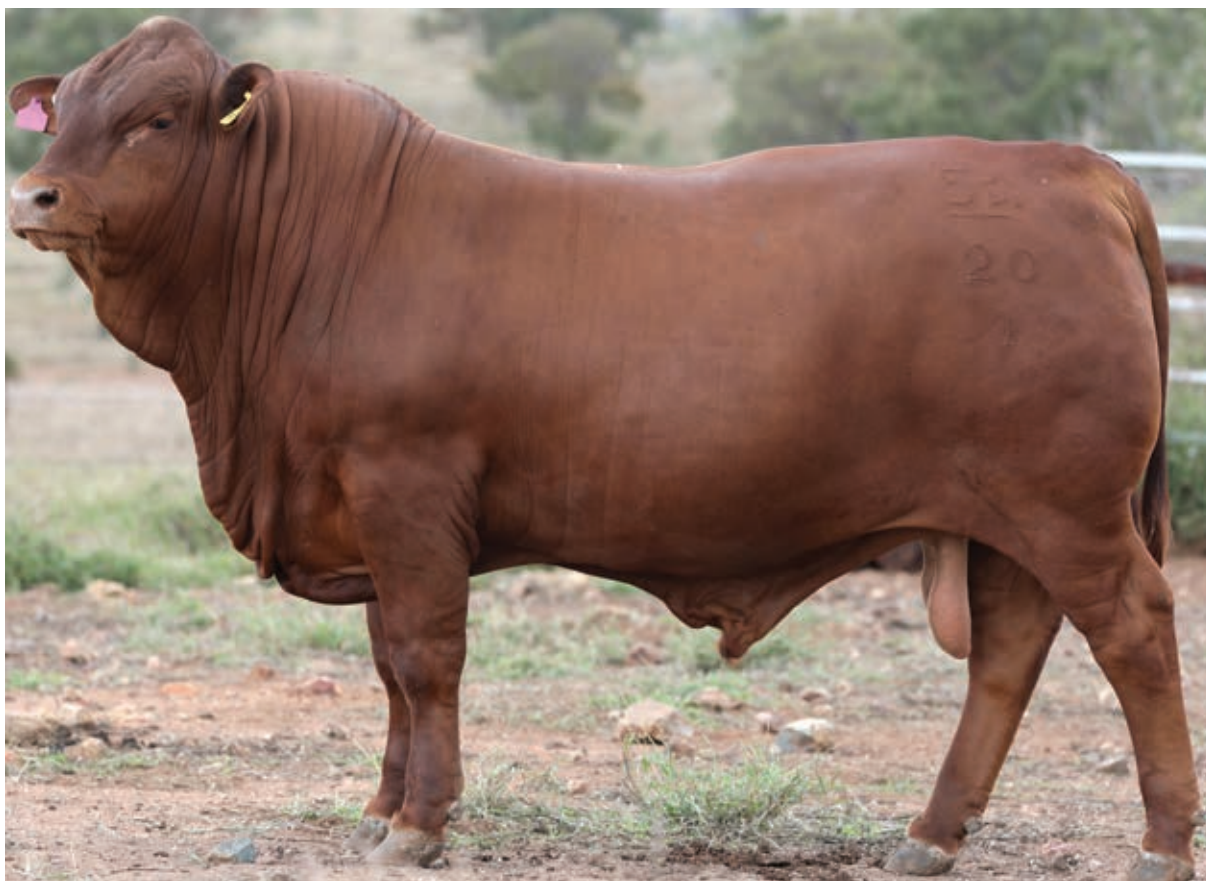
5 STAR 210020

Top 15% for 600 day growth EBV. Top 10% for 200 day wean EBV. 75% motility with 78% morphology. Good capacity young sire with high yielding muscle pattern with good finishing ability. Top 9% rebreed in a yield sire is not always easy to identify. Sire is DNA verified.