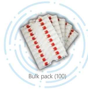
Bulk pack (100)

Questions? 1300 138 247 or contact@allflex.com.au