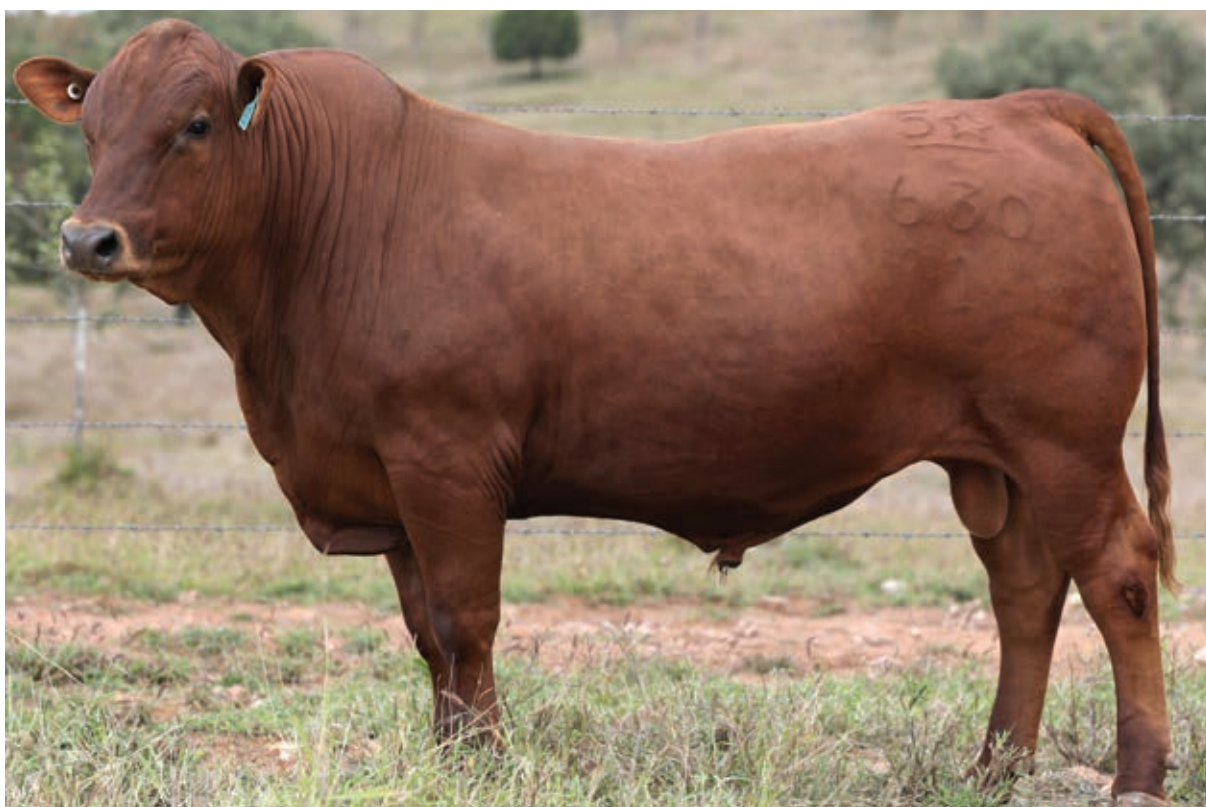
5 STAR 210630

Top 10% for 400 growth. Top 5% for 200 day growth. Top 15% for 600 day growth. DNA sire verified.