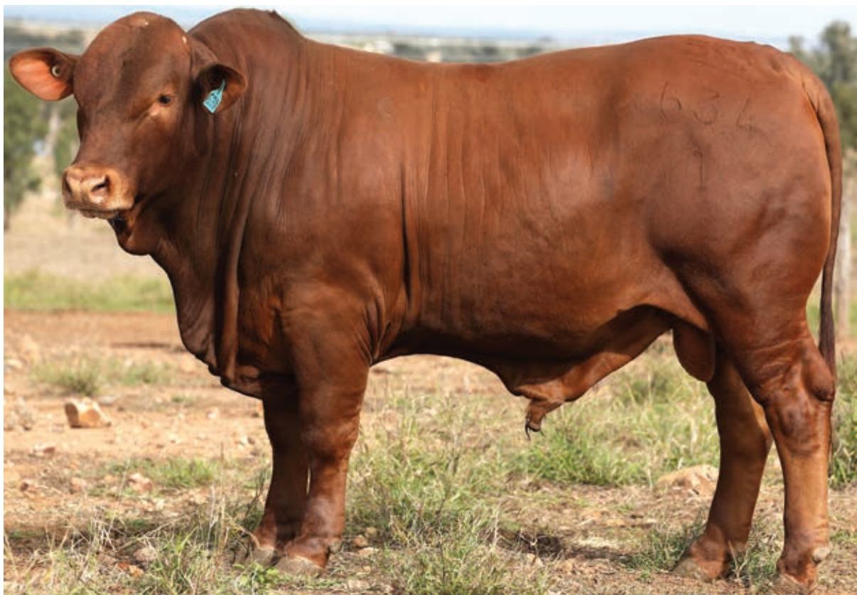
5 STAR 210634

40cm scrotal, this youngster displays what 5 generations of selection can offer.