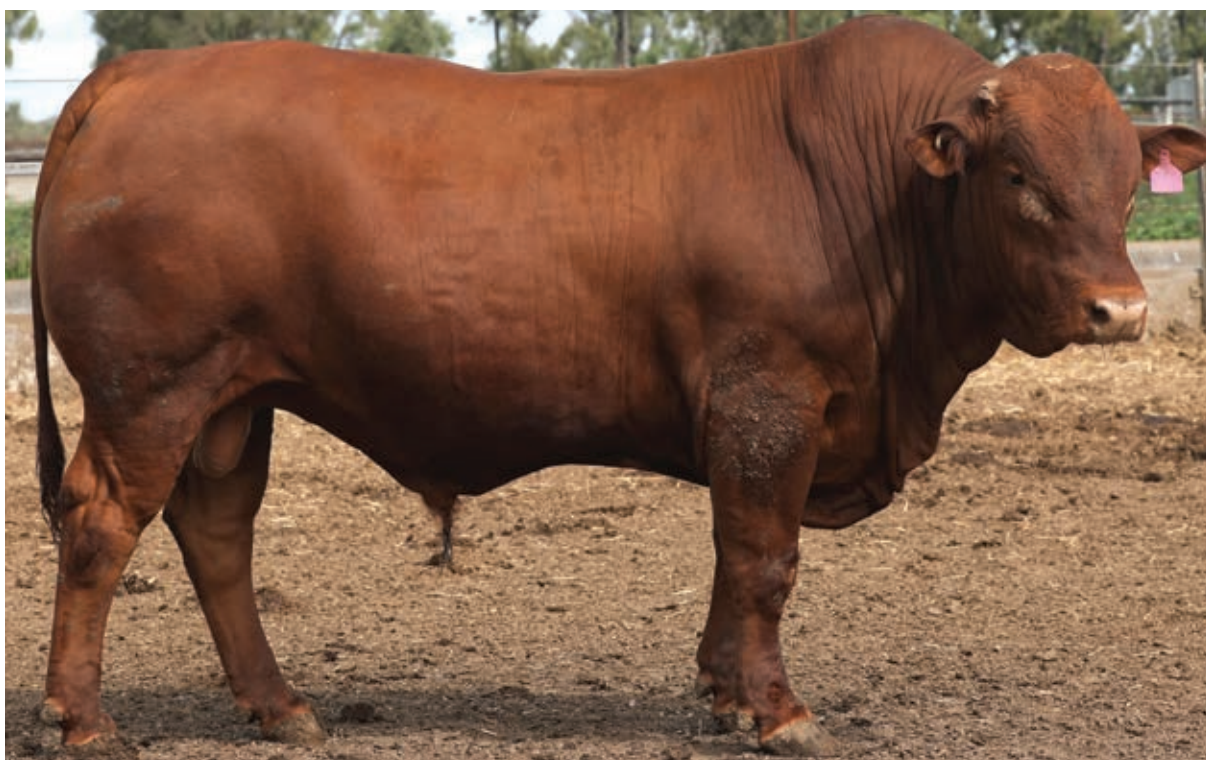
5 STAR 210809

Very thick set stairmaster son showing the high yielding traits he is reknown for. top 25% for 600 day wt EBV.