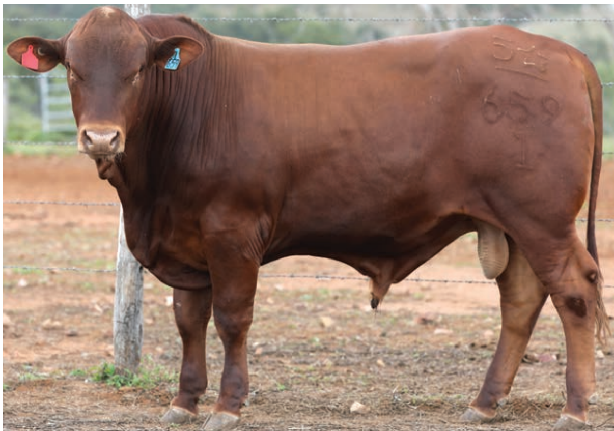
5 STAR 210659

Top 20% for 600 day growth. Top 20% for 400 day growth. Top 15% for 200 day growth. 38cm scrotal with 90% motility and 81% morphology. Sire is DNA verified.