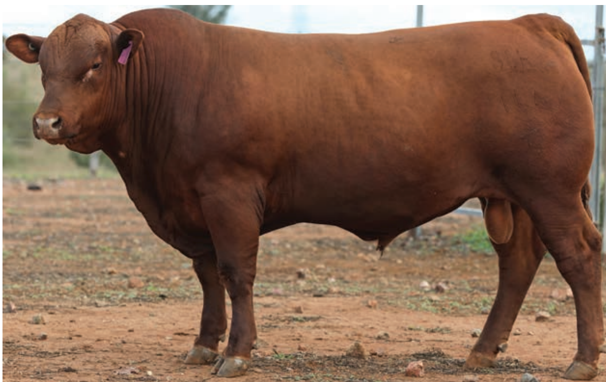
5 STAR 210114

This bulls actual performance has been outstanding. Ranked 1st in the 60 day feed trial from 54 other bulls. His weight gain was 15% ahead of the 2nd p;aced bull and 55% of the average of his group. 38cm scrotal, 75% motility and 91% morphology.