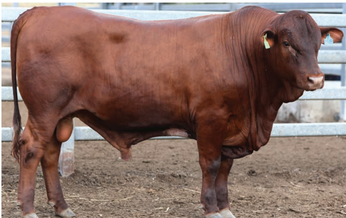
5 STAR 211318

Top 10% for weaning wt EBV. Top 35% for yearling/400 day EBV. 40cm scrotal with 75% motility. Dam has had 4 calves in 4 years. Sire is DNA verified.