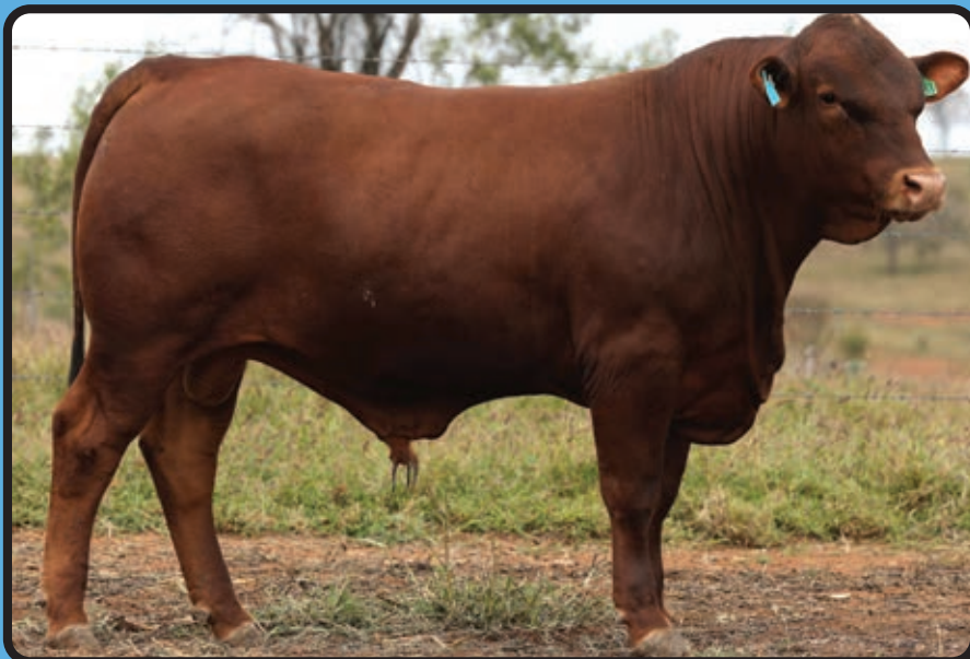
LOT 59, 5ST210881