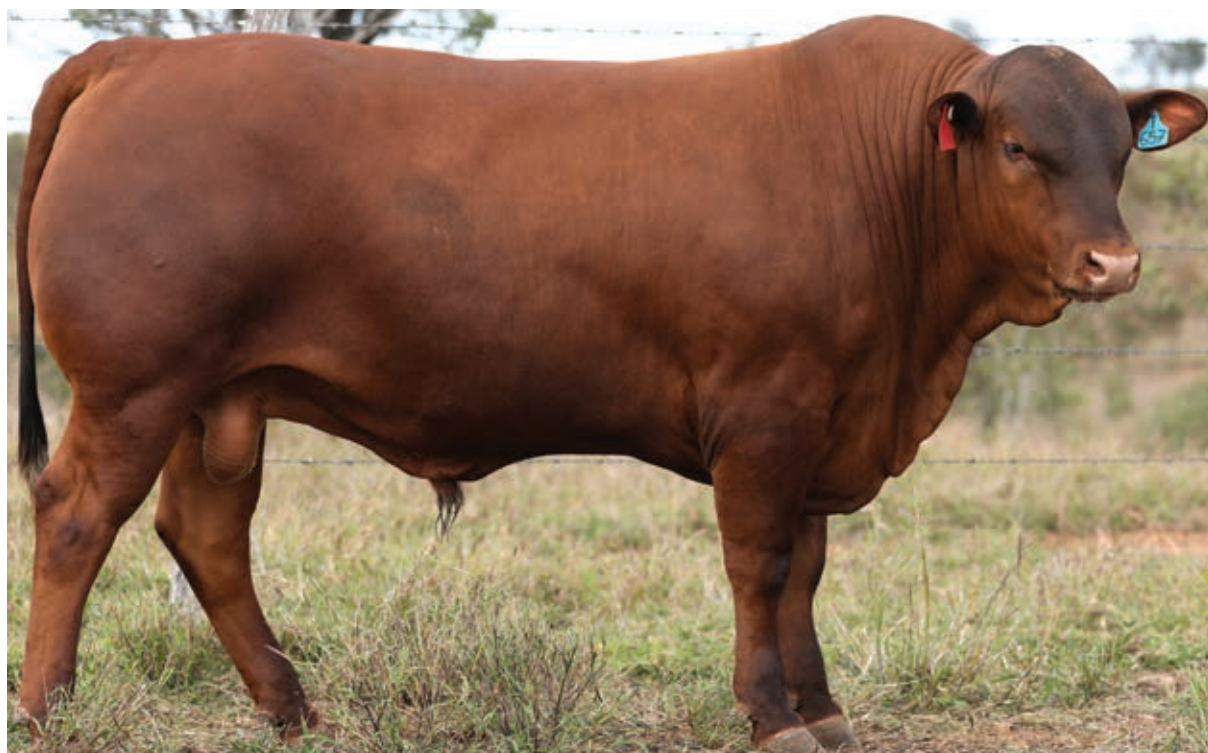
5 STAR 210657

Another example for the "Pea in a Pod" trait of 5 Star 130022. Sire is DNA verified.