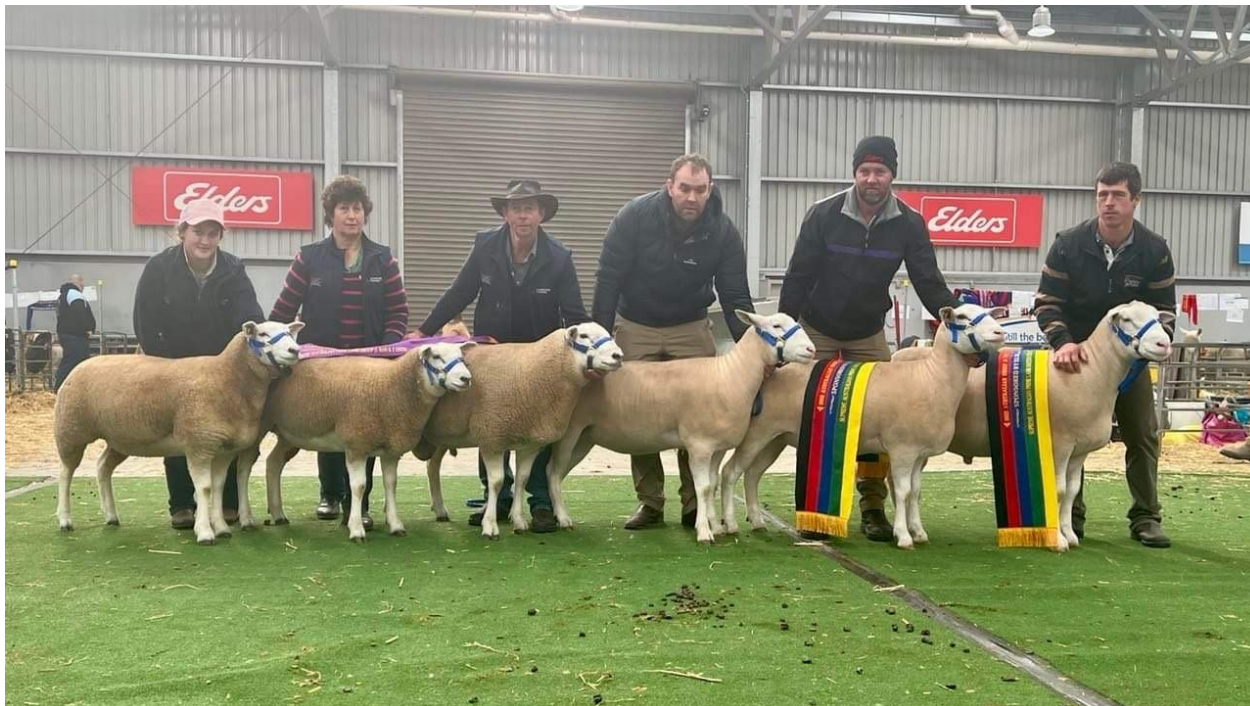
Supreme Interbreed Prime Lamb Group - Australian Sheep & Wool Show 1st White Suffolk Group, 2nd Texel Group Supreme Interbreed Prime Lamb Exhibit - Australian Sheep & Wool Show 1st White Suffolk Ram, 2nd White Suffolk Ewe