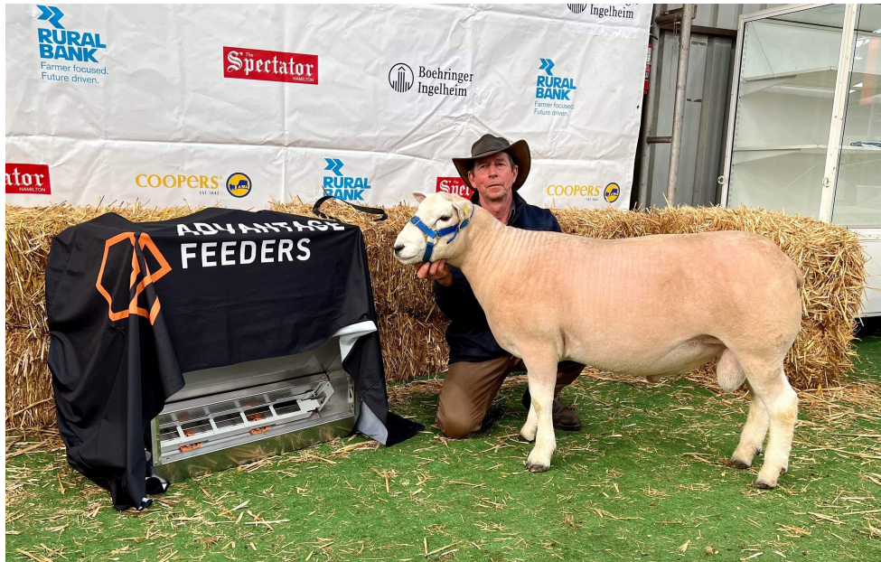
Supreme Texel Exhibit - Hamilton Sheepvention & Royal Adelaide Show Mertex 210039