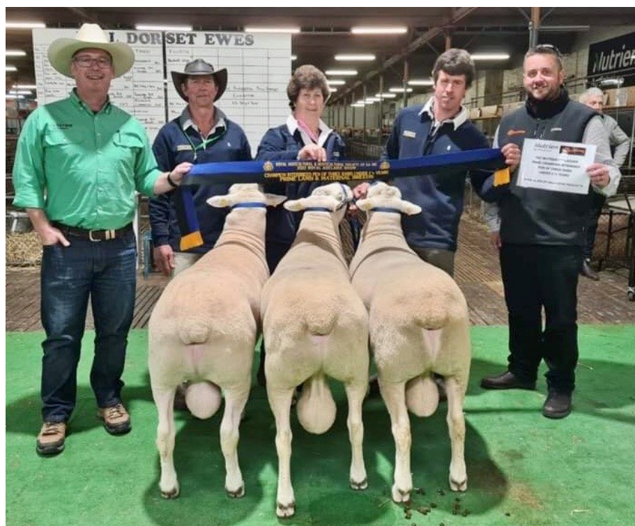
Supreme Interbreed Pen of 3 Rams - Royal Adelaide Show L-R Mertex 210652, 210326, 210281