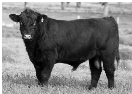
TURANVILLE CRUSHER P198

Lots 1, 2, 3, 6, 7, 8, 11, 12, 15, 19, 20, 26, 28, 31, 33 and 34