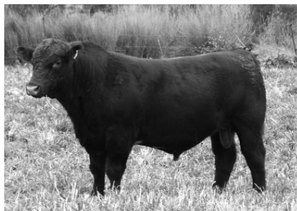
TURANVILLE BONECRUSHER H102