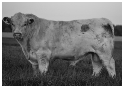
THE GROVE TERABYTES N0615

Lots 1, 2, 3, 6, 7, 8, 11, 12, 15, 19, 20, 26, 28, 31, 33 and 34