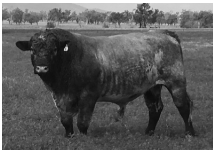
TURANVILLE SENATOR L006