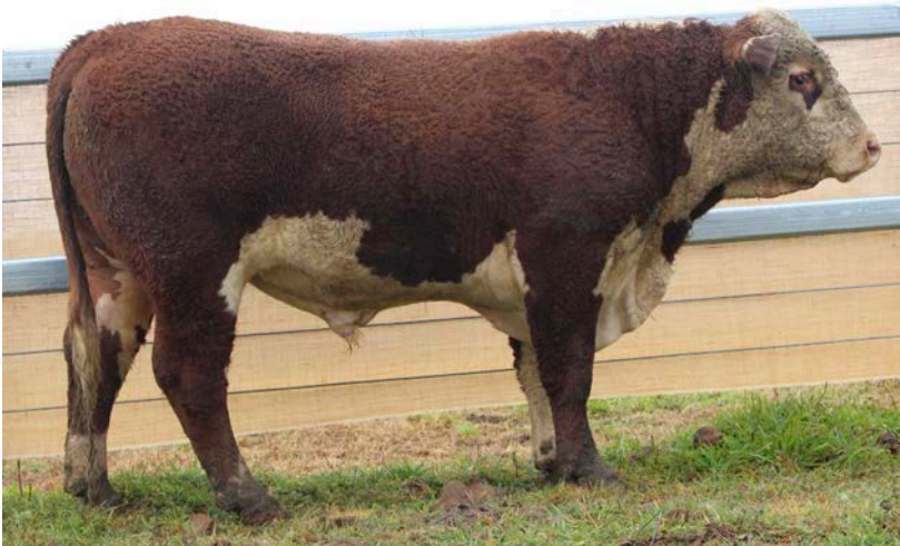
Lot 17. Te-Angie Raspberry RGOR036