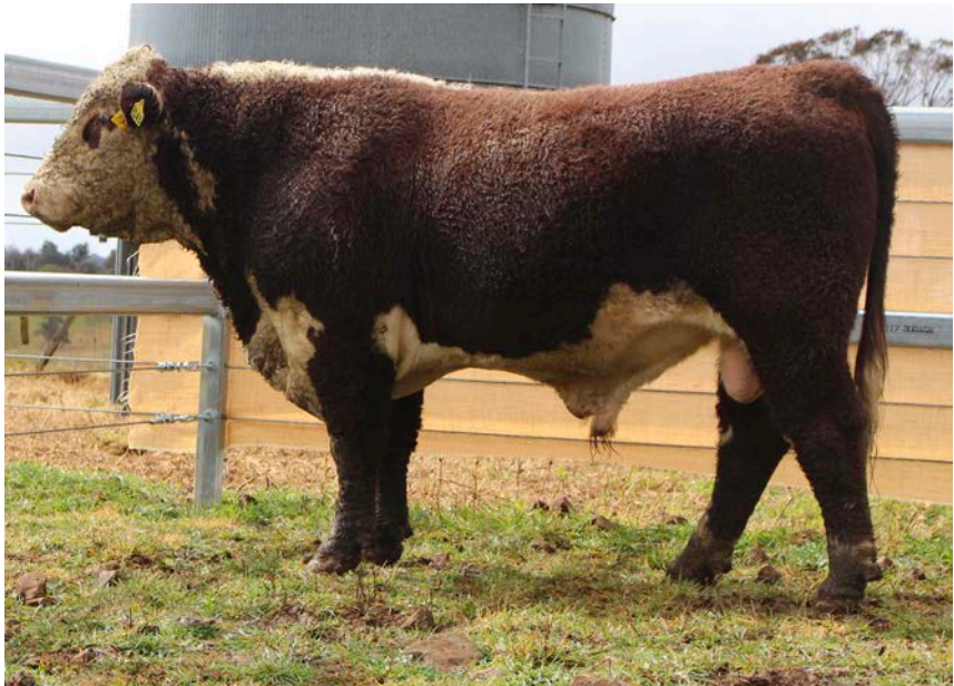
Lot 3. Te-Angie Rambler RGOR145