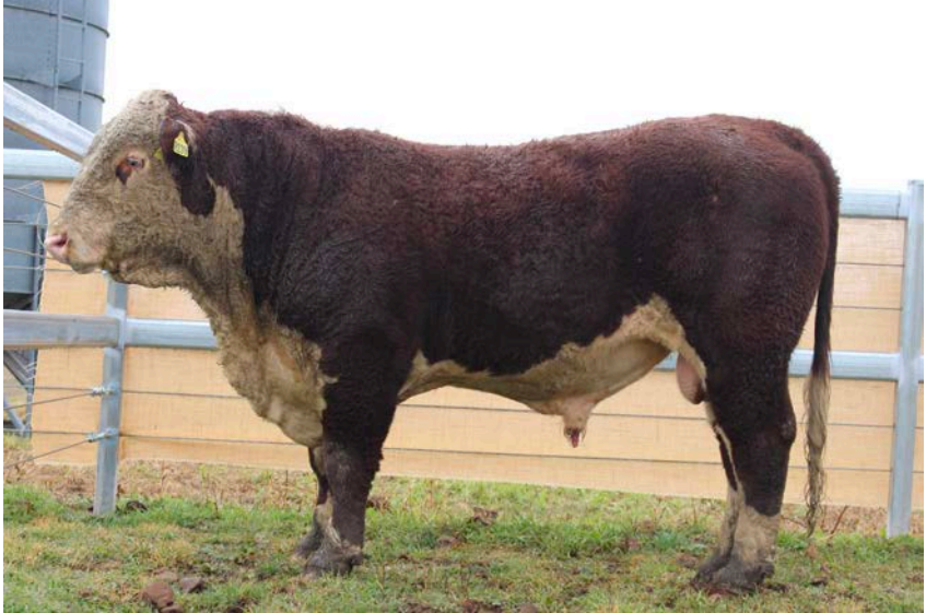
Lot 1. Te-Angie Rampage RGOR139