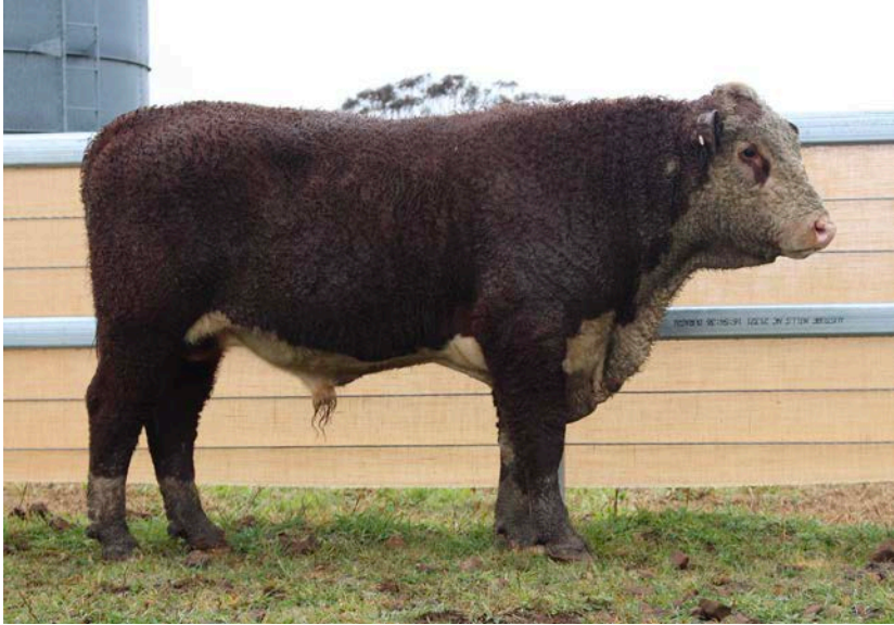
Lot 9. Te-Angie Recess RGOR114