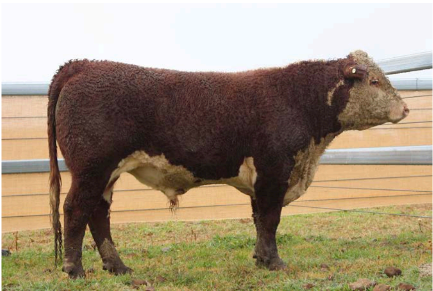
Lot 8. Te-Angie Rocket RGOR079