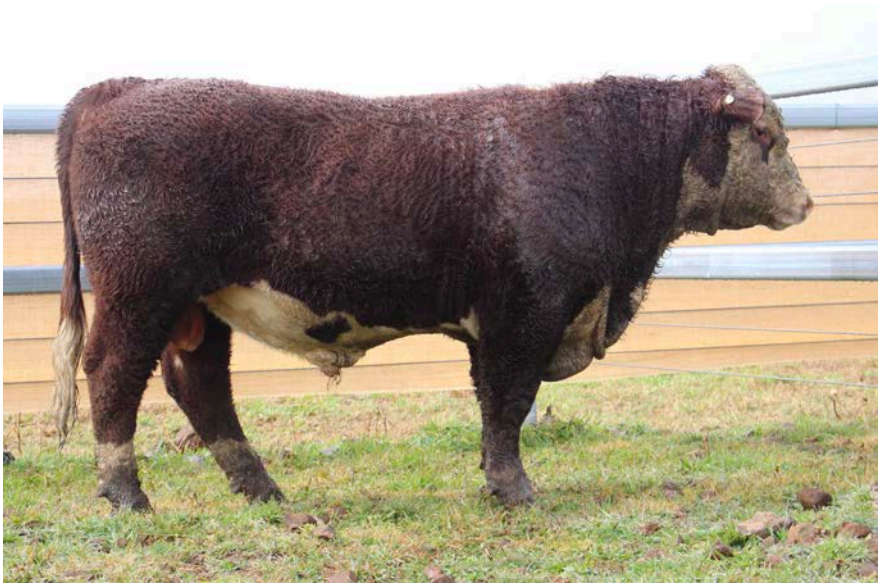
Lot 7. Te-Angie Repeat RGOR083