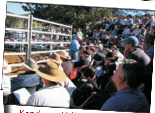
Kandanga Valley Sale Crowd

We are now running in excess of 1200 registered stud cattle, down from a peak of around 1700. We have put a big emphasis on fertility and productivity over the last few years as we have wound our herd back to a more manageable level.