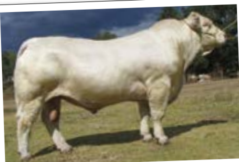
MORGIANA HOUSE WEST AVEYRON