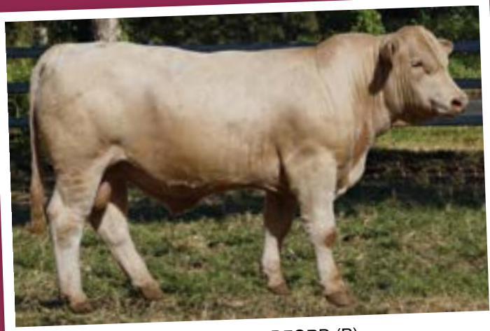
LOT 1 - KANDANGA VALLEY REDFORD (P)