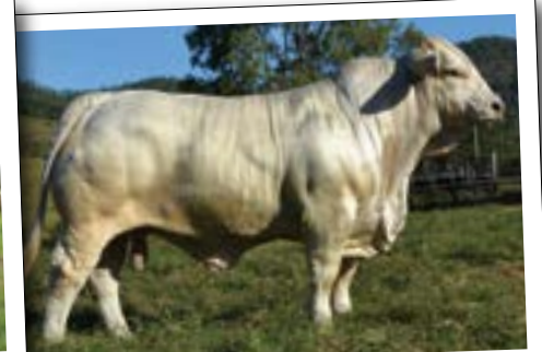
KANDANGA VALLEY MADDOX