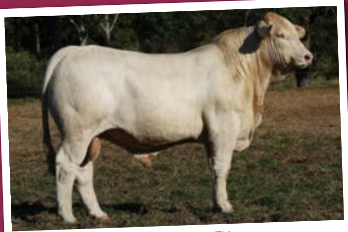
LOT 55 - KANDANGA VALLEY RODNEY