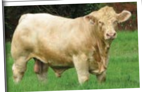
KANDANGA VALLEY CHABLIS (P)