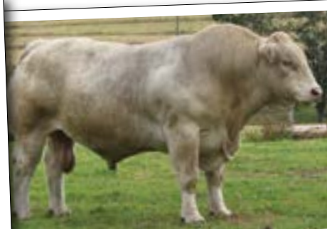
KANDANGA VALLEY ALEXANDER