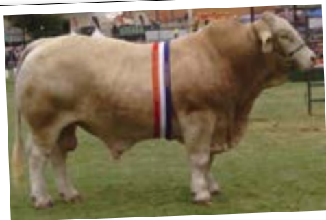
KANDANGA VALLEY JESUIT