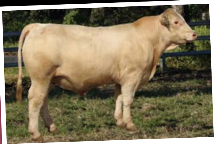
LOT 2 - KANDANGA VALLEY ROGAN (P)