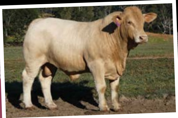
LOT 58 - KANDANGA VALLEY RIONE