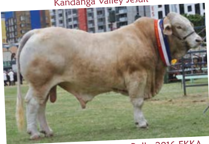
Kandanga Valley Jesuit