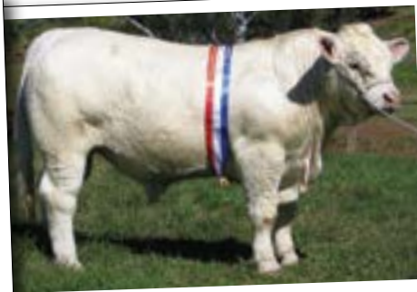
KANDANGA VALLEY YAHOO