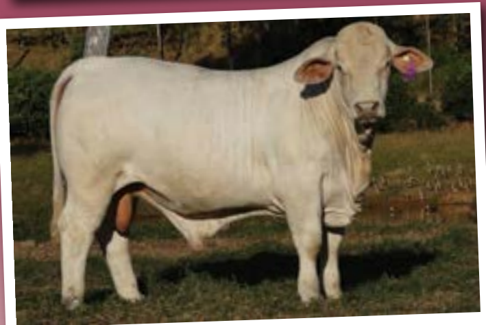
LOT 64 - KANDANGA VALLEY RODRIGO (SC)