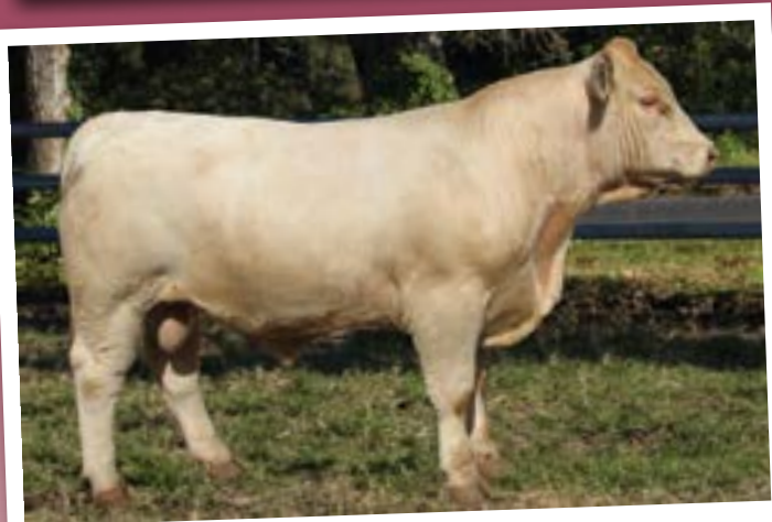
LOT 4 - KANDANGA VALLEY RICHMOND