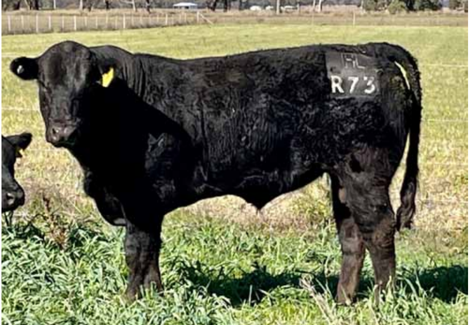
LOT 26 HARLEES RUGER (HP*) (HB*) (PN) (AA)