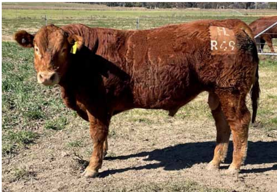
LOT 17 HARLEES RUSTY (P) (PN) (AA)