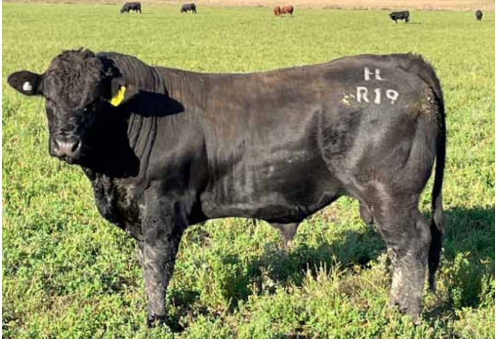
LOT 6 HARLEES FICTION R19 (P) (HB*) (PN) (AA)

FictionR19 is out of a Manali Fiction cow, this bull has a larger frame with the muscle from his sire and milk from his dam. A bull that has a larger frame and will suit many markets.