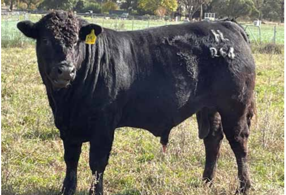
LOT 24 HARLEES ROSCO (HP*) (HB*) (PN) (AA)