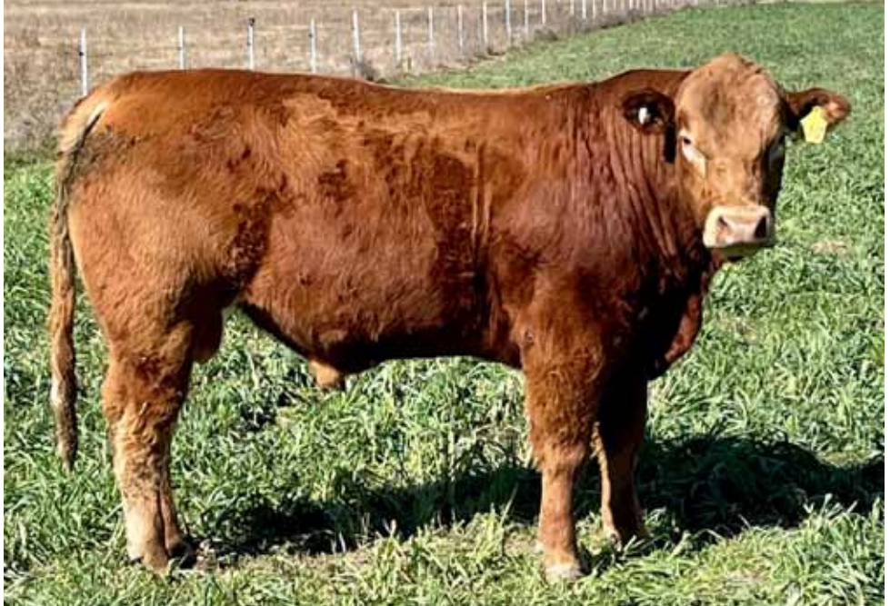
LOT 4 HARLEES RIDDICK (HP*) (PN) (AA)