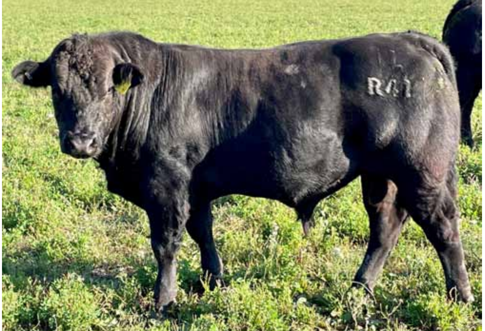
LOT 14 HARLEES ROCK (HP*) (B) (PN) (AA)