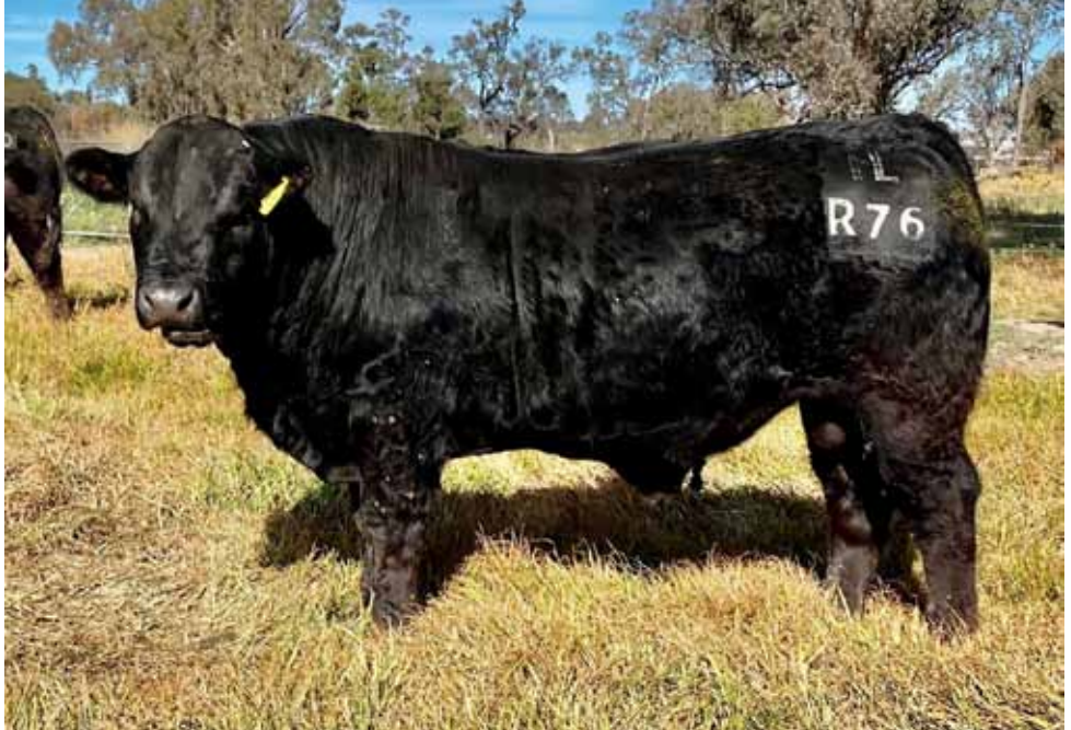
LOT 29 HARLEES RYAN (P) (B) (PN) (AA)