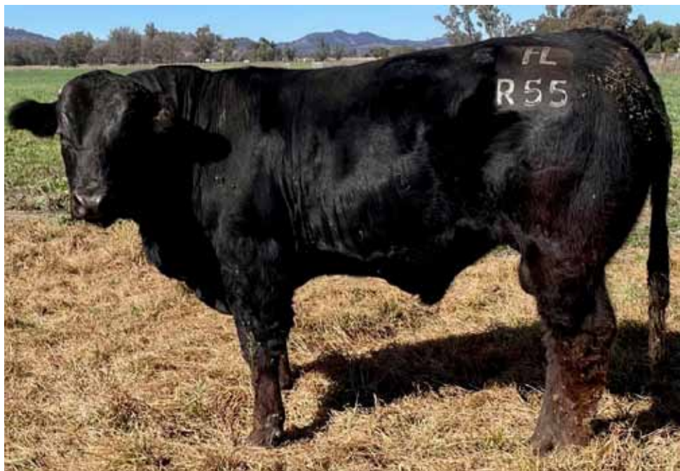
LOT 19 HARLEES REGAL (P) (B) (PC) (AA)