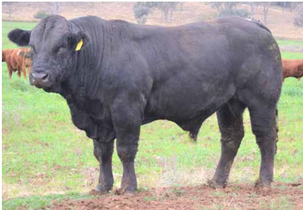
LOT 1 HARLEES RED ROCK R1 (HP*) (B) (PN) (AA)