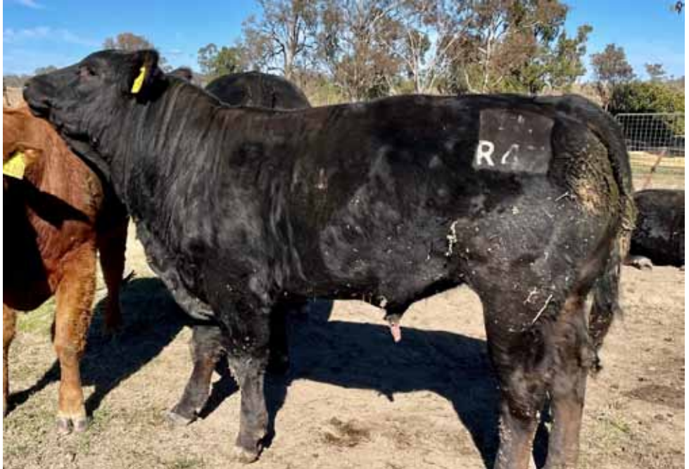
LOT 16 HARLEES RUDY (HP*) (B) (PN) (AA)