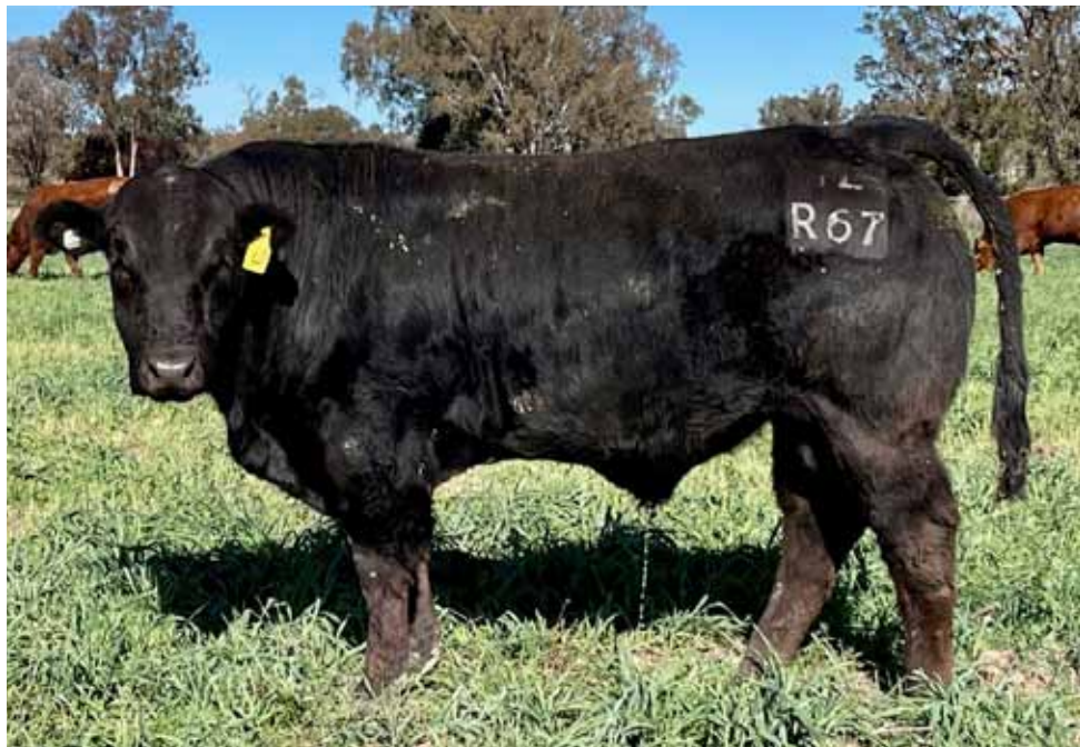
LOT 25 HARLEES RHINO (HP*) (B) (PN) (AA)