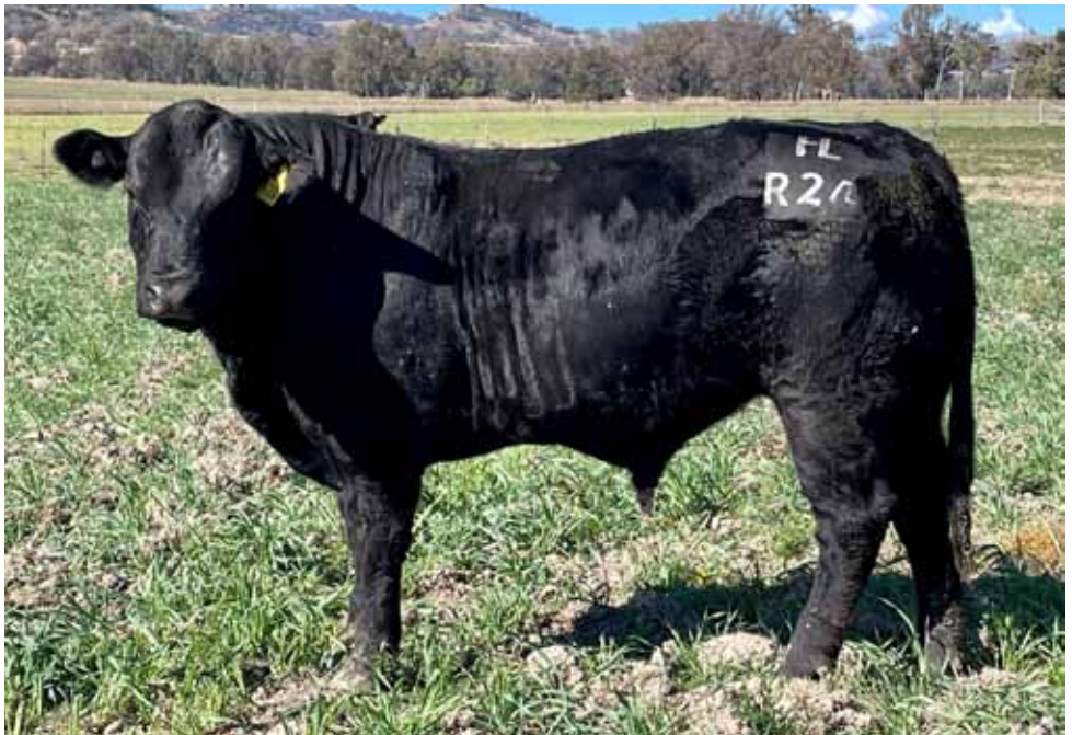
LOT 8 HARLEES ROBSHEAFFE (HP*) (HB*) (PN) (AA)