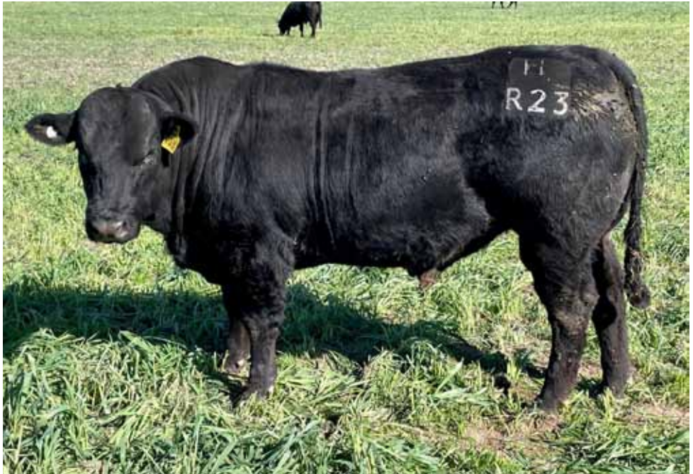
LOT 7 HARLEES RIC (P) (B) (PN) (AA)