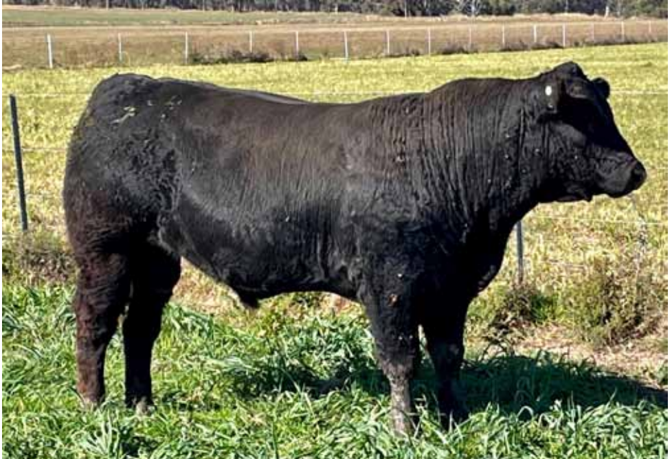
LOT 20 HARLEES ROMEO (HP*) (B) (PN) (AA)