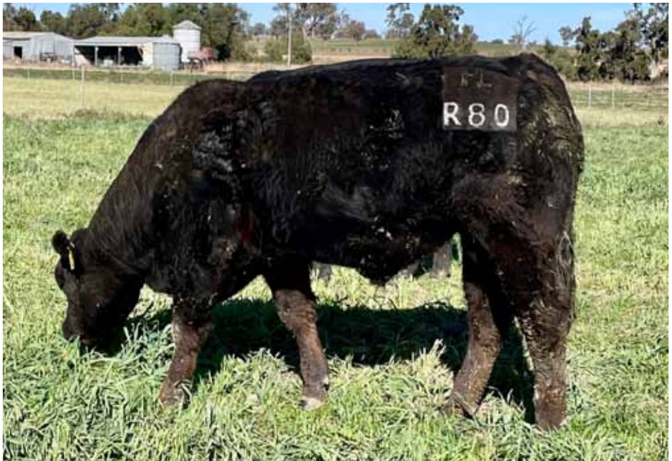
LOT 30 HARLEES REGGIE (P) (B) (PN) (AA)