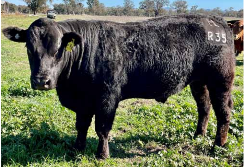
LOT 11 HARLEES RANDY (HP*) (B) (PN) (AA)