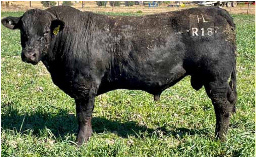
LOT 5 HARLEES RHYS (HP*) (B) (PN) (AA)