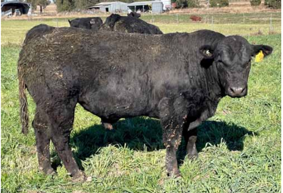
LOT 31 HARLEES RICHARD (HP*) (B) (PN) (AA)