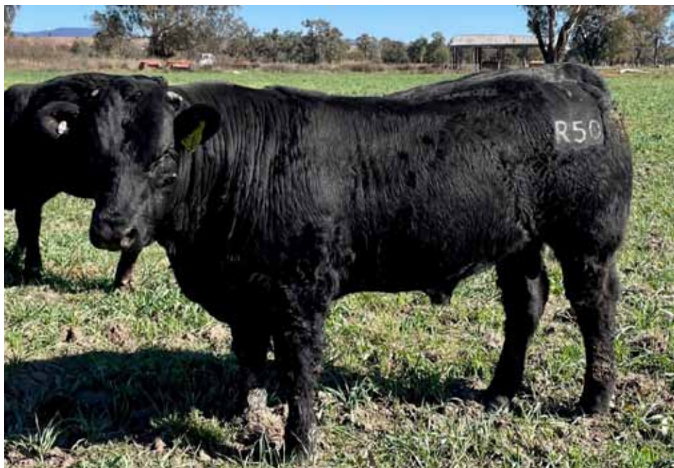
LOT 18 HARLEES RAINMAKER (P) (B) (PN) (AA)