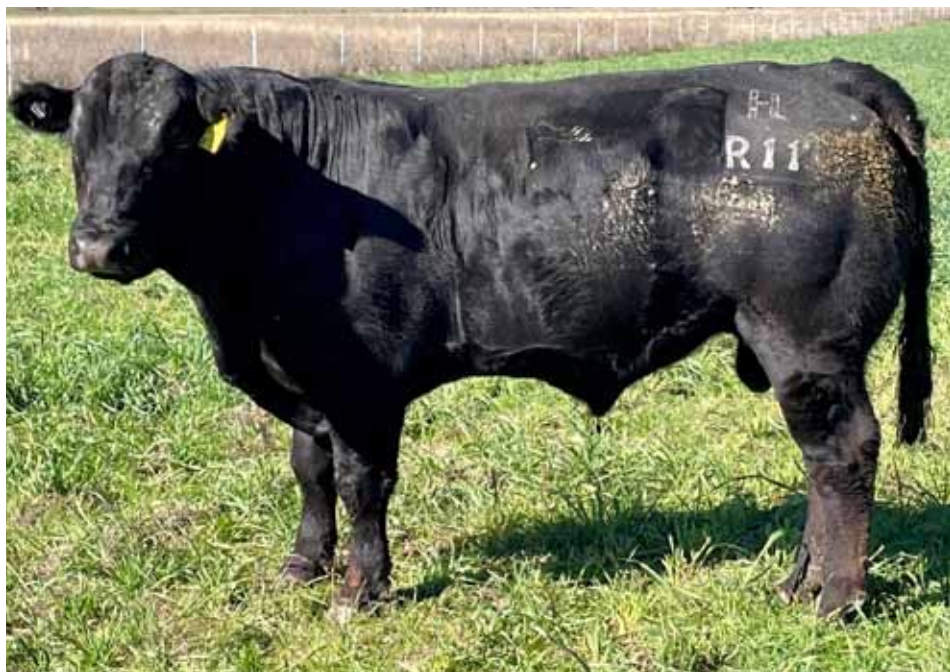
LOT 2 HARLEES RELFIE (HP*) (HB*) (PN) (AA)