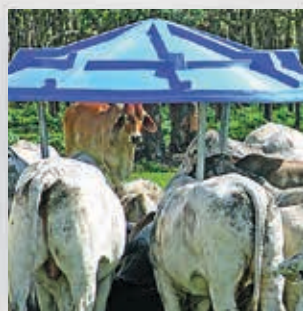
LICKROOF & TROUGHS