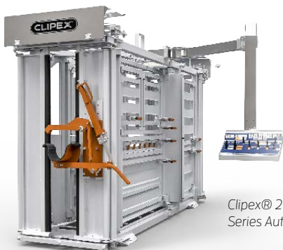
Clipex® 2000 Series Auto Crush