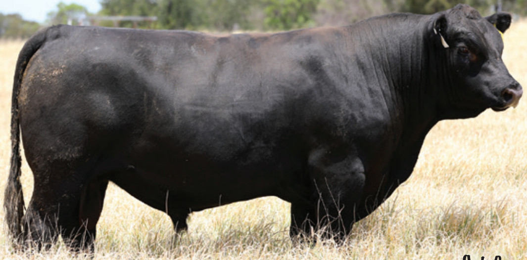
Lot 6 Wallangra Righthistime R17#