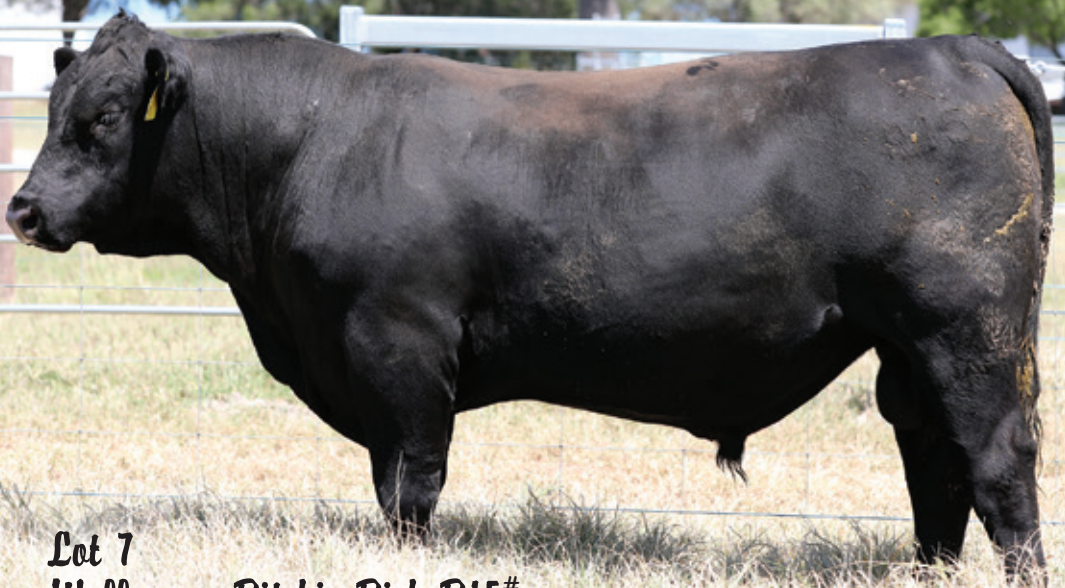
Lot 7 Wallangra Ritchie Rich R15#