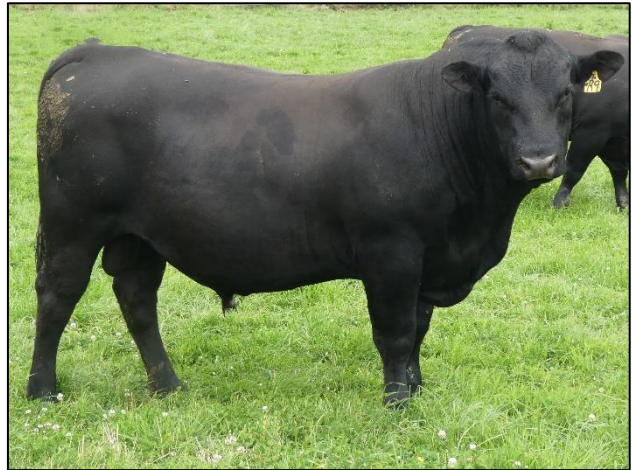
LOT 8 LONDAVRA MARLON BRANDO R9