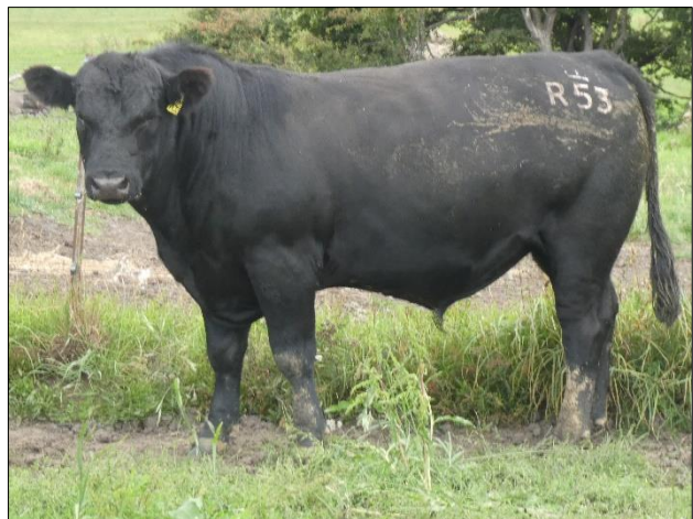
LOT 12 LONDAVRA STEWIE R53