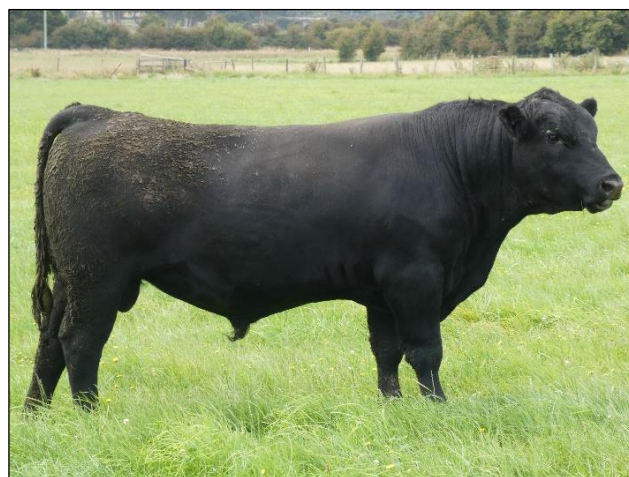
LOT 21 LONDAVRA REAR VIEW R80