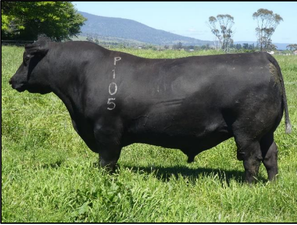
CIRCLE 8 REAR VIEW MIRROR P105