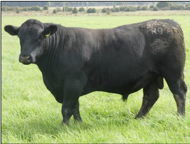
LOT 9 LONDAVRA DISTINCTION R97