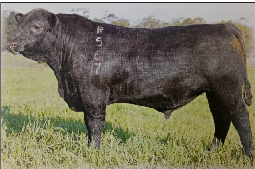
CIRCLE 8 R567 SON OF MILLAH MULLAH PARATROOPER P15 Purchased at the 2021 Circle 8 Sale for $44000