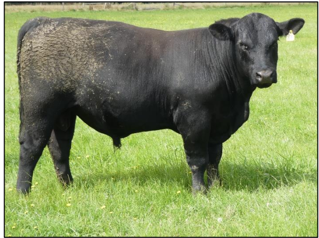
LOT 2 LONDAVRA EDMUND R23