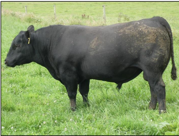
LOT 13 LONDAVRA KRAKATOA R10