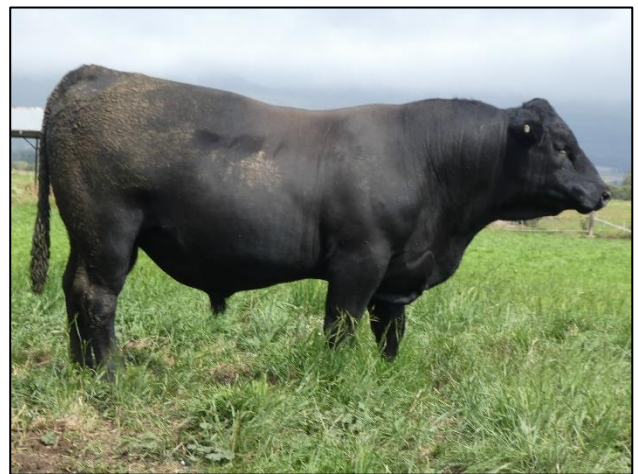
LOT 4 LONDAVRA DISTINCTION R88