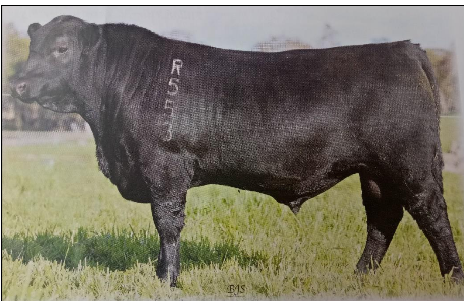
CIRCLE 8 R553 SON OF MILLAH MURRAH PARATROOPER P15 Purchased at the 2021 Circle 8 Sale for $44000.