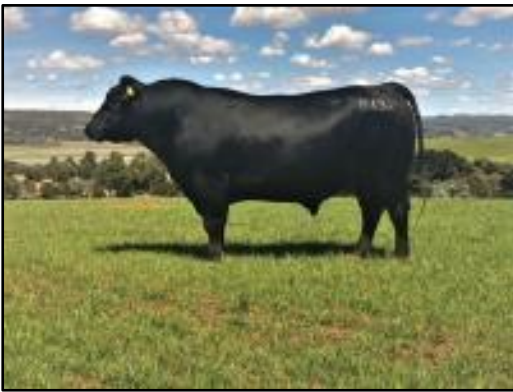
LANDFALL KEYSTONE K132