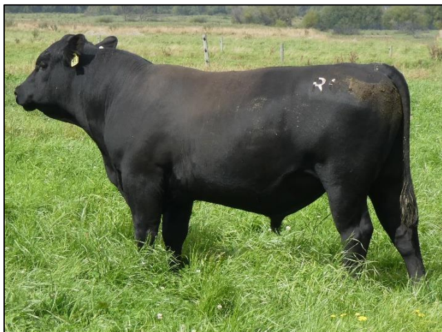
LOT 20 LONDAVRA SYDGEN R61