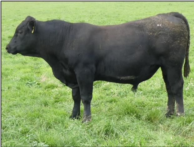
LOT 7 LONDAVRA SYDGEN R96