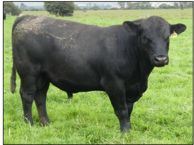
LOT 14 LONDAVRA SYDGEN R91