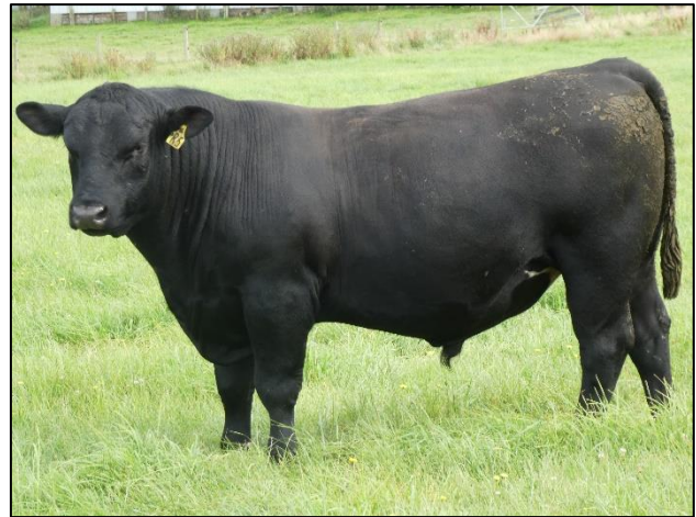
LOT 10 LONDAVRA EDMUND R5