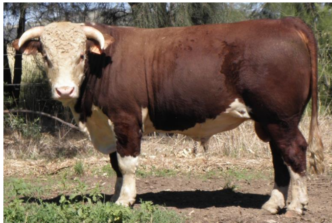
Lot 11 – Kirraweena Rotorua