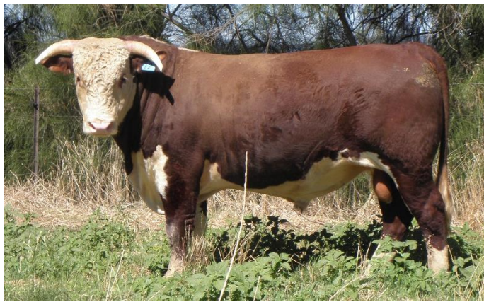
Lot 12 – Glenholme Remus