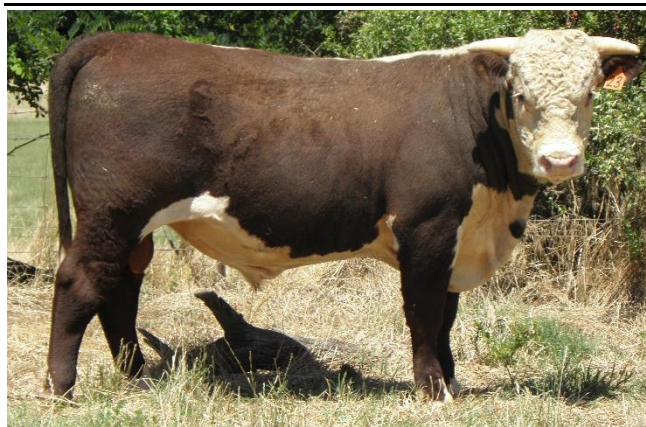
Lot 23 – Kirraweena Ringo