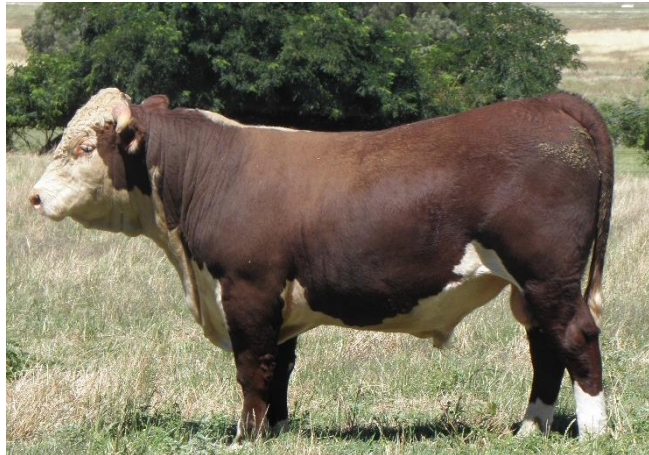
Lot 22 – Kirraweena Rusty