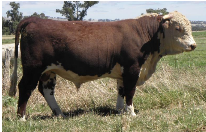
Lot 24 – Kirraweena Rex