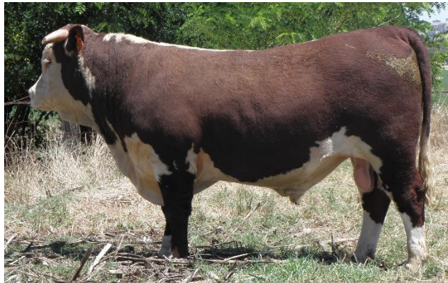
Lot 20 – Kirraweena Rodwell