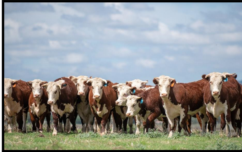
Kirraweena & Glenholme Heifers from 2021 Sale All sold to Hereford and Poll Hereford Studs

CONSISTENTLY BREEDING QUALITY, EASY DOING, QUIET HEREFORDS SINCE 1953