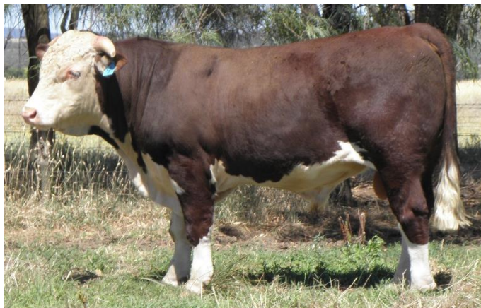
Lot 9 - Glenholme Reardon