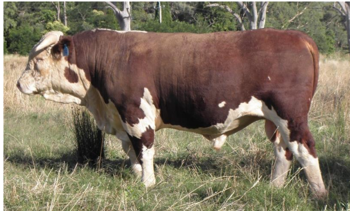
Lot 14 – Glenholme Rowan