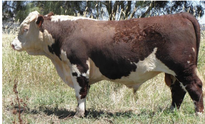
Lot 7 – Kirraweena Ramien