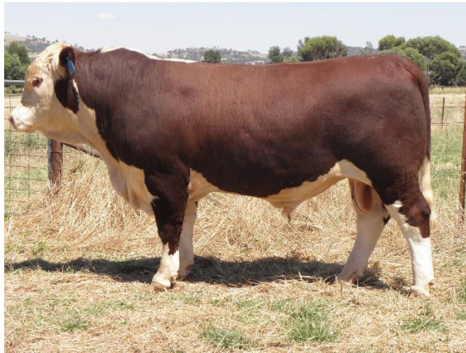
Lot 16 – Glenholme Reuban