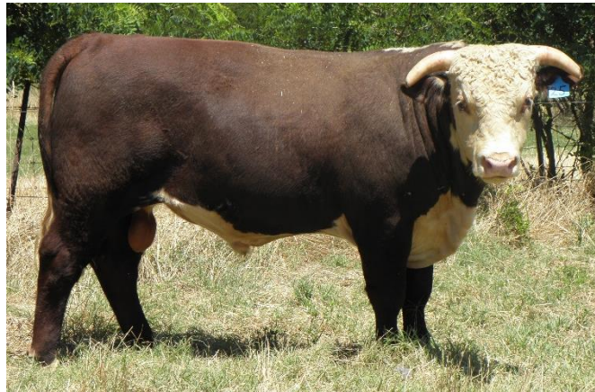
Lot 25 – Glenholme Ramsay