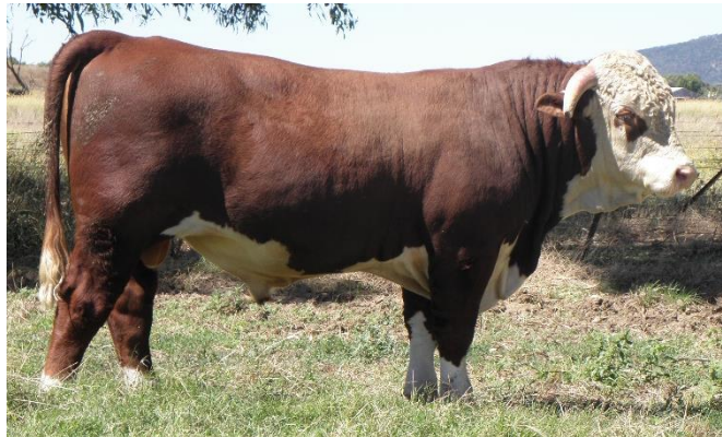
Lot 5 – Glenholme Red