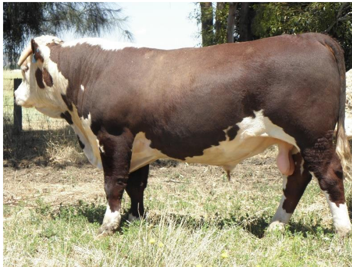
Lot 4 – Glenholme Rafael