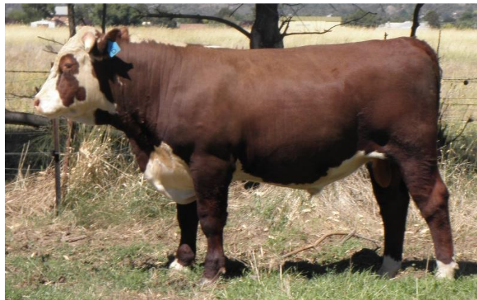
Lot 6 – Glenholme Reddy