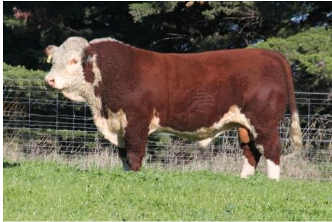
Pute Nascar N13 – Future AI Sire. Bull calves will be available 2023.