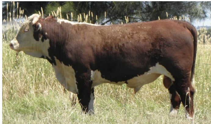
Lot 10 – Glenholme Ringer