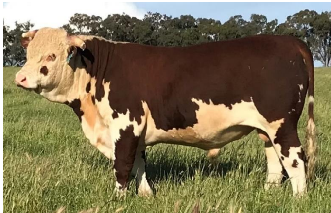
Lot 13 – Glenholme Rackemann