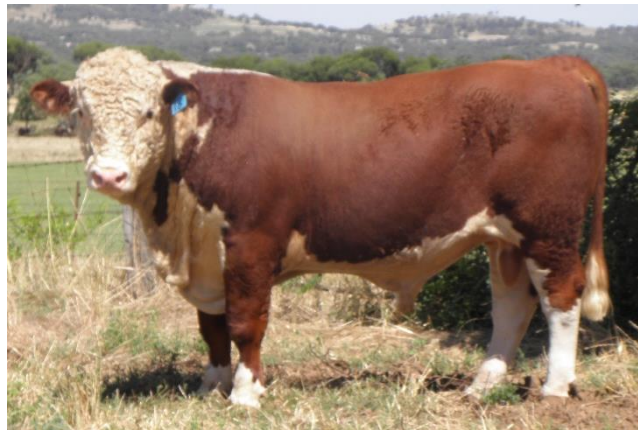
Lot 18 – Glenholme Ranger